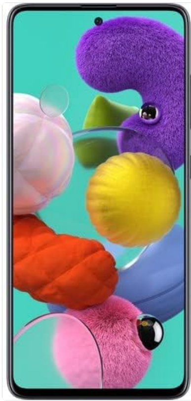
Image: Front view of the Samsung Galaxy A51 display.