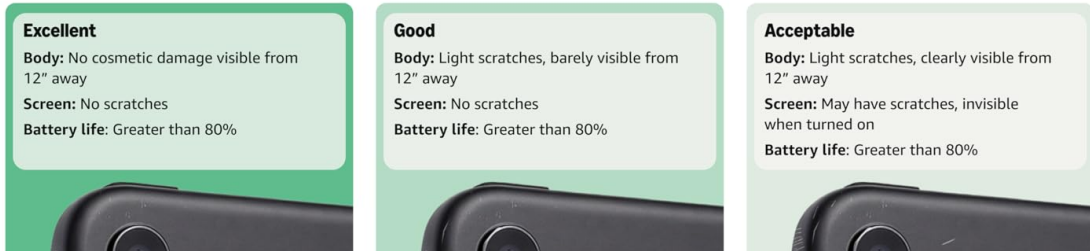
Image: Amazon Renewed conditions for product quality.

Example body scratches and dents – not actual products