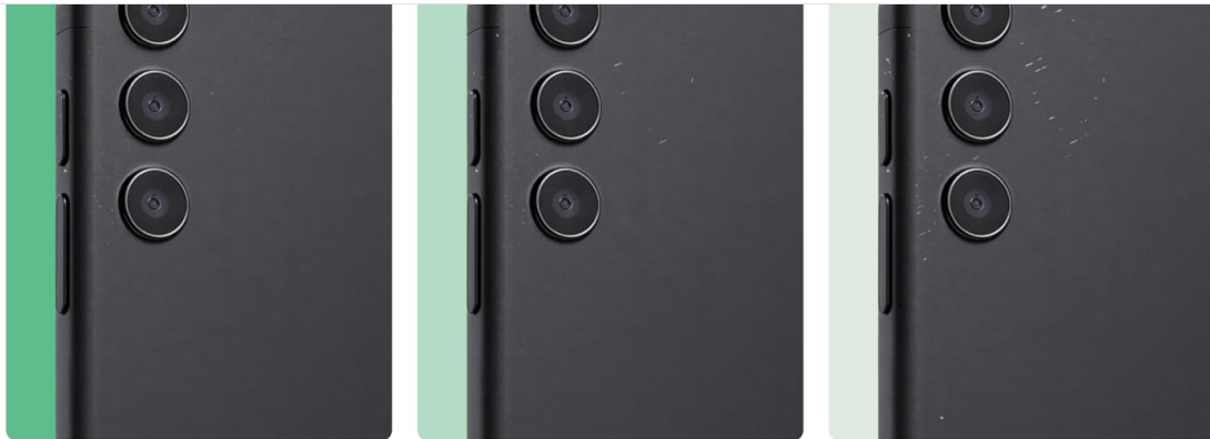
Image: Amazon Renewed conditions for product quality.