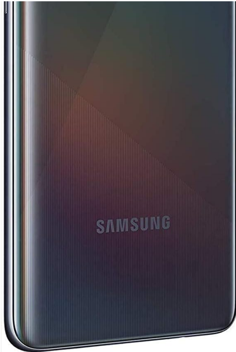
Image: Rear view of the Samsung Galaxy A51.