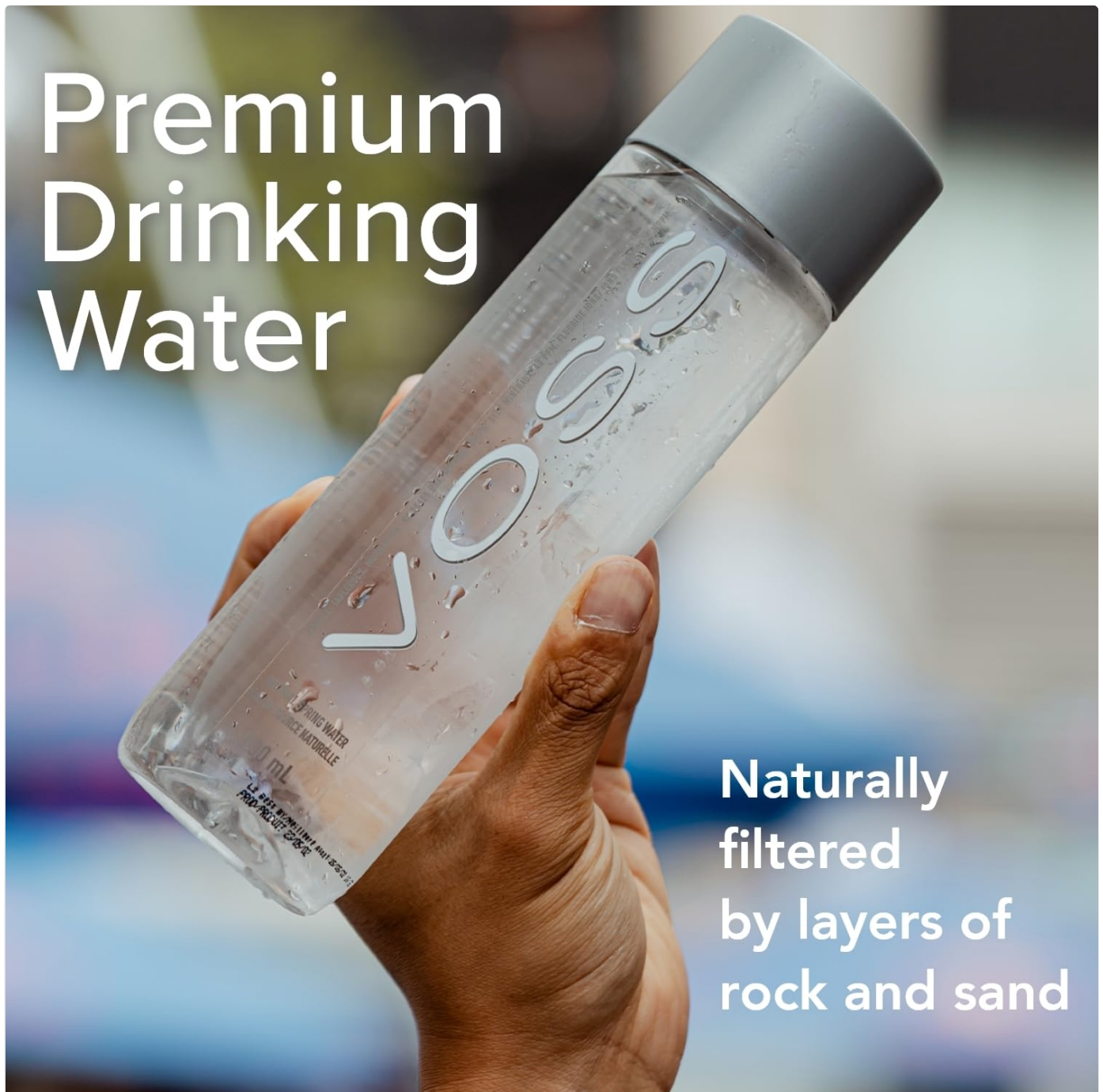
Image: Enjoying VOSS water on the go.