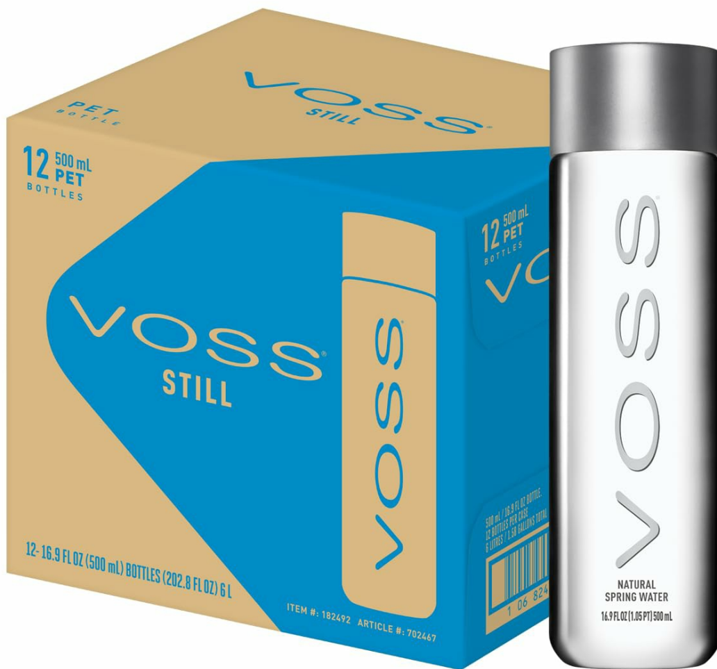
Image: VOSS Premium Still Water 12-pack packaging and a single bottle.