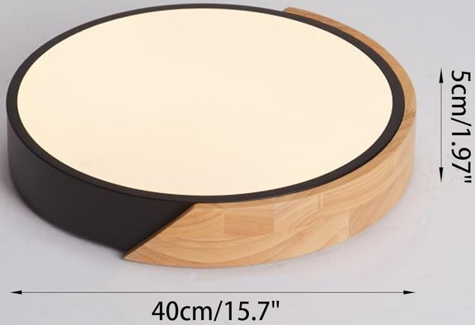
Figure 4.1: Lamp body dimensions.