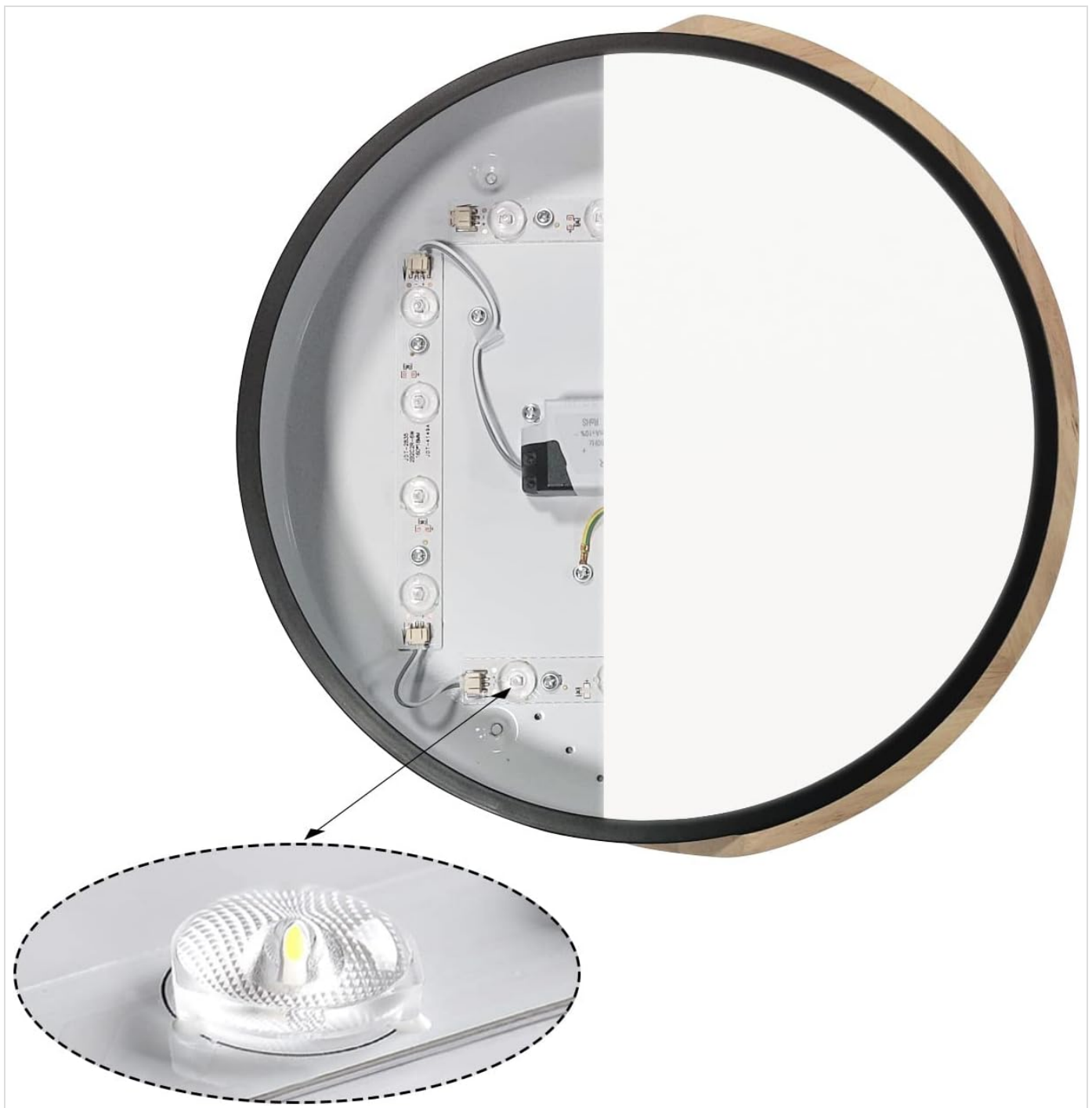
Figure 5.2: Color Temperature Adjustment Options.