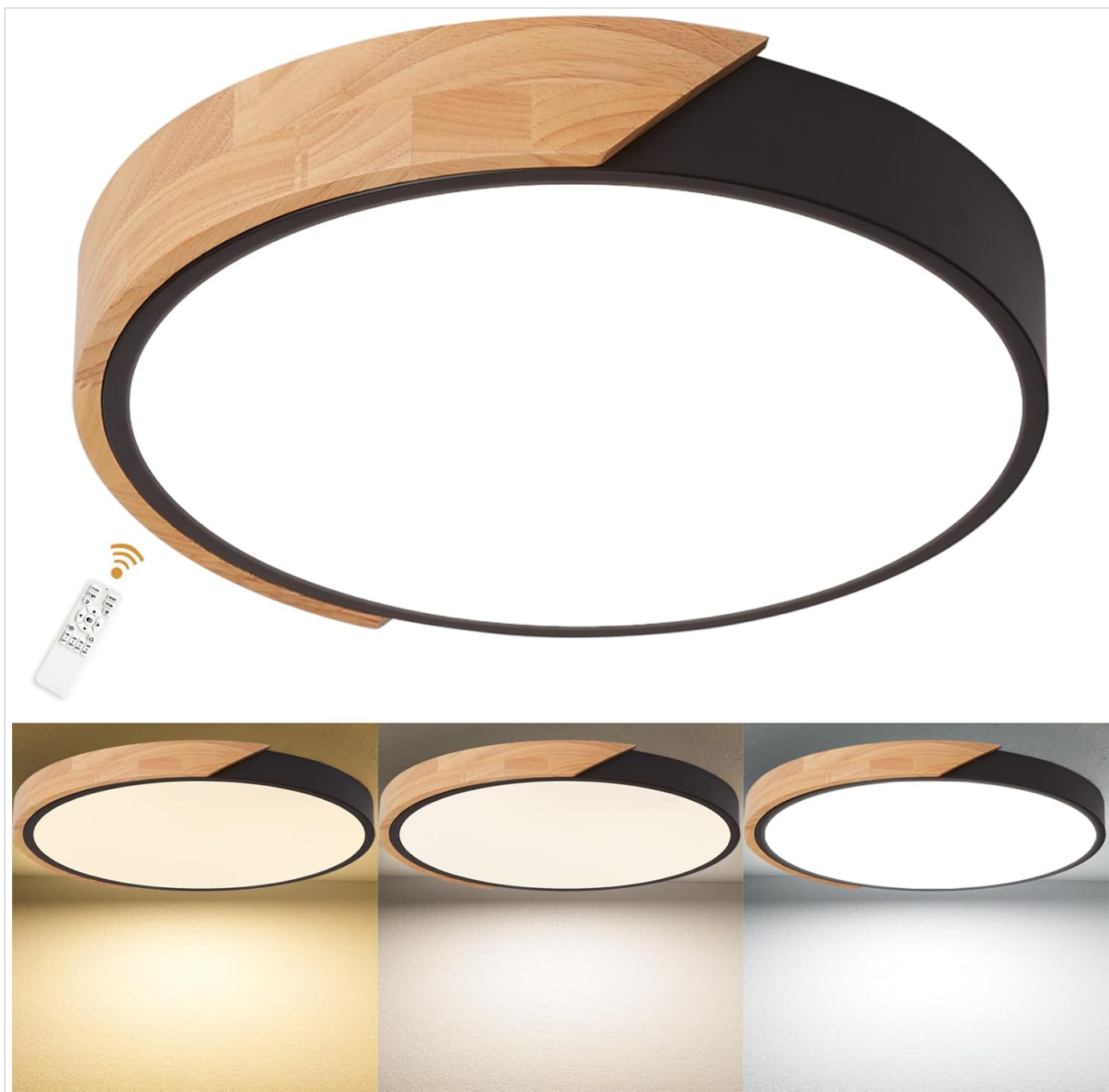
Figure 1.1: LuFun Flush Mount Ceiling Light and its adjustable color temperatures.