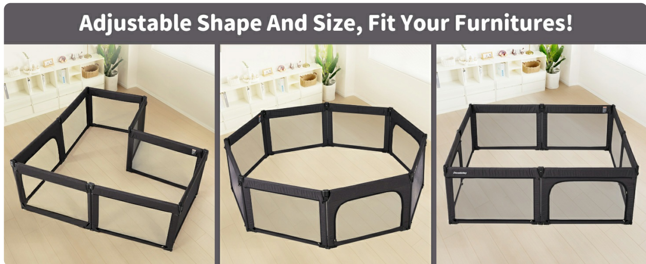
Image: Examples of the playpen configured in different shapes to adapt to various home environments and furniture arrangements.