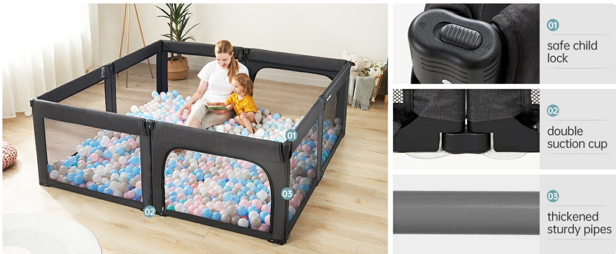
Image: Detailed view of the playpen's safety features, including the breathable mesh, secure locking mechanism, and robust pipe thickness.