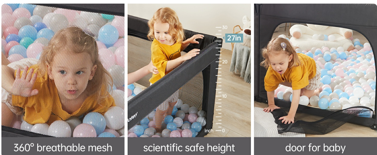
Image: Features of the playpen, including the breathable mesh for visibility, the scientifically determined safe height, and the convenient zipper door for access.