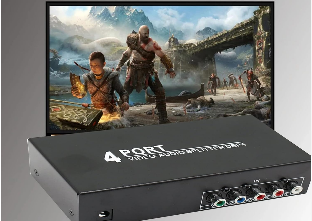
Figure 3: Multiple Display Output. This image demonstrates the splitter's capability to send the same video and audio signal to up to four displays simultaneously.