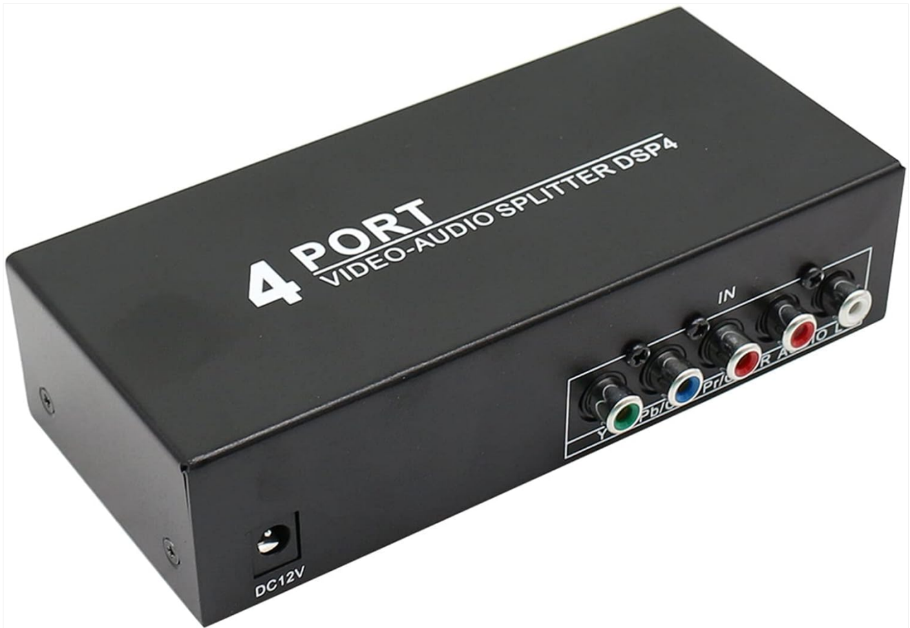
Figure 2: BolAAzuL 1X4 Splitter Input Side. This image shows the single set of component video (YPbPr) and L/R audio input jacks, along with the DC12V power input.