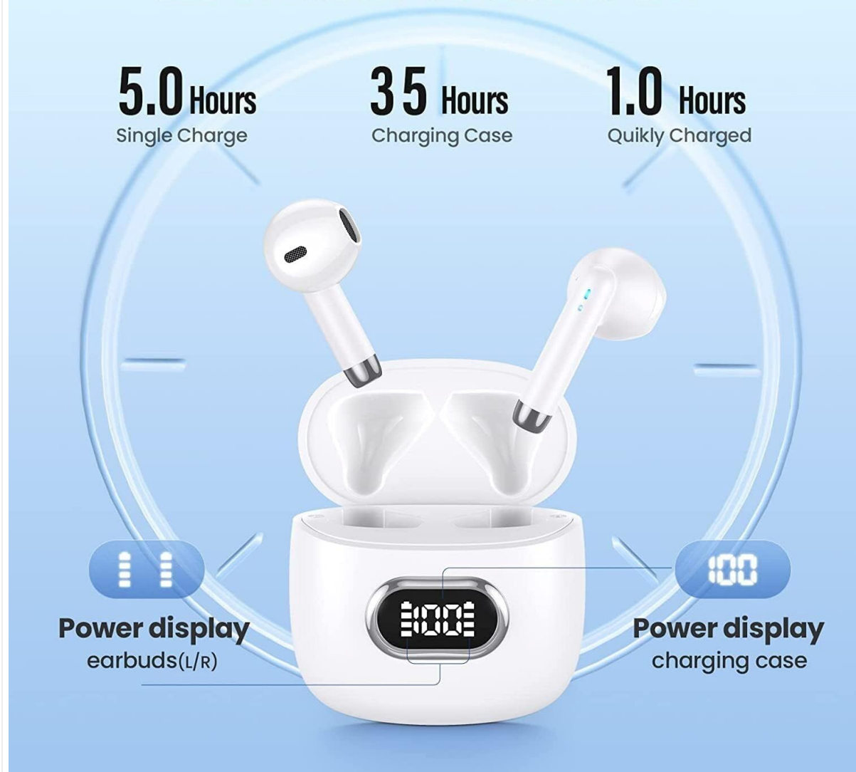
Image: The charging case displaying battery levels for the case and individual earbuds, indicating 5 hours of single charge, 35 hours with the charging case, and 1 hour quick charge.