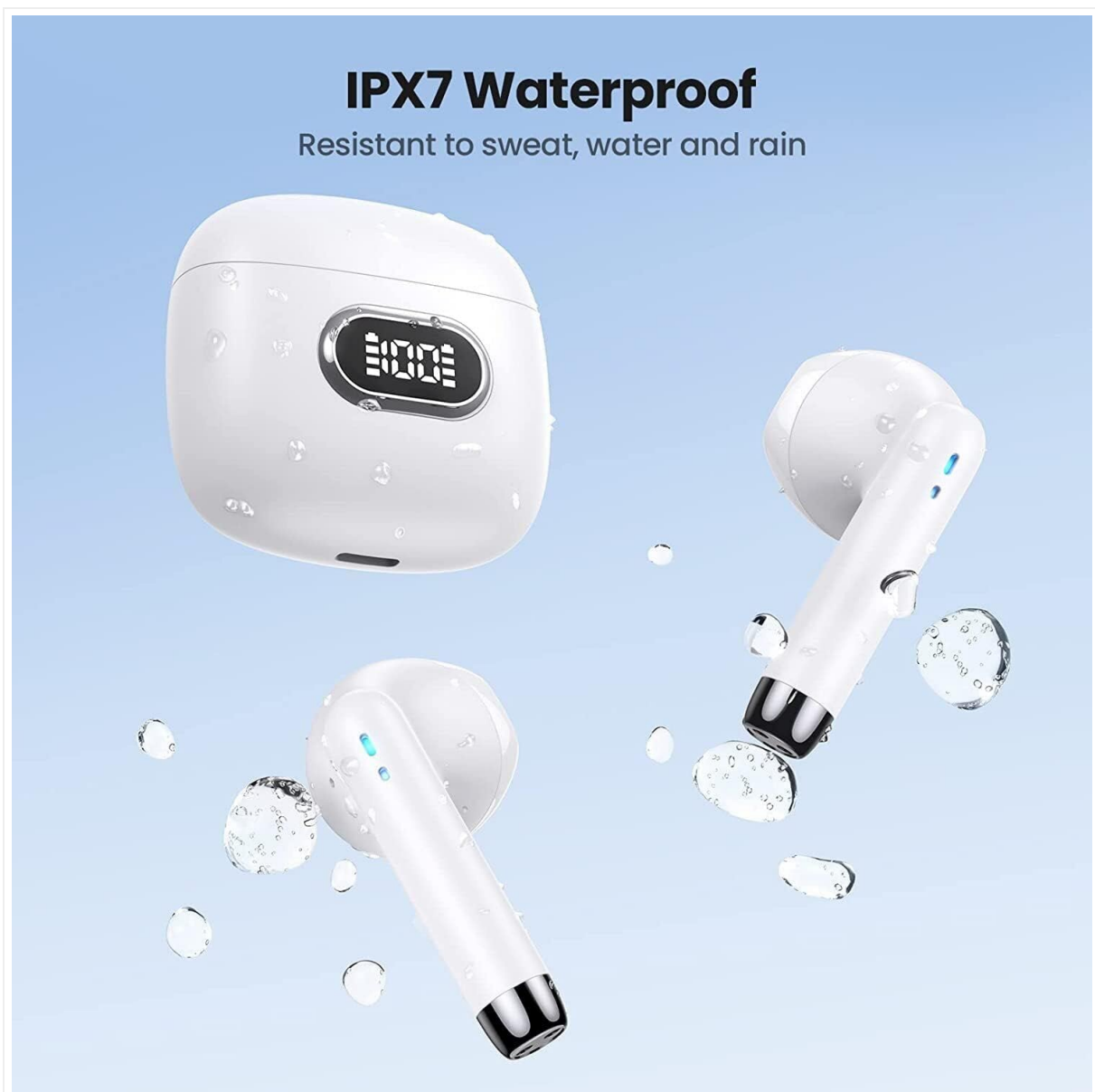
Image: The SGNICS IAI115 earbuds and charging case shown with water droplets, illustrating their IPX7 waterproof rating and resistance to sweat, water, and rain.

The SGNICS IAI115 earbuds and charging case are IPX7 waterproof, meaning they are resistant to sweat, splashes, and rain. They can withstand immersion in water up to 1 meter for 30 minutes. However, they are not designed for swimming or prolonged submersion.