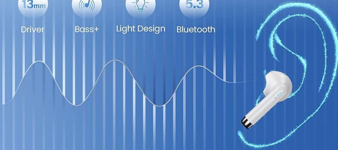
Image: An exploded view of an earbud highlighting the 13mm dynamic driver, emphasizing the authentic sound and deep bass capabilities.