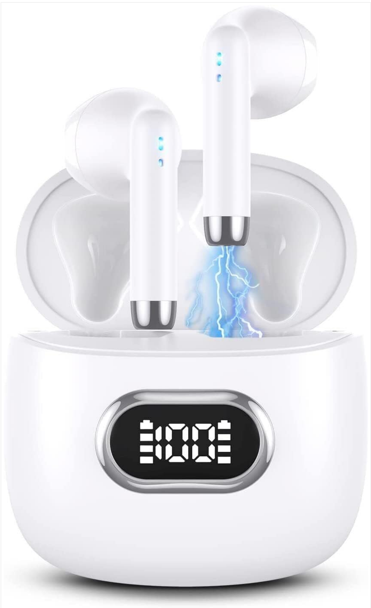
Image: The SGNICS IAI115 Wireless Earbuds in their charging case, illustrating the overall design and LED display.