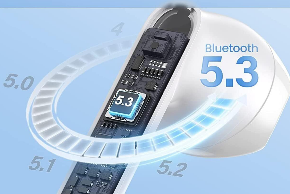
Image: Diagram illustrating the benefits of Bluetooth 5.3 technology, including more stable connection, lower power consumption, longer transmission range, and lower latency.