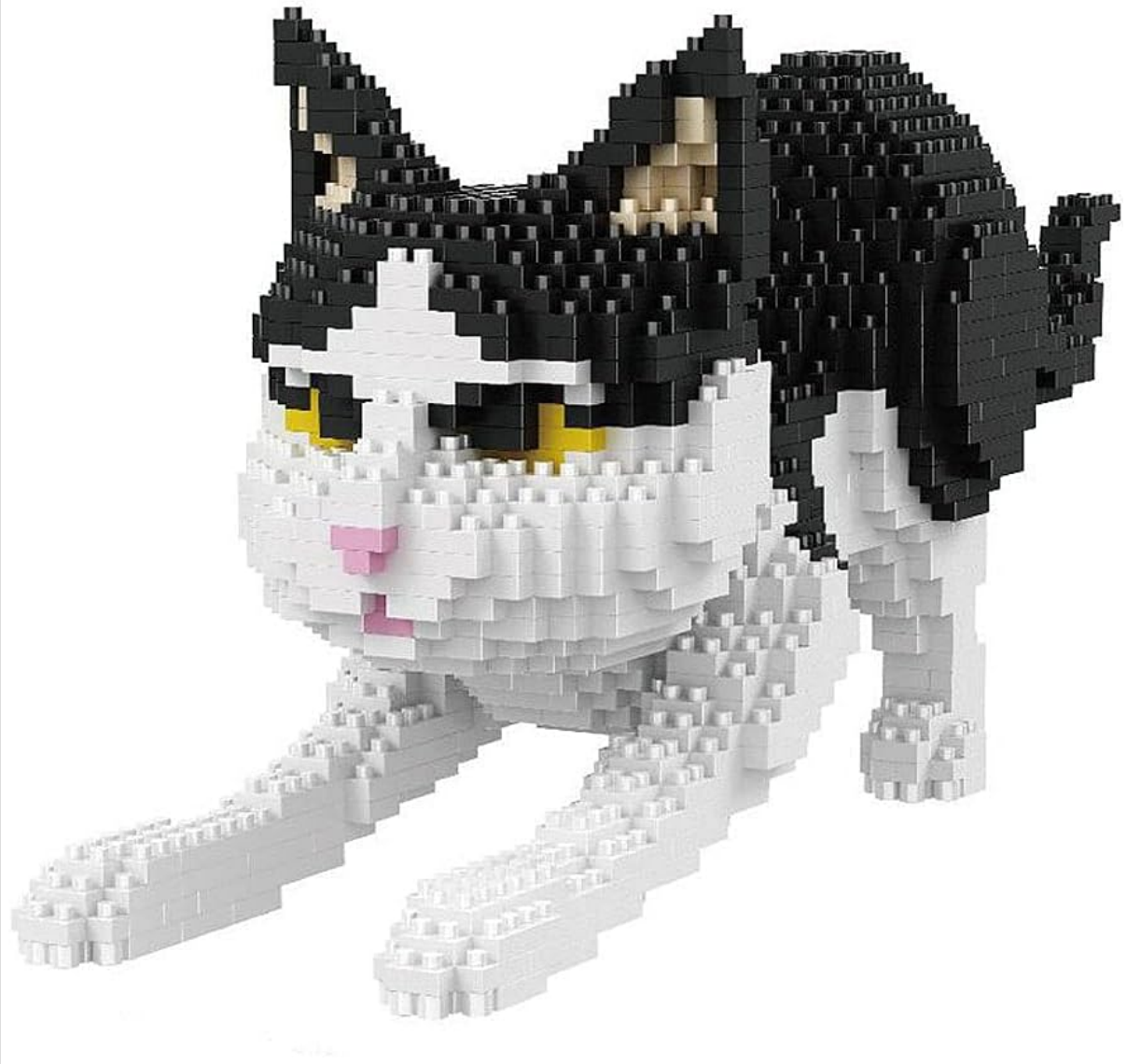
Figure 3: Completed Cat Model. This image shows the fully assembled ISeeSee Mini Cat Building Blocks model, demonstrating the final appearance of the black and white cat.