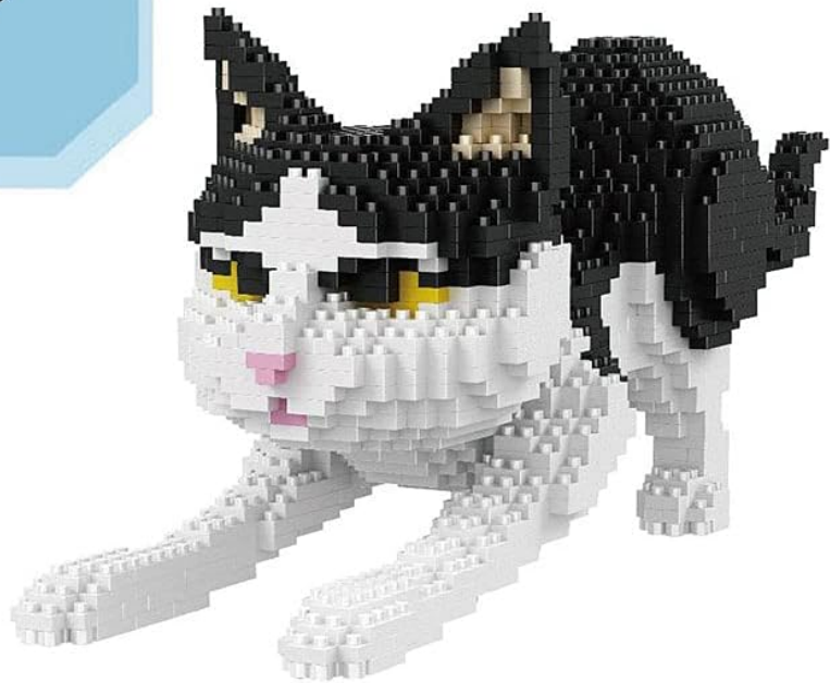
Figure 1: Product Details. This image illustrates the product's material (ABS), the total number of particles (1390PCS), and the recommended applicable age (14+).