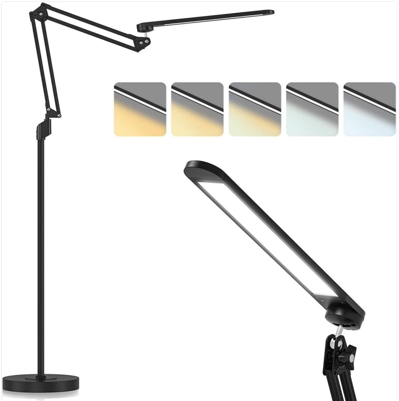
Image: The VEYFIY Floor Lamp VE-HFL002, showcasing its sleek black design and the range of five available color temperatures.