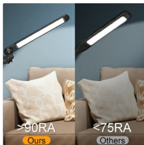
Image: A visual comparison demonstrating the superior color rendering (CRI >90) of the VEYFIY lamp compared to other lamps with lower CRI values.