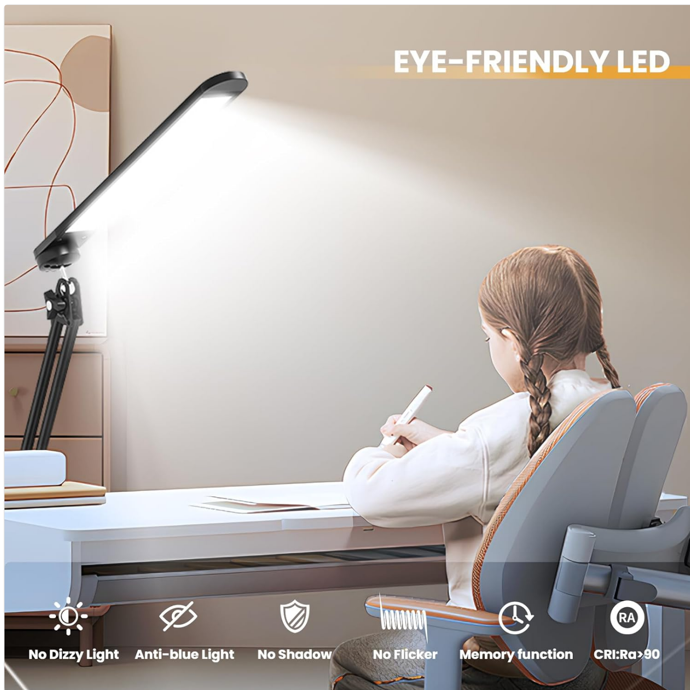
Image: A user engaged in an activity under the lamp, with visual cues emphasizing the lamp's eye-caring attributes, including anti-blue light and high CRI.