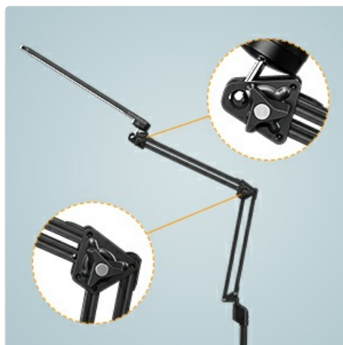
Image: Close-up of the adjustable arm joints, demonstrating the lamp's flexible design.