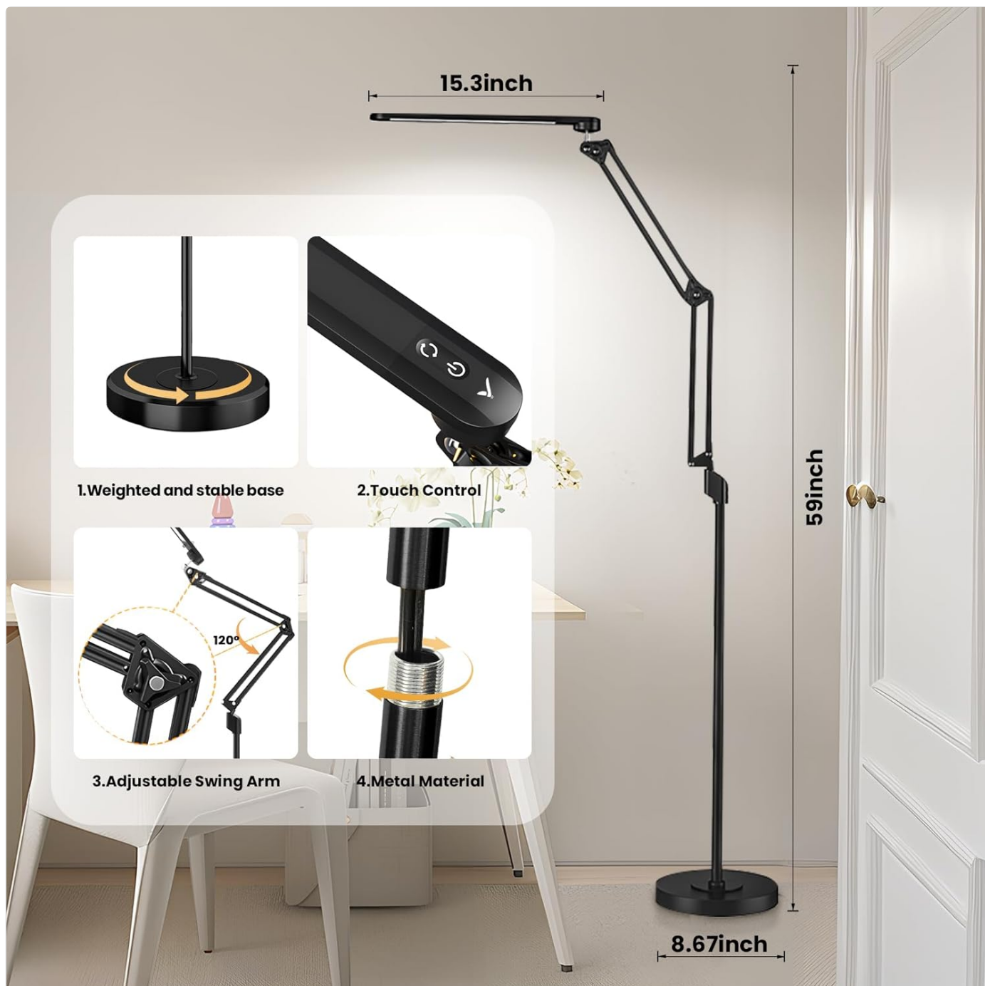
Image: A detailed diagram illustrating the lamp's dimensions, weighted base, touch control, adjustable swing arm, and metal construction, highlighting the ease of assembly.

Your browser does not support the video tag.