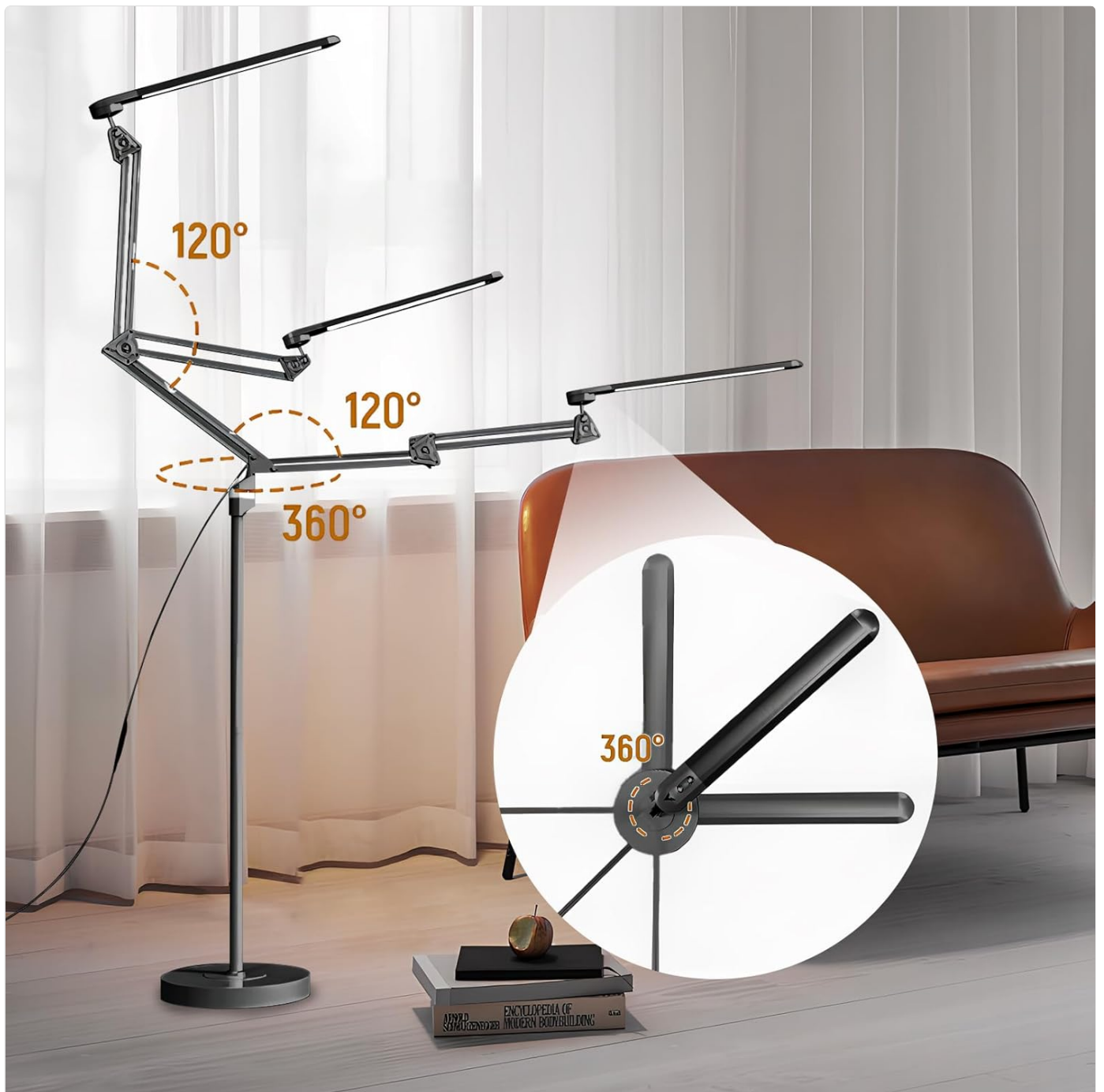
Image: A visual representation of the lamp's adjustable swing arm, showing its 120-degree and 360-degree rotation capabilities for optimal light positioning.