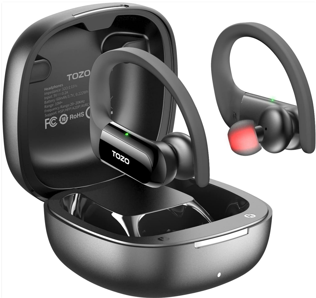
Image: TOZO T5 True Wireless Earbuds in their charging case, showcasing the design and fit.