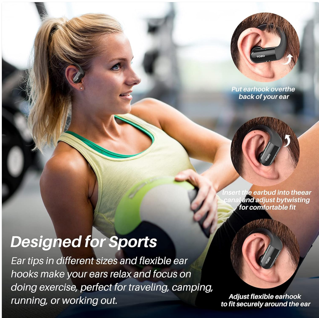
Image: A person wearing the TOZO T5 earbuds, with detailed insets showing how to position the earhook and insert the earbud for a secure fit.