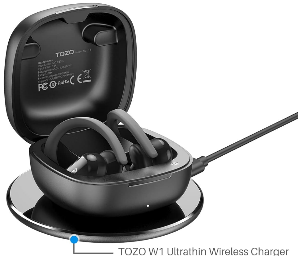
Image: The TOZO T5 charging case being charged wirelessly on a charging pad, illustrating its wireless charging capability.