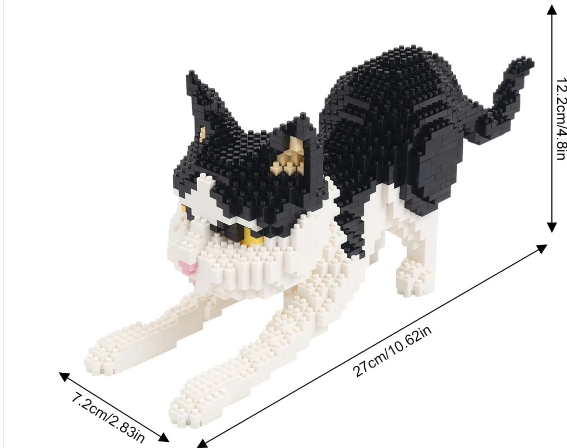
Image 2.1: Reference image illustrating the small scale of the micro building blocks.