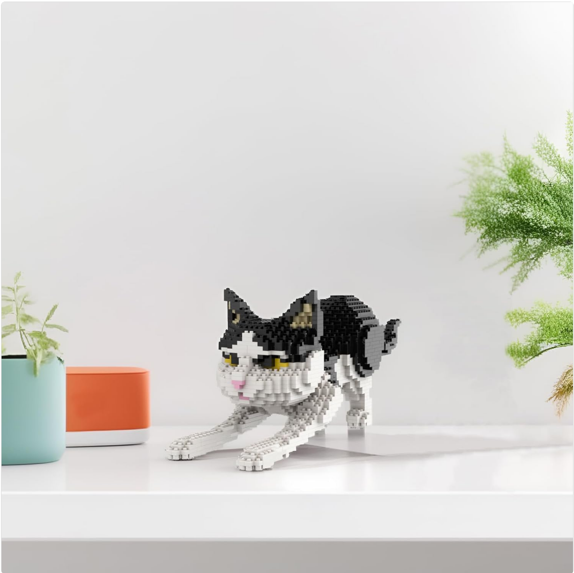
Image 1.1: The completed Larcele Black and White Cat Micro Building Blocks model displayed on a shelf.