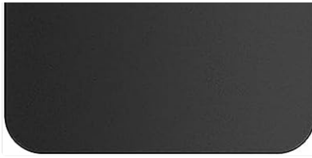
Image: Side view of the remote control, indicating the general area for battery insertion.