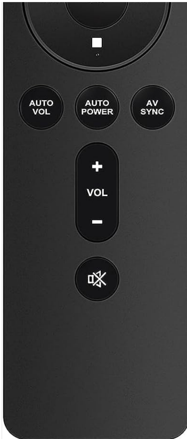
Image: The VINABTY AKB74435311 replacement remote control, showing its full button layout.