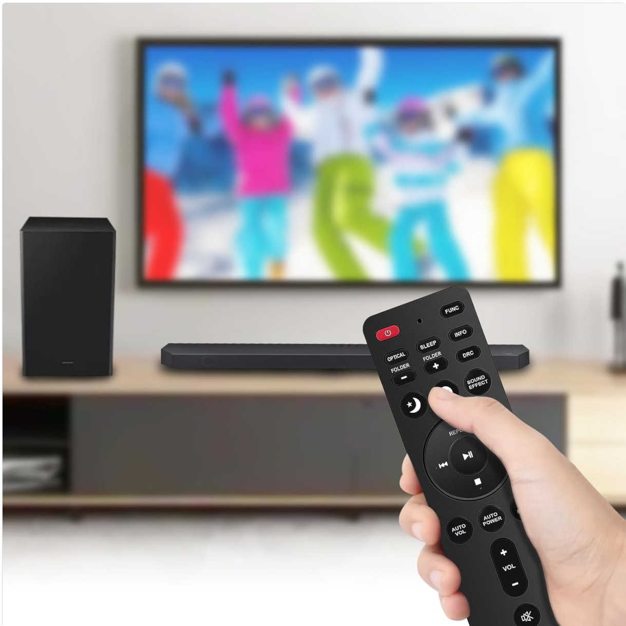
Image: A hand holding the remote control, pointing towards a soundbar and television setup, demonstrating typical usage.