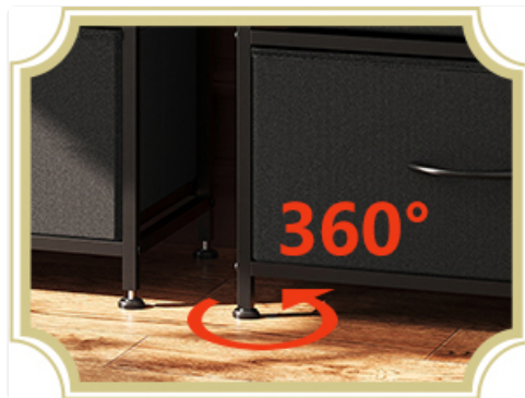
Image: Detail of the adjustable feet, designed to protect flooring and ensure stability on uneven surfaces.