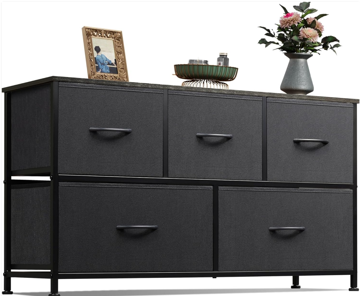
Image: Front view of the assembled WLIVE 5-Drawer Fabric Dresser in Charcoal Black, showcasing its five fabric drawers and wood top.

The WLIVE 5-Drawer Fabric Dresser is a versatile storage solution designed for various rooms such as bedrooms, closets, living rooms, hallways, dorms, and offices. It features a sturdy steel frame, a durable wood top, and five removable fabric drawers, offering ample storage space and a modern aesthetic.