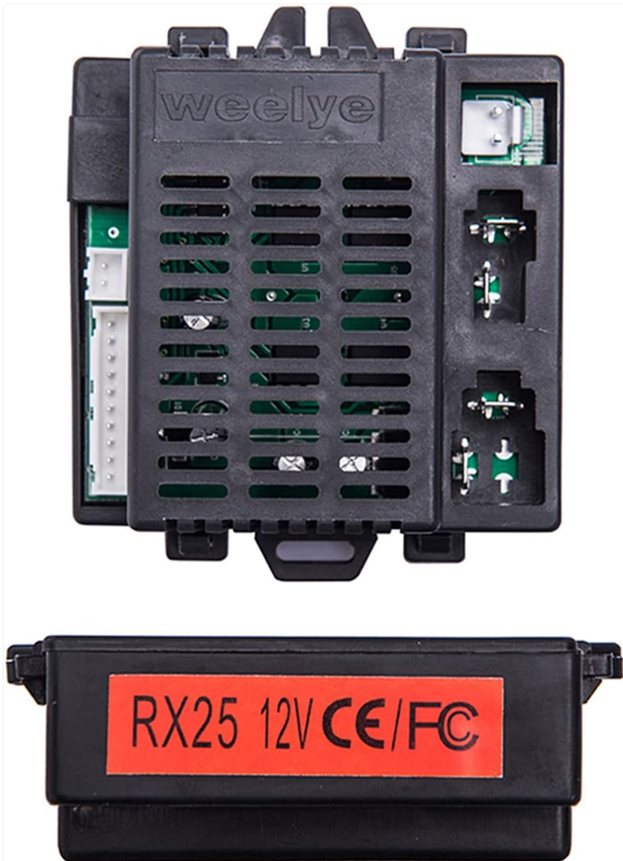
Image: Top view of the weelye RX25 12V receiver, highlighting the 2-pin and 10-pin connection ports.