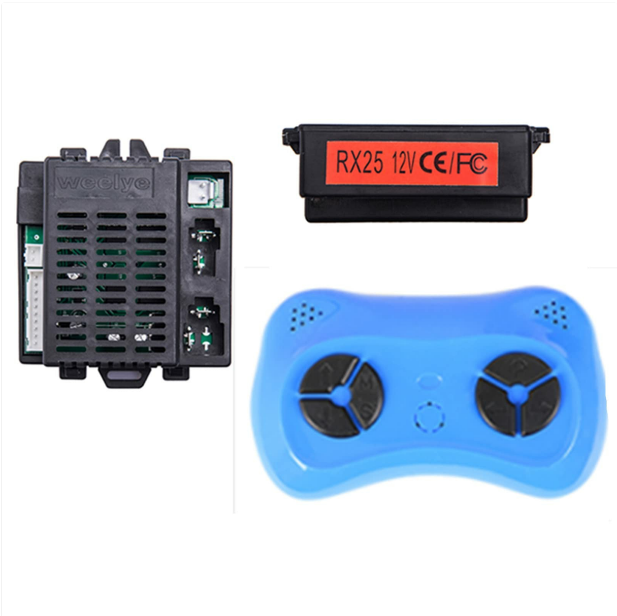
Image: The weelye RX25 12V receiver module and its corresponding label.