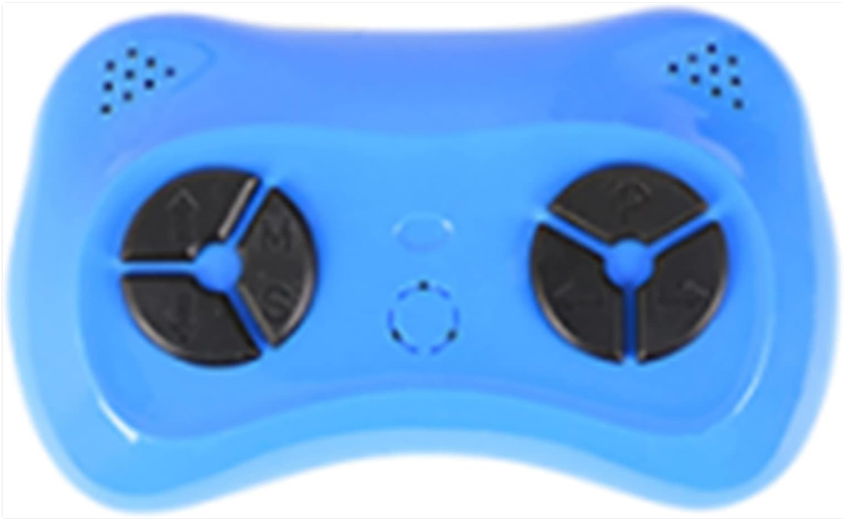
Image: The blue weelye RX25 12V remote control, showing directional buttons, speed (S), and emergency brake (P) buttons.