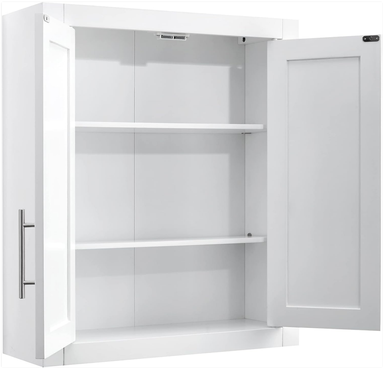
Image: Interior view of the cabinet with doors open, showing the adjustable shelves.