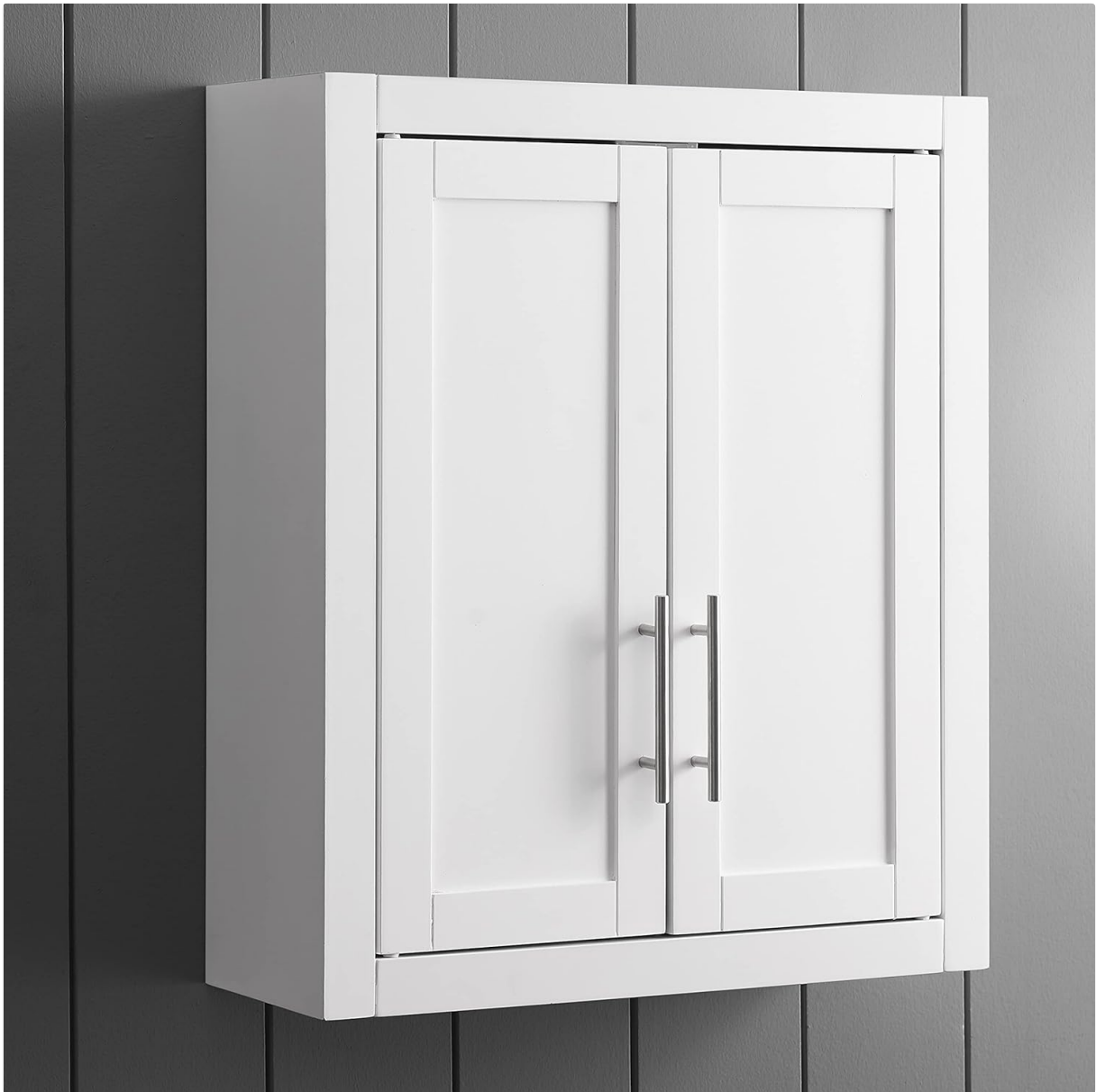
Image: The white Savannah Wall Cabinet securely mounted on a grey paneled wall, doors closed.