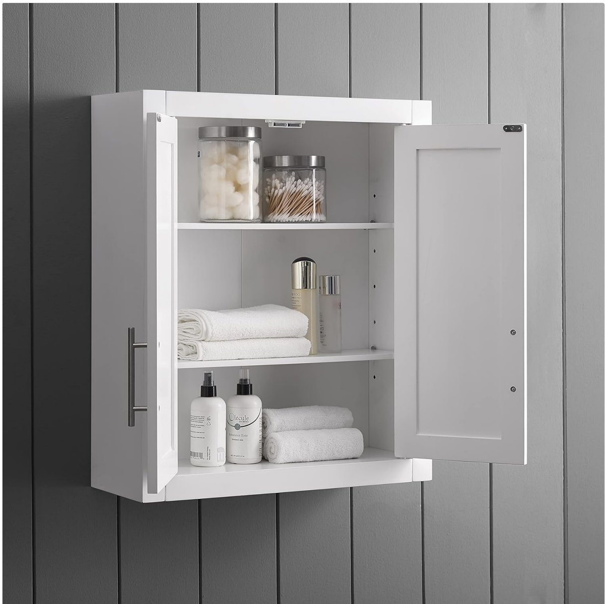
Image: The cabinet with doors open, showcasing various bathroom items like towels, bottles, and cotton swabs stored on the adjustable shelves.