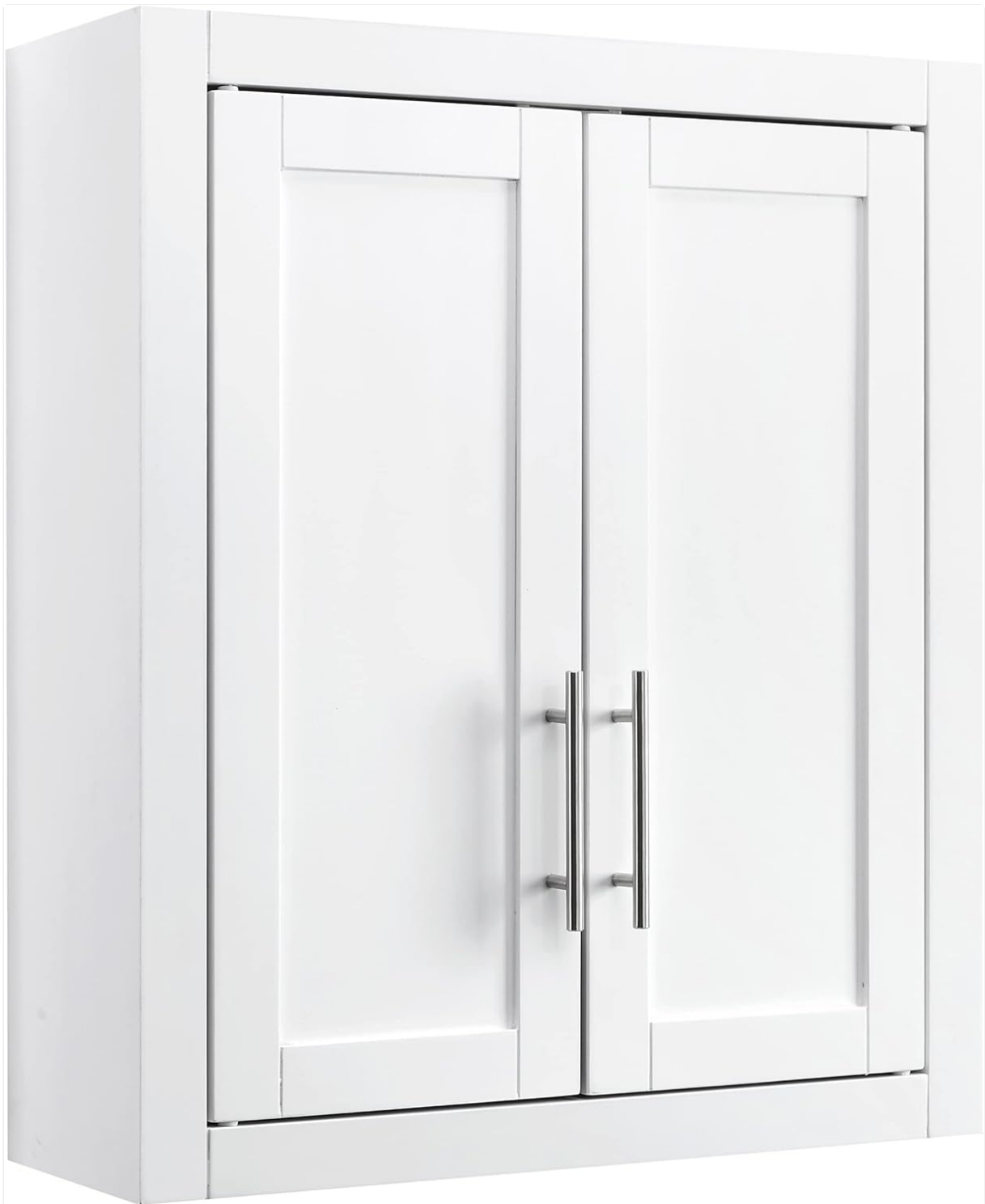
Image: Front view of the Crosley Savannah Wall Mounted Bathroom Storage Medicine Cabinet in white, with doors closed.