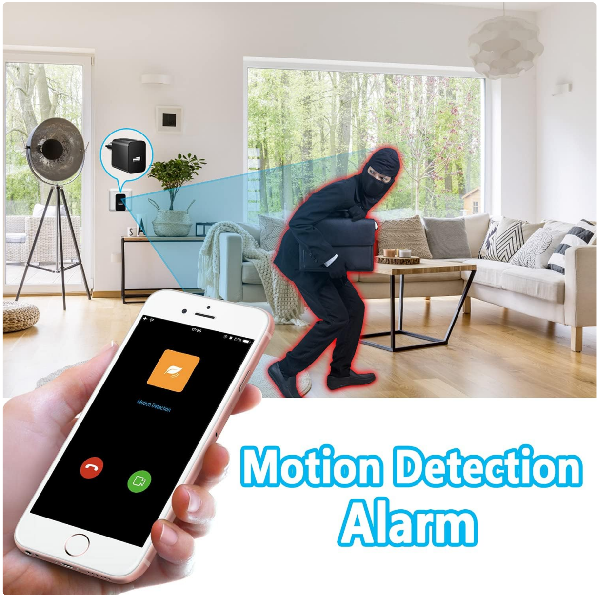
Figure 6: Motion detection alarm feature.