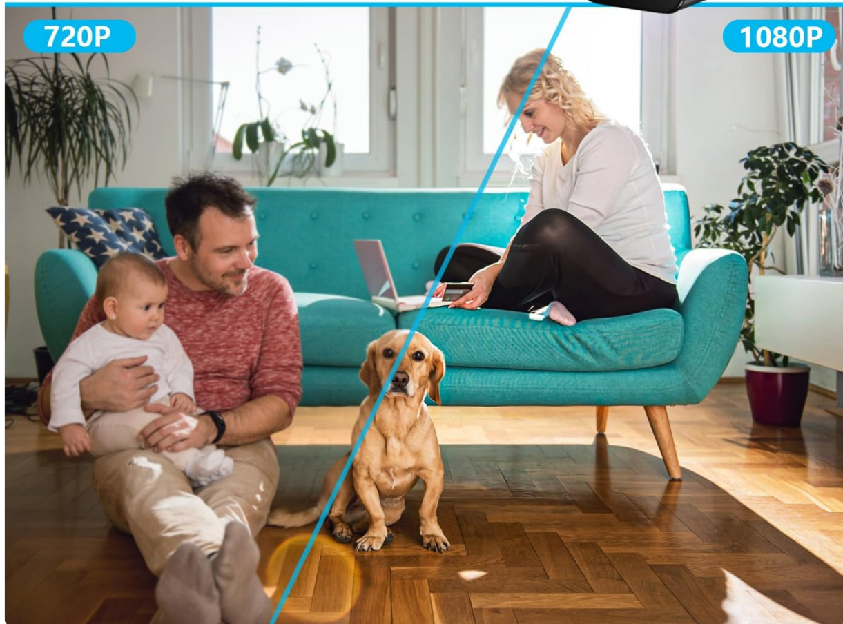
Figure 5: Adjustable video resolution for live streaming.