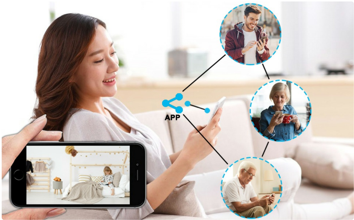
Figure 8: App sharing functionality for multi-user access.