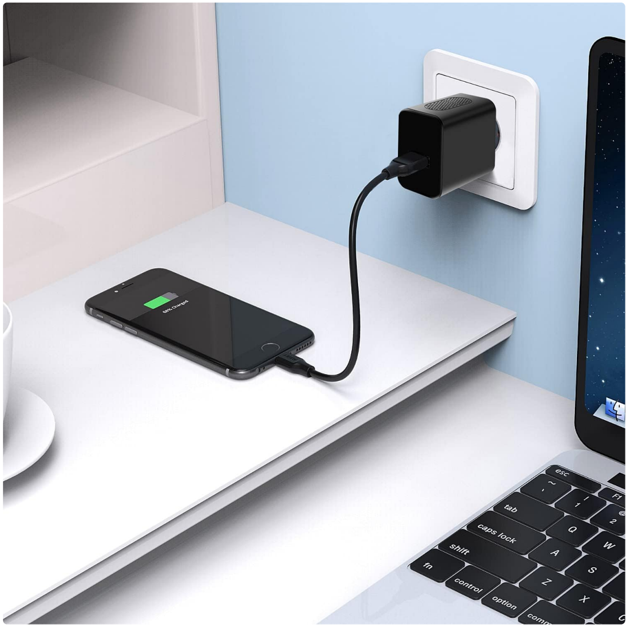
Figure 7: Device charging a smartphone while discreetly recording.