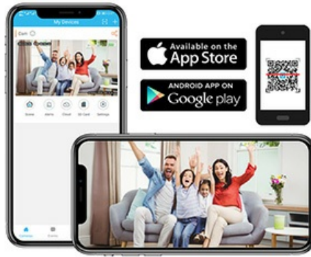
Figure 3: App download options and QR codes.