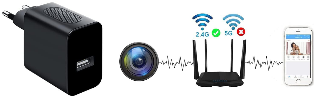
Figure 4: Wi-Fi connection setup, highlighting 2.4 GHz compatibility.