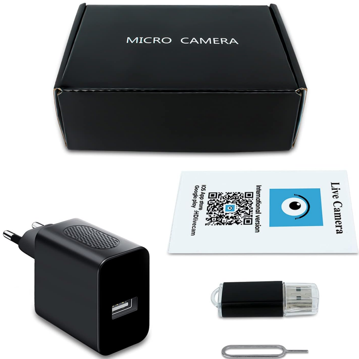
Figure 2: Items included in the product package.