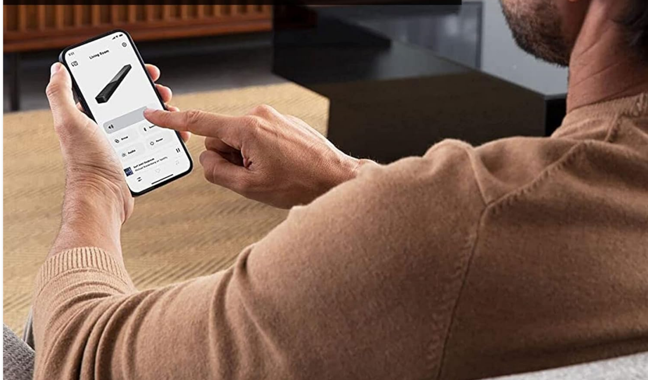
Image: Controlling the soundbar and its features via the Bose Music app on a smartphone.

Exclusive Bose Voice4Video technology expands your Alexa voice capabilities like no other soundbar can. In addition to controlling the Smart Soundbar 900, you can turn on and control your TV, cable, or satellite box with just your voice. One simple ask to Alexa and you can jump to your favorite station, even if your TV was on a different input.