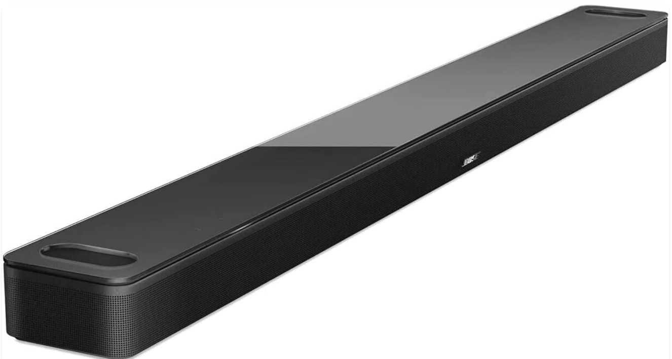
Image: The Bose Smart Soundbar 900, showcasing its elegant black design suitable for any home theater setup.

This manual provides detailed instructions for setting up, operating, maintaining, and troubleshooting your Bose Smart Soundbar 900. Please read it thoroughly to ensure proper use and to maximize your listening experience.