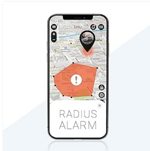
Image: A smartphone screen displaying a notification for a virtual fence being exited, indicating the vehicle has left a designated secure area.