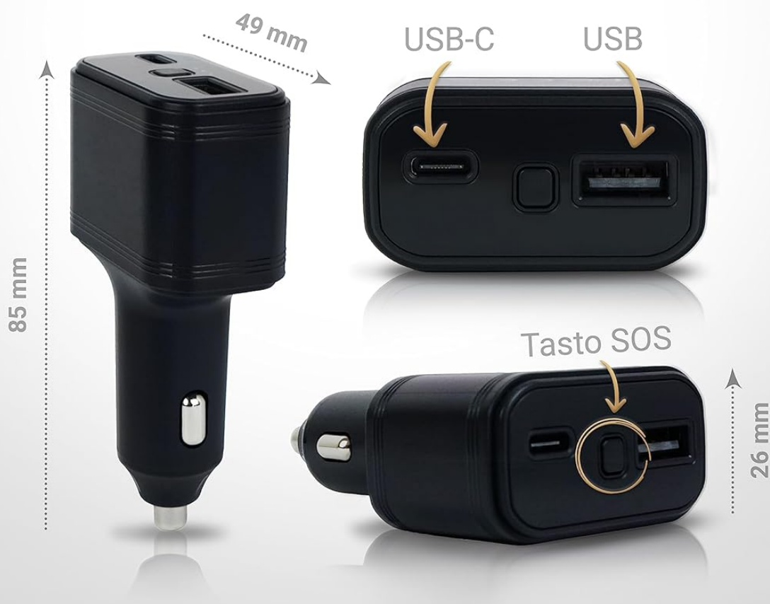
Image: A detailed view of the PAJ USB GPS Finder 4G, highlighting its dimensions, USB-C and USB charging ports, and the SOS button.

Facile connessione tramite presa 12V (accendisigari)