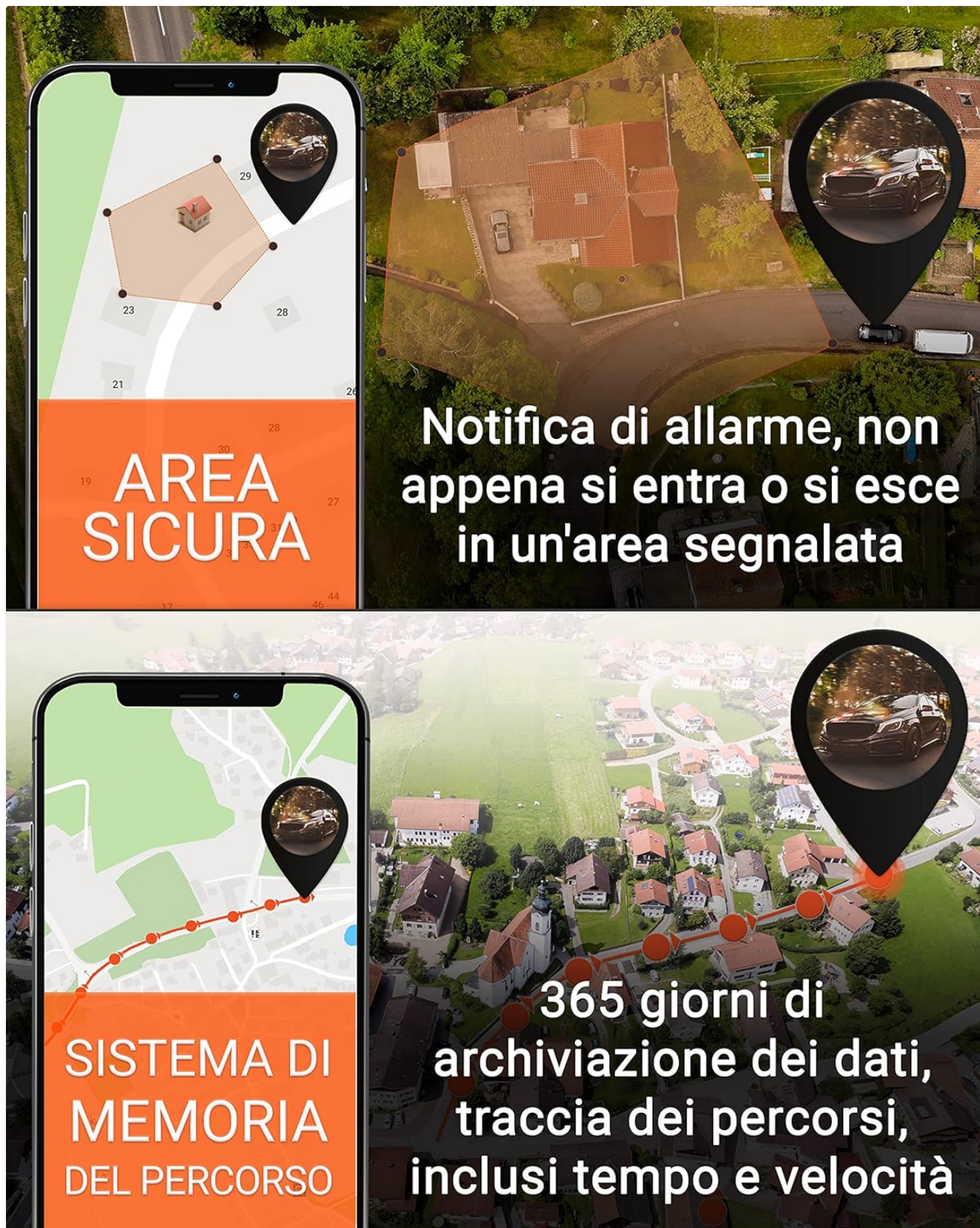
Image: Screenshots of the PAJ GPS Finder application, demonstrating the "Secure Area" geofence notification feature and the "Route History System" for reviewing past travel data.