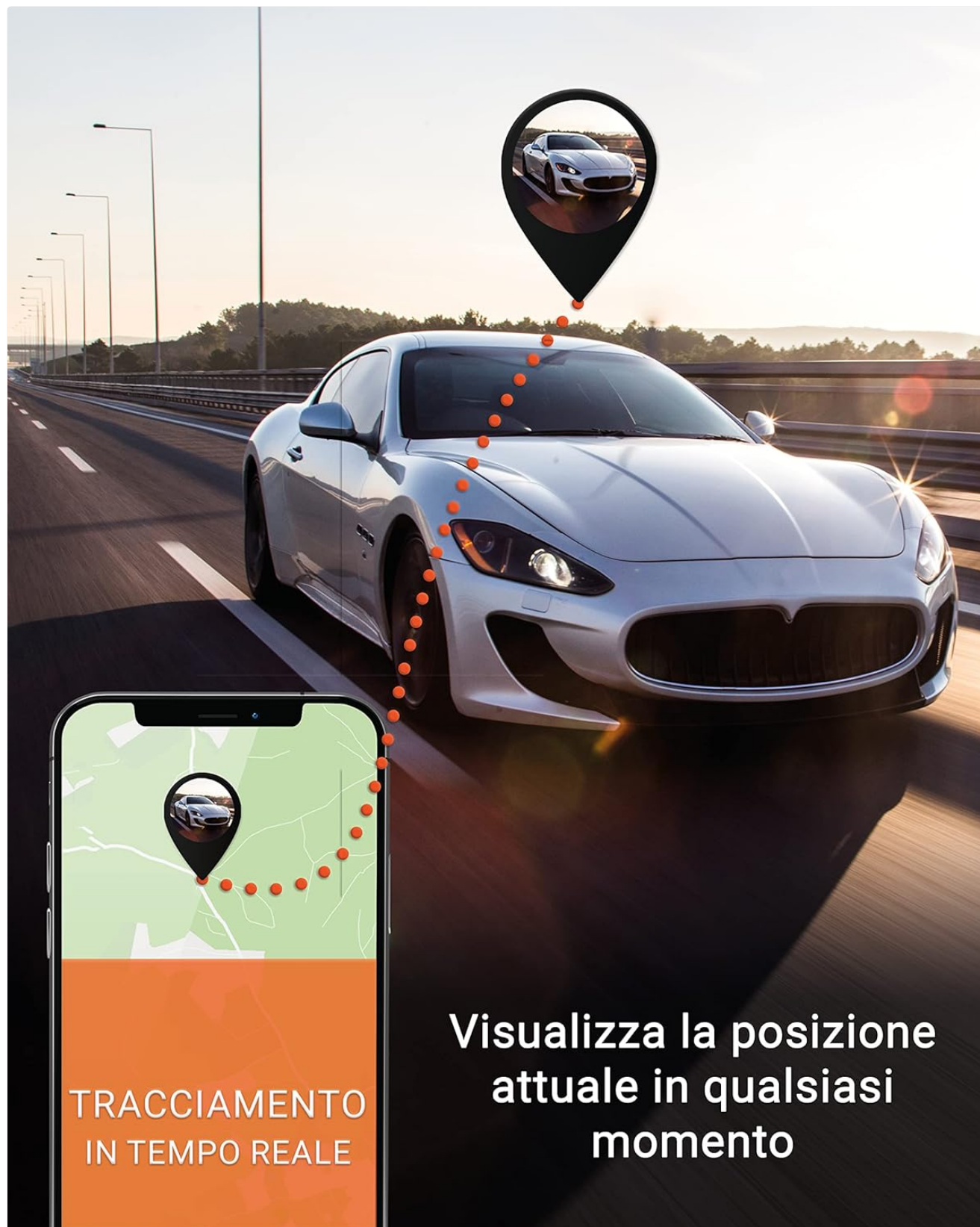
Image: A smartphone screen displaying the PAJ GPS Finder app, showing a car being tracked in real-time on a road, with its current position clearly marked.

To view your vehicle's current location, open the FINDER Portal app on your smartphone or access the web portal on a computer or tablet. The device's location will be displayed on a map in real-time.