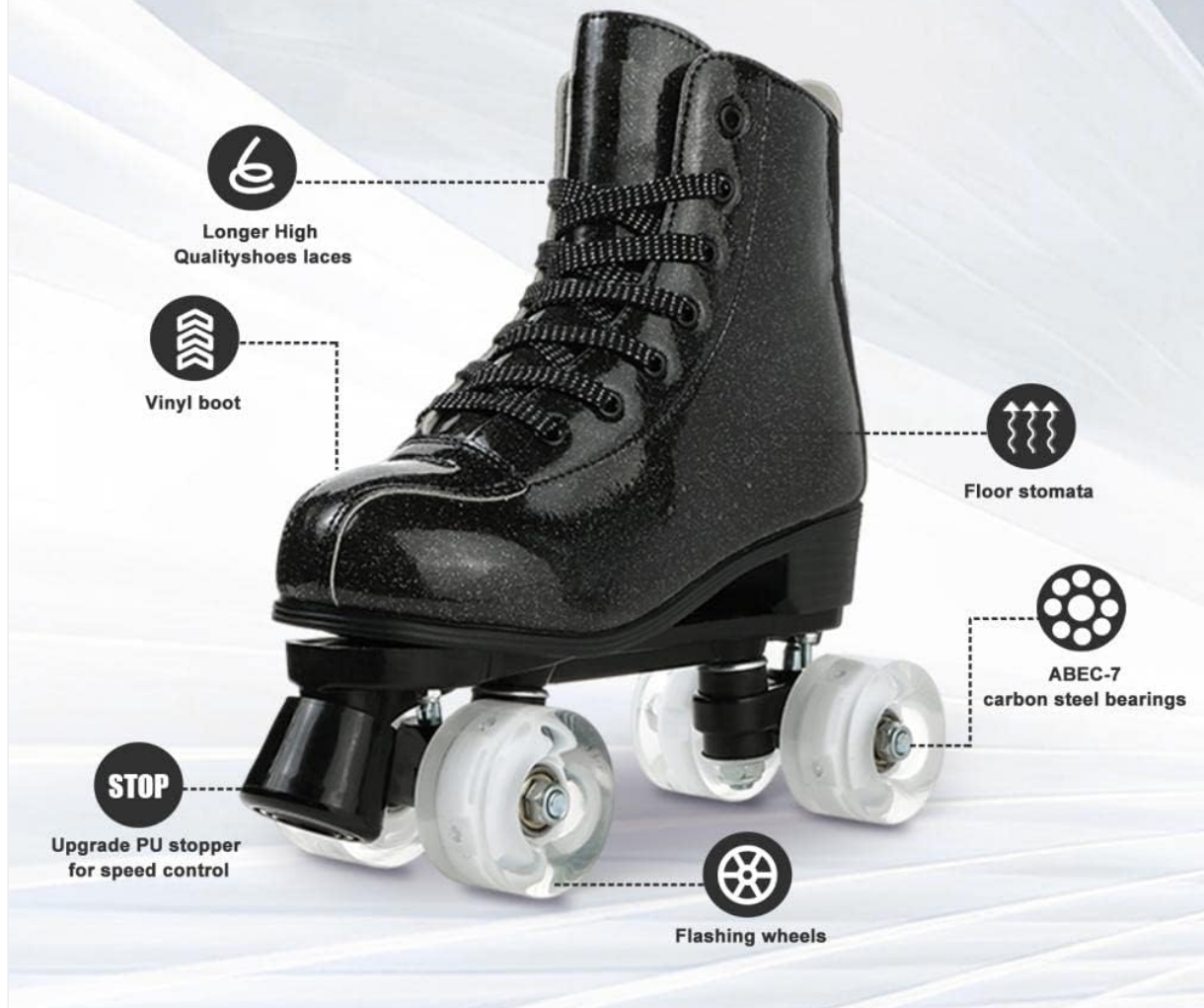
Figure 3.2: Detailed view of skate components including the vinyl boot, lacing, floor stomata for breathability, ABEC-7 carbon steel bearings, upgrade PU stopper for speed control, and flashing wheels.