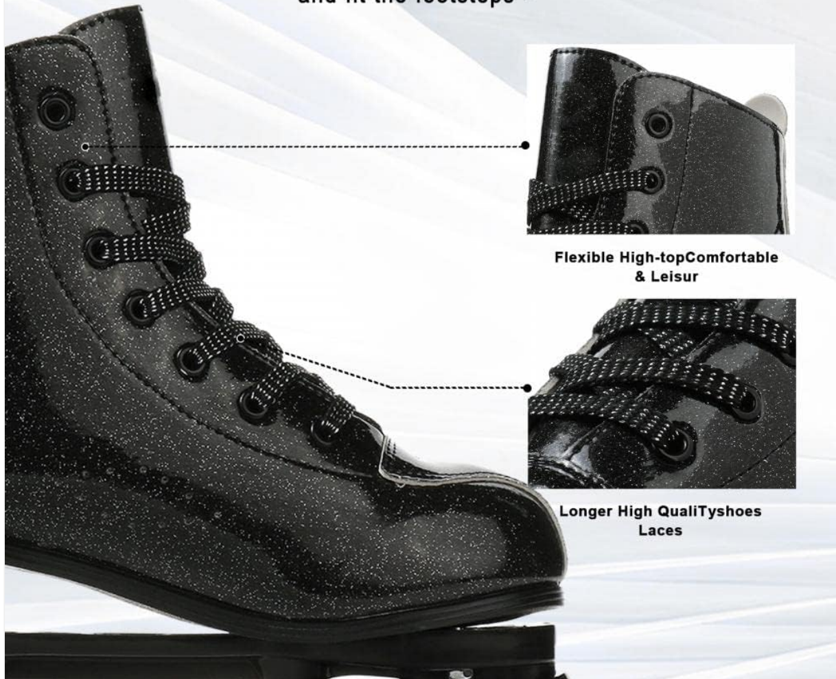
Figure 4.1: Detail of the lacing system, showing the flexible high-top for comfort and the durable shoelaces designed for a firm tie.

< The shoelaces are very easy and firm to tie up, and fit the footsteps >