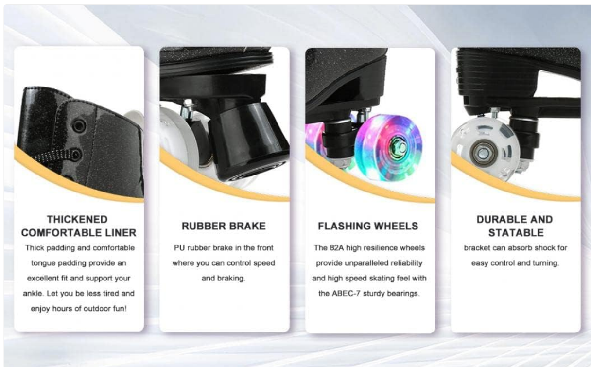
Figure 3.3: Breakdown of key features: Thickened Comfortable Liner for ankle support, Rubber Brake for speed control, Flashing Wheels with ABEC-7 bearings, and a Durable and Stable bracket for shock absorption.