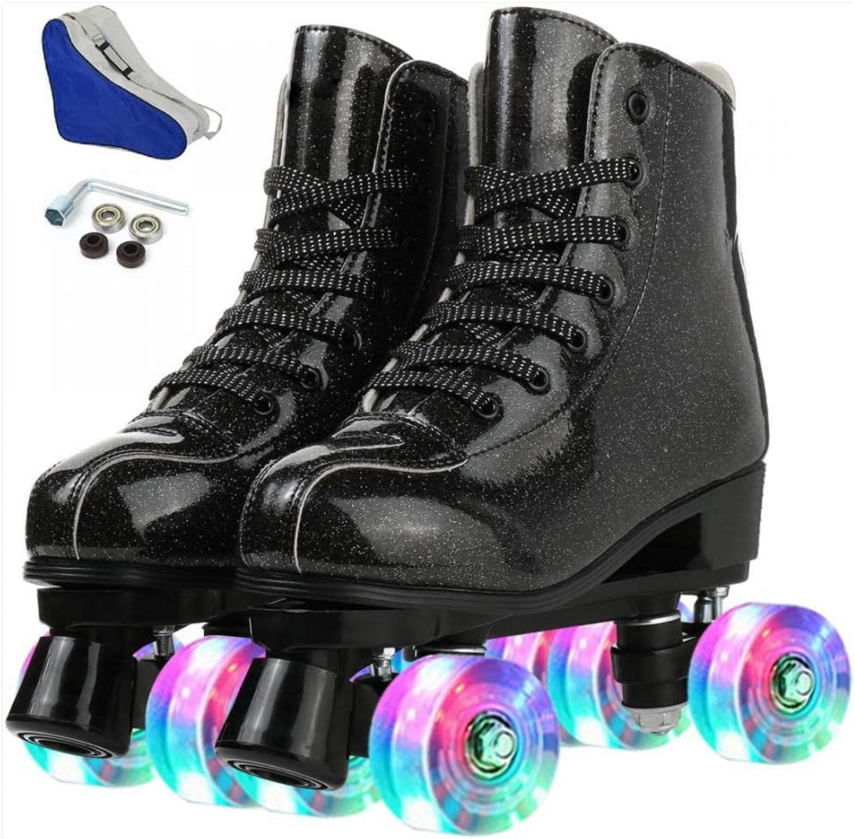
Figure 3.1: XUDREZ Holographic High Top Roller Skates in Black Crystal Flash. This image displays the overall design of the skates, highlighting the high-top boot, lacing system, and quad wheel configuration with flashing wheels.