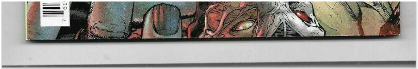
Figure 2: Back Cover. This image shows the back cover of the comic, featuring Robin in a dynamic pose, with other characters and elements from the Batman universe in the background, including a barcode with the number 0761941343730 .