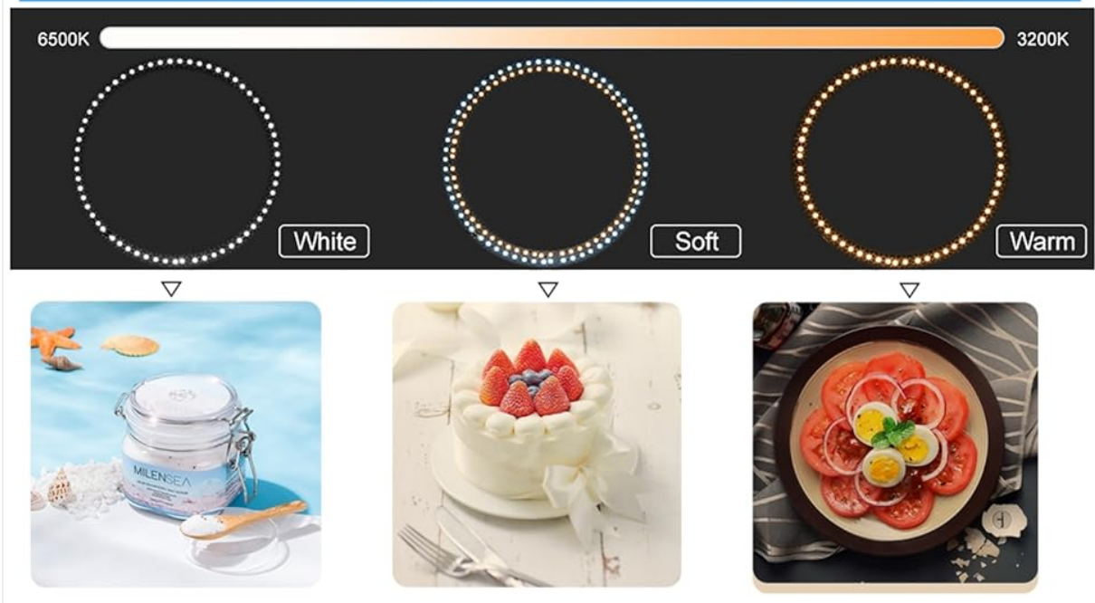
Image: Illustration of the three distinct light modes (White, Soft, Warm) and their effects on product photography.