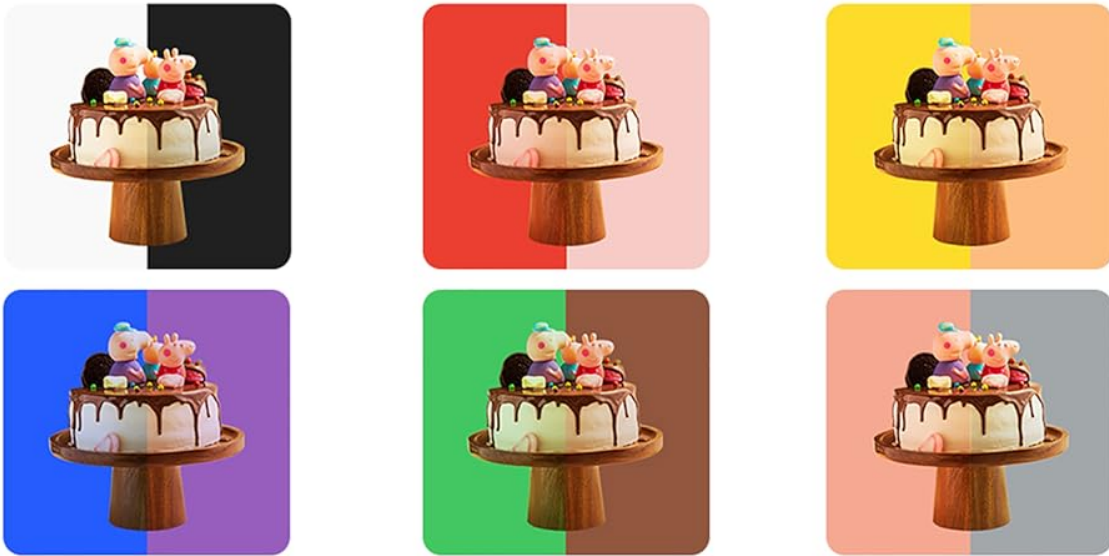
Image: A display of six product photos, each featuring a different background color from the included 12 options.

6 Background papers with 12 colors, Give You More Options to Shooting