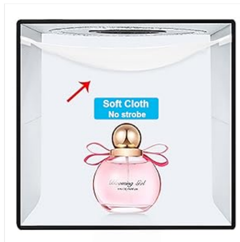
Image: The photo box interior with the soft cloth diffuser in place, illustrating its role in creating soft, even lighting without strobing.