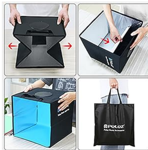
Image: Visual guide demonstrating the simple four-step installation process of the portable photo box.

Your browser does not support the video tag.