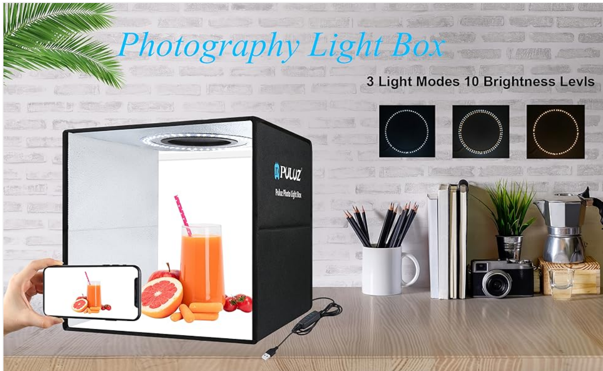
Image: The Hongbang 16x16 inch Photo Box in use, demonstrating its compact design and suitability for product photography with a smartphone.

This manual provides detailed instructions for the setup, operation, and maintenance of your Hongbang 16x16 inch Photo Box. This portable studio kit is designed to enhance your product photography with adjustable lighting and versatile backdrops, offering a professional solution for capturing high-quality images.