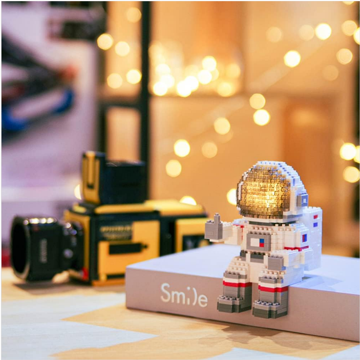
Image 3.2: The assembled astronaut model, showcasing its compact size and detail.

Your browser does not support the video tag.