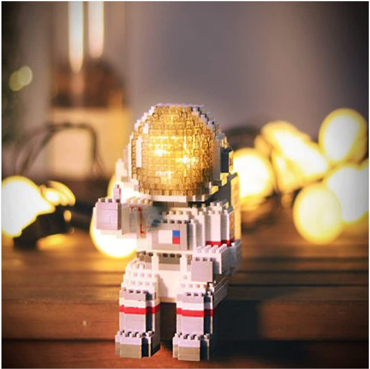
Image 4.1: The astronaut model with its helmet illuminated by the integrated LED light string.