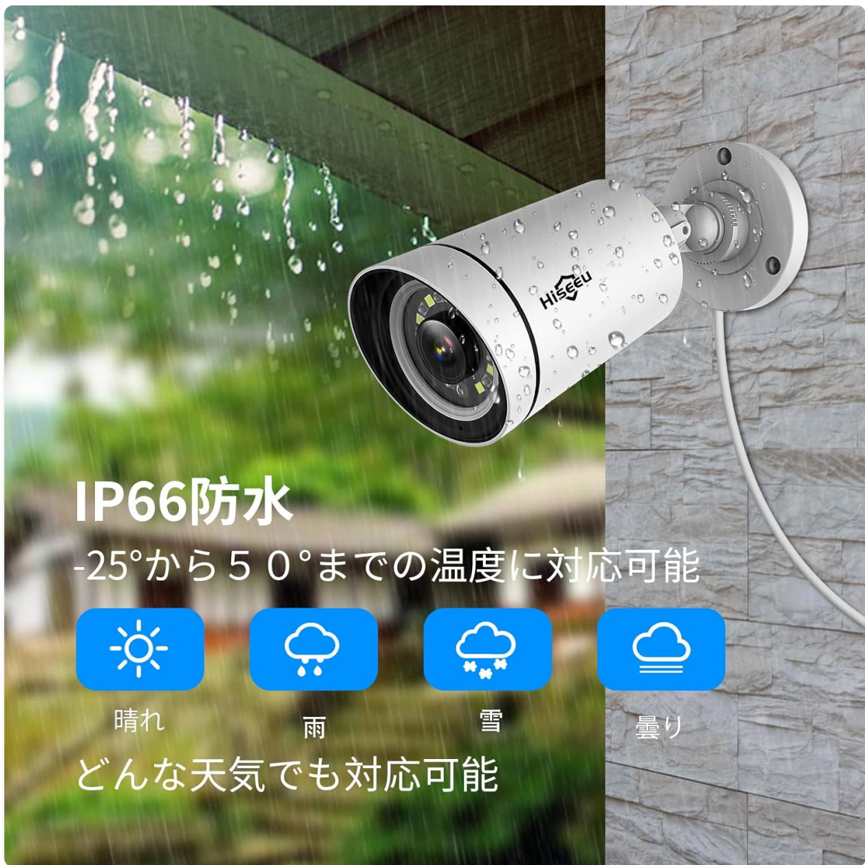
Figure 3.2: The camera's IP66 waterproof and dustproof design ensures reliable operation in temperatures from -25°C to 50°C, suitable for all weather conditions.