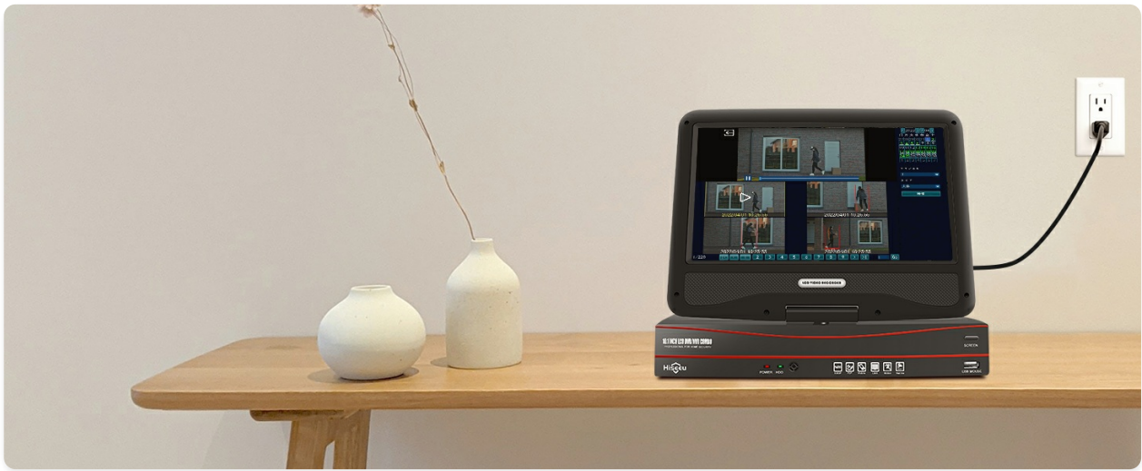
Figure 4.2: The NVR can be connected to an external monitor via HDMI for a larger display, showing multiple camera feeds simultaneously.