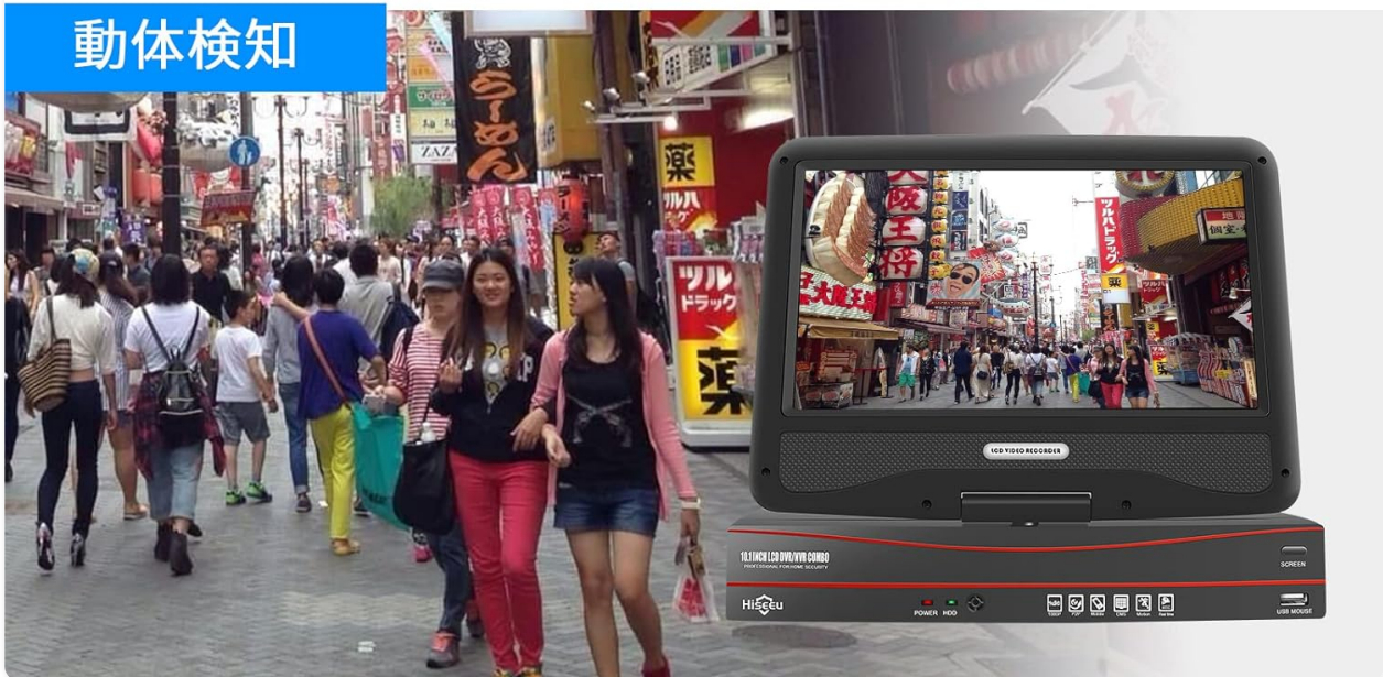
Figure 5.2: The system detects human motion, triggers strong LED lights for deterrence, and sends app notifications. The NVR can also sound a buzzer.

Your browser does not support the video tag.