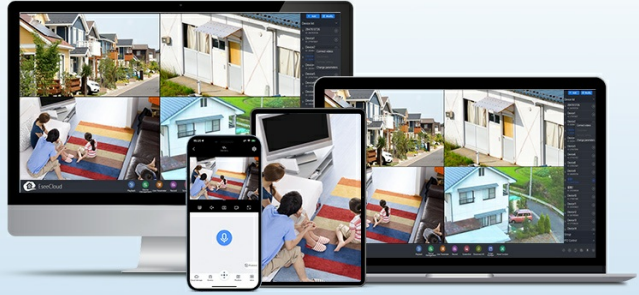
Figure 5.4: The 3TB HDD, combined with H.265+ compression, allows for extended recording periods, storing up to 90 days of footage from 4 cameras.