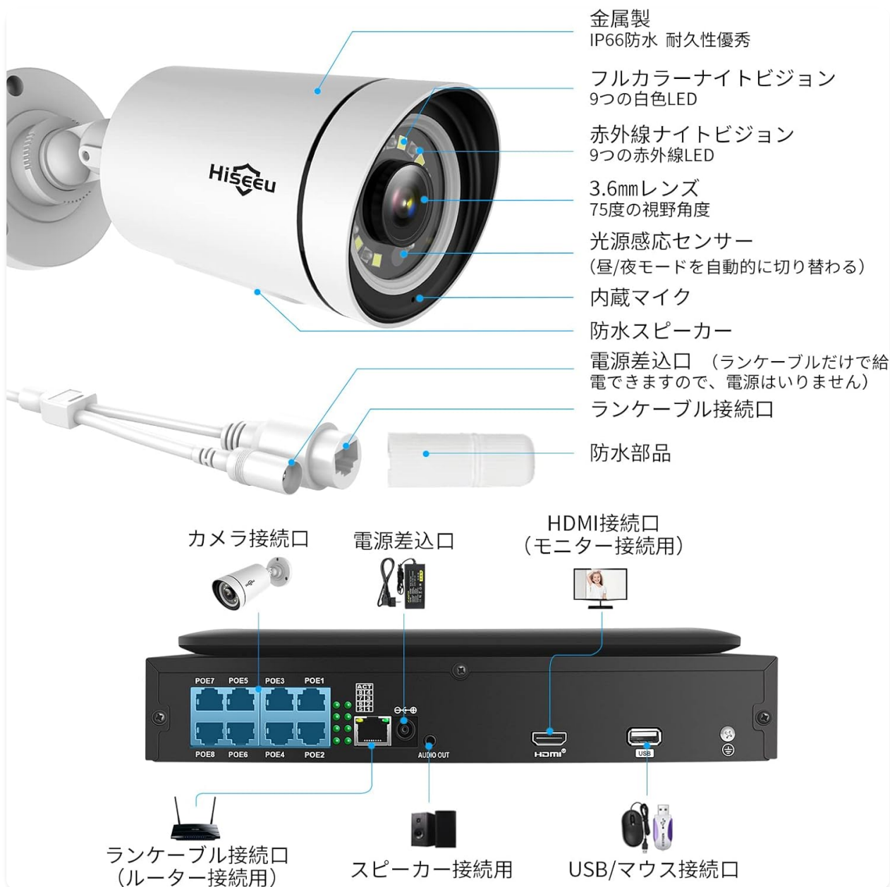
Figure 2.1: All components included in the Hiseeu 5MP POE Security Camera System package.