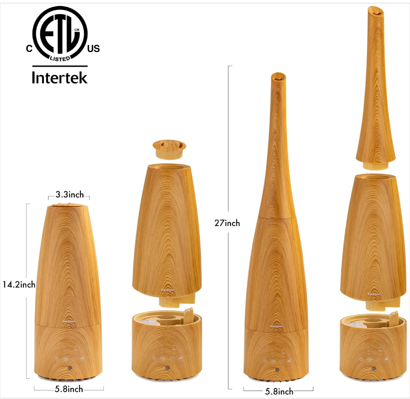
Figure 2: Humidifier Dimensions and Nozzle Options