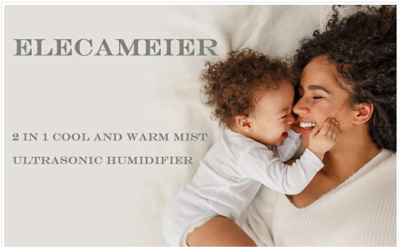
Figure 1: Warm and Cool Mist Functionality