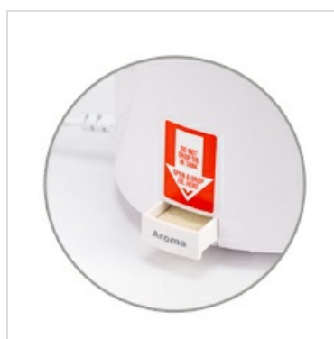
Figure 8: Essential Oil Tray