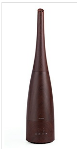
Figure 6: Filling the Water Tank

6. Choose your preferred mist nozzle (short or tall) and place it on top of the water tank.