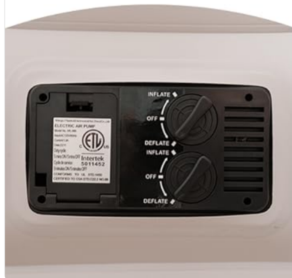
Figure 4: Detail of the built-in pump with dual controls.