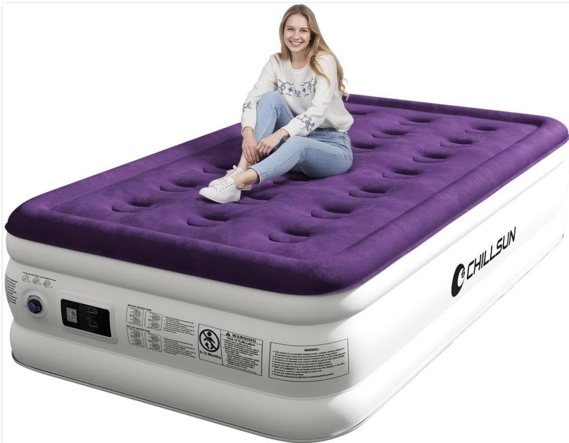
Figure 1: Fully inflated CHILLSUN Twin Air Mattress.