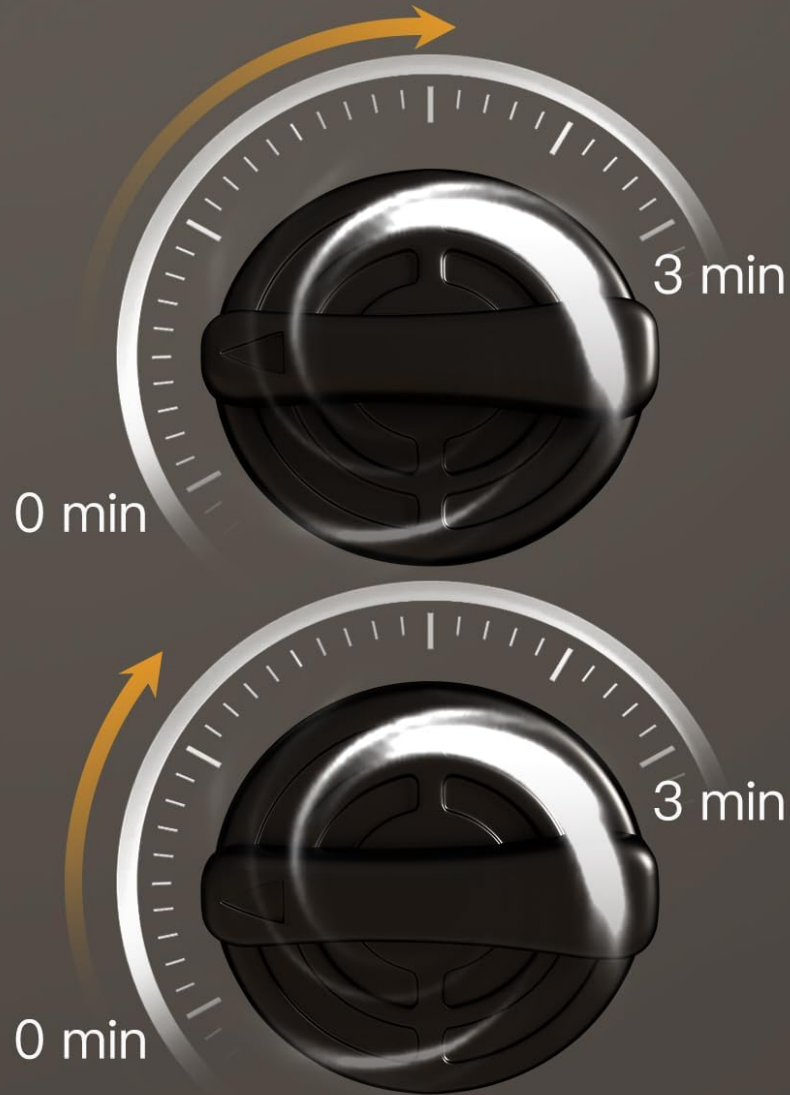
Figure 3: Built-in pump and inflation/deflation dials.