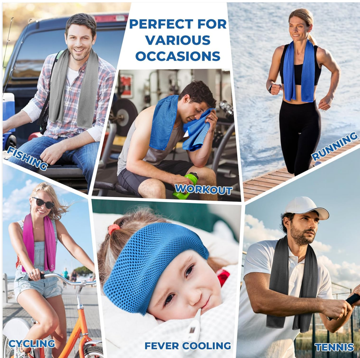
Figure 3: Sukeen Cooling Towels are suitable for a wide range of activities and occasions.

Observe the cooling performance of the towel with a thermal camera in the following video: