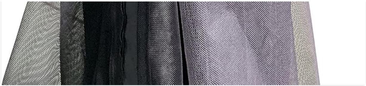
Image 6.1: A close-up view illustrating how the mosquito netting can be neatly tied back to a gazebo post when not in use, allowing for an open space.