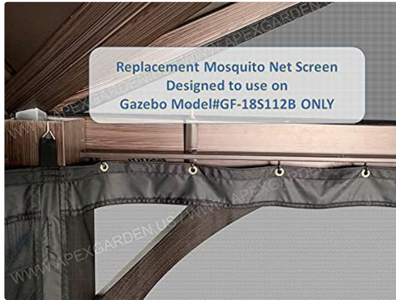
Image 5.1: A close-up view demonstrating how the mosquito netting attaches to the gazebo's steel slide rail using the integrated hooks. This image confirms the netting is designed for Model GF-18S112B ONLY.