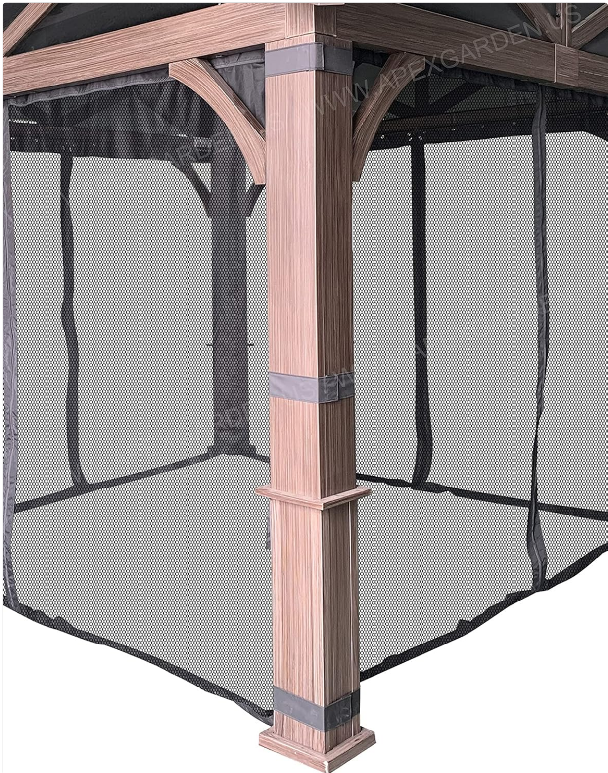
Image 5.2: An additional perspective of the mosquito netting fully installed, showcasing its fit and coverage around the gazebo structure.