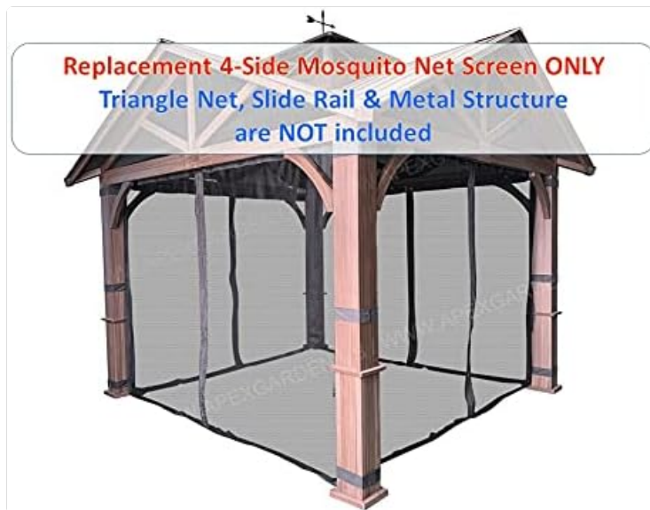
Image 2.1: The mosquito netting installed on a gazebo. This image clarifies that only the screen net is included; the triangle net, slide rail, and metal structure are not part of this product.