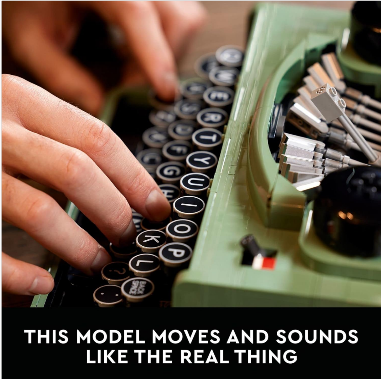
Image: Hands demonstrating the key press action on the detailed keyboard.