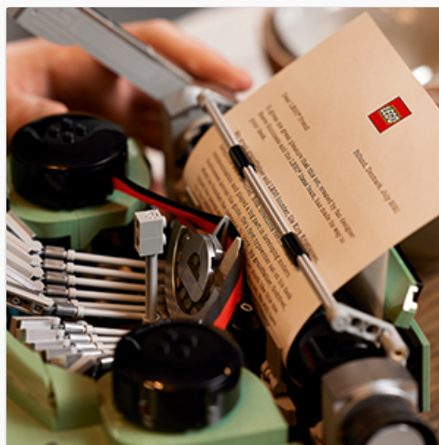
Image: A piece of paper being fed into the platen roller, demonstrating the paper feed mechanism.