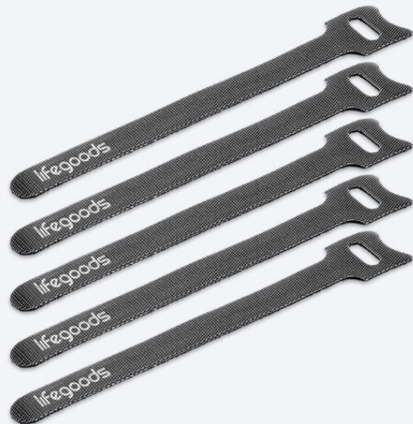
Image: A visual guide demonstrating the quick assembly of the monitor stand, alongside an illustration of the included cable wraps designed to help organize and tidy wires.