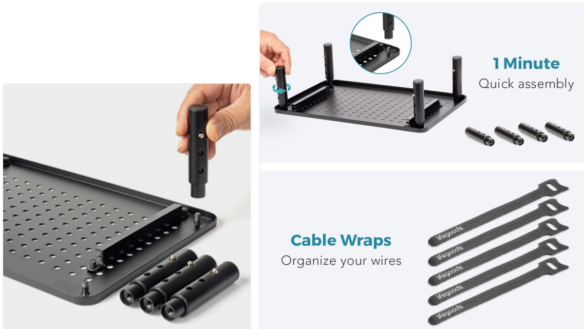
Image: Left: A hand demonstrating how to insert an adjustable leg into the monitor stand. Right: An illustration detailing the quick assembly process and the included cable ties for wire organization.