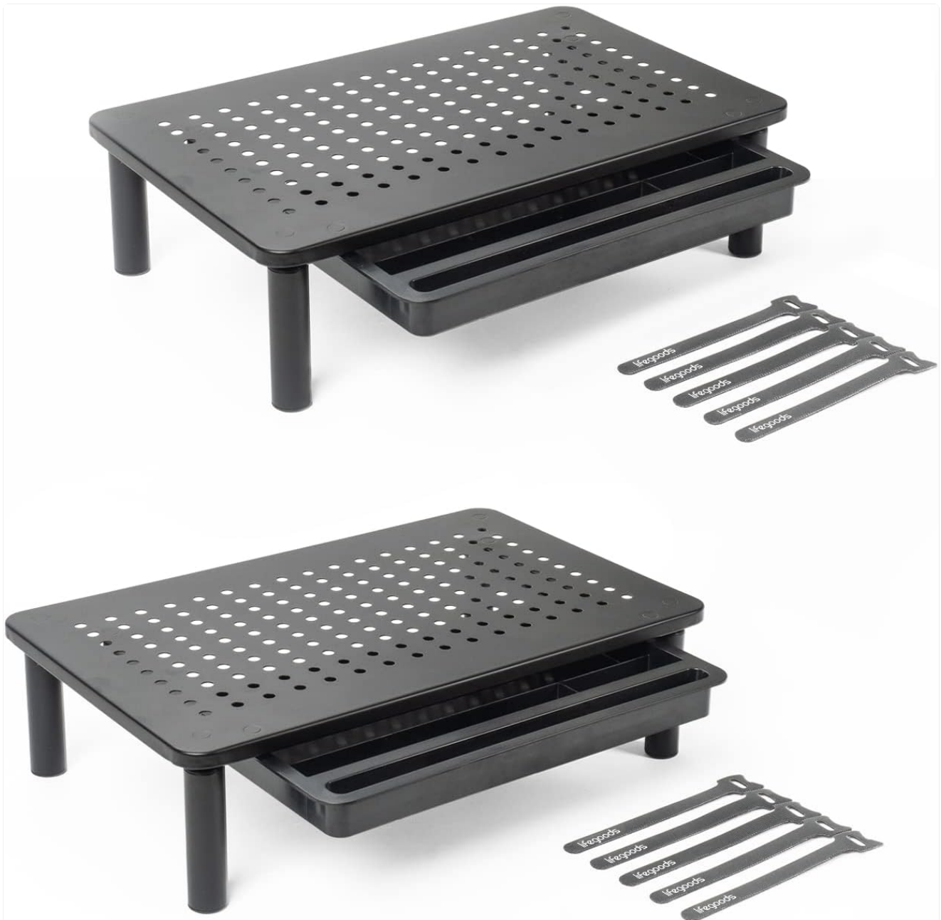
Image: Two LifeGoods Monitor Stands, each with an integrated storage drawer and accompanied by cable ties. The stands are black with perforated tops.