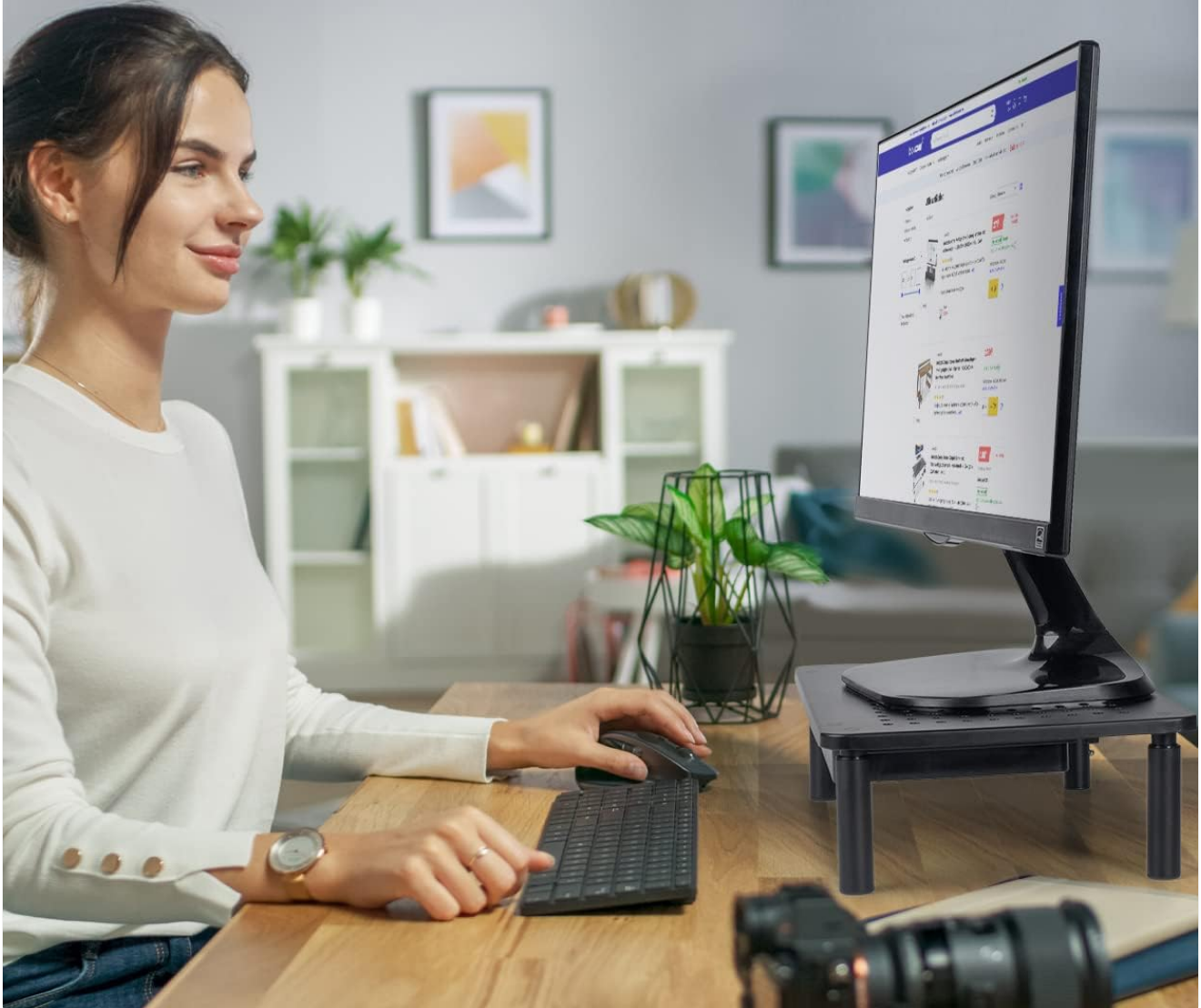
Image: A woman seated at a desk, working on a computer with her monitor elevated by the LifeGoods stand, illustrating the ergonomic benefits of proper screen height.