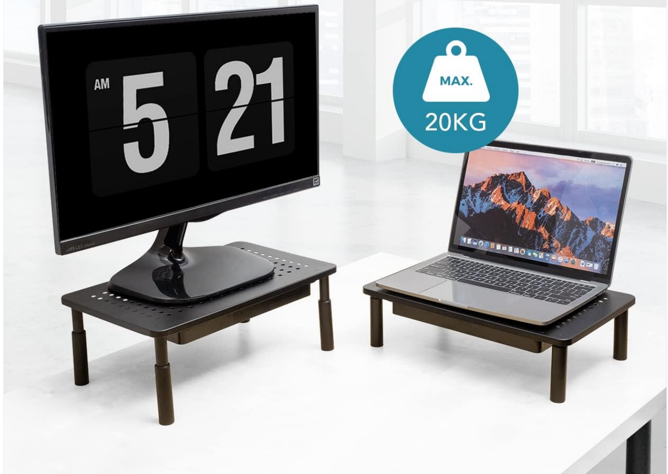
Image: A monitor and a laptop positioned on separate LifeGoods monitor stands, illustrating the product's wide compatibility and maximum weight capacity of 20 kg.