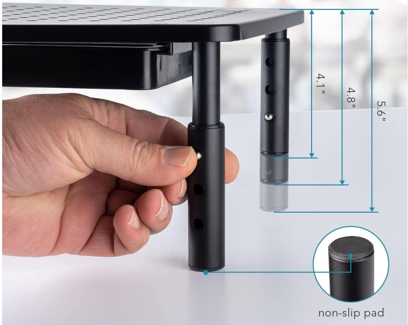
Image: A detailed view of a hand adjusting the height of one of the monitor stand's legs, with labels indicating the three adjustable height settings (4.1", 4.8", 5.6") and the non-slip pad at the base.

Easy to adjust with the press of a button