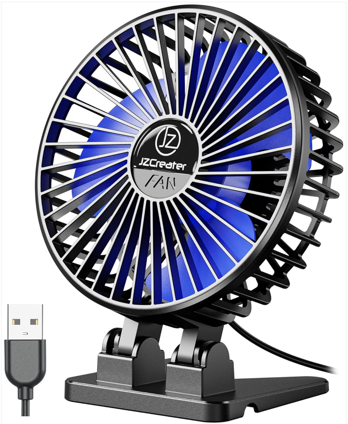
Figure 1: JZCreator USB Desk Fan (Black Blue model) with its USB cable.