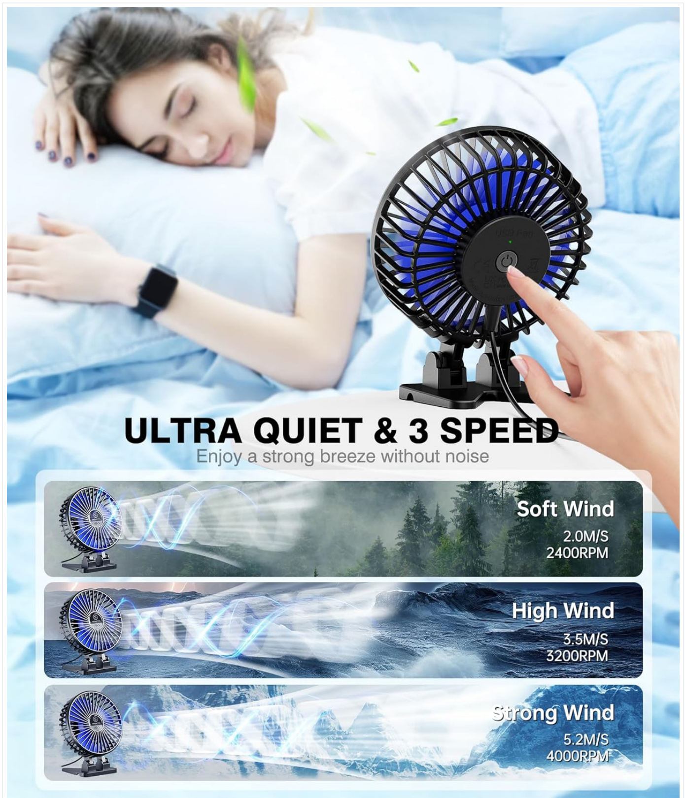
Figure 3: Illustration of the three-speed settings: Soft Wind (2.0M/S, 2400RPM), High Wind (3.5M/S, 3200RPM), and Strong Wind (5.2M/S, 4000RPM).