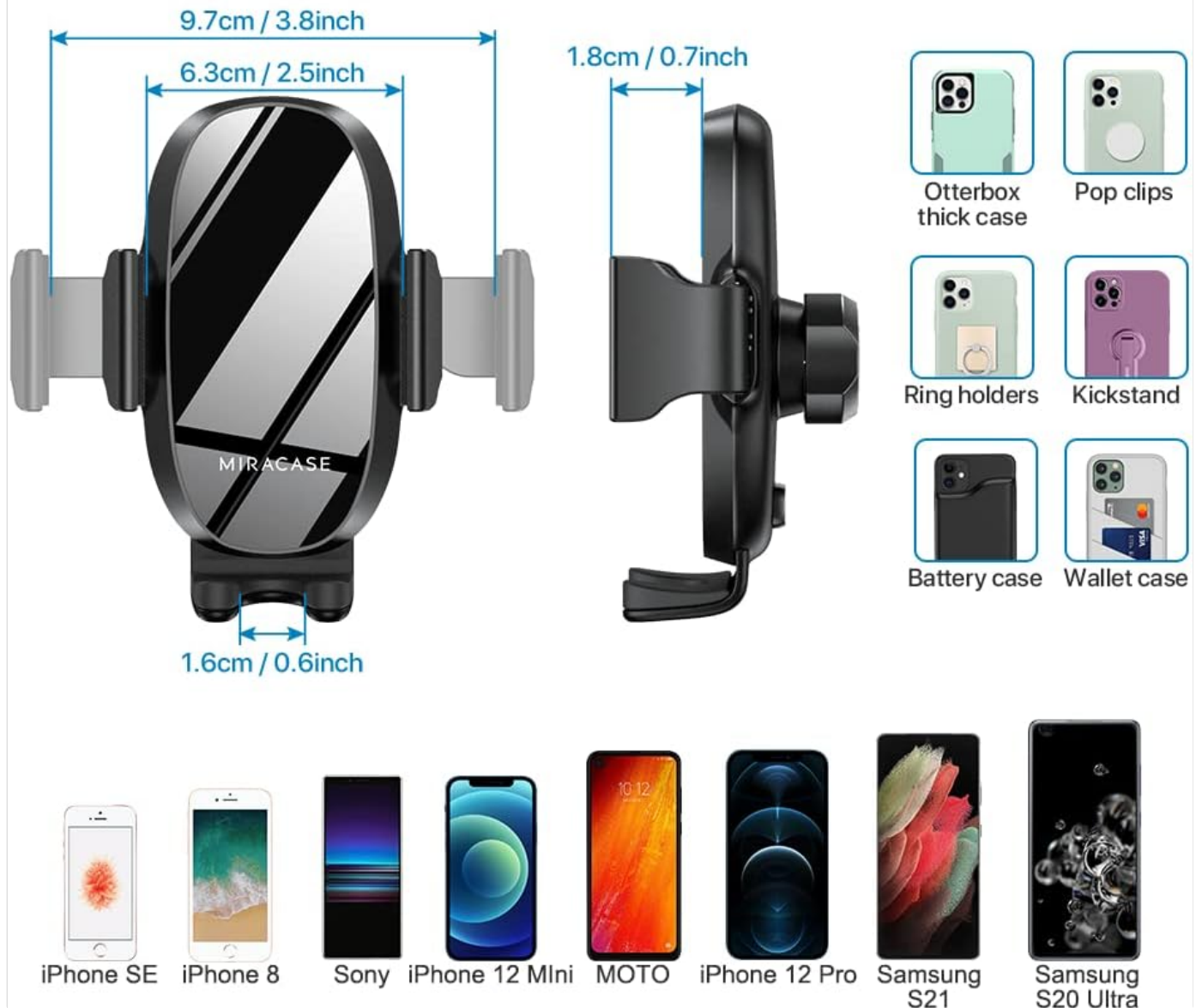
Figure 4: The holder is compatible with 4.0-7.0 inch smartphones and various thick cases.

Fit Thick Cases & Big Phones 4.0-7.0 inches