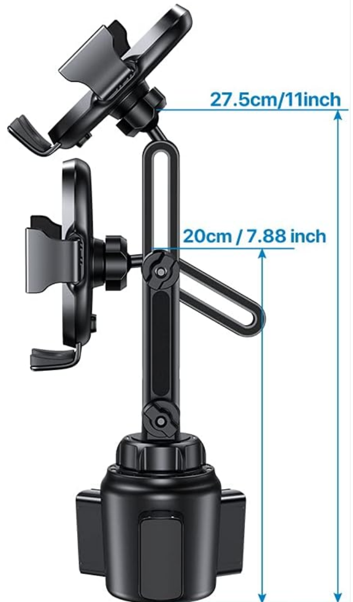
Figure 3: The long neck offers 180 and 270-degree adjustments for optimal viewing.