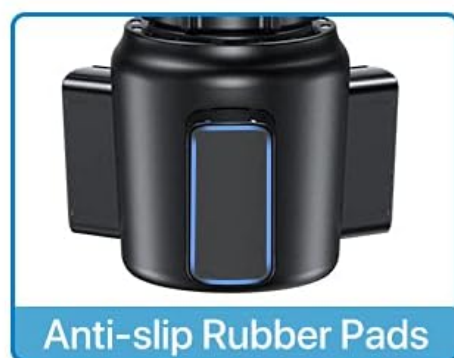
Figure 1: The adjustable base expands from 2.6 to 4.0 inches to fit various cup holders. Twist the knob to expand or shrink.