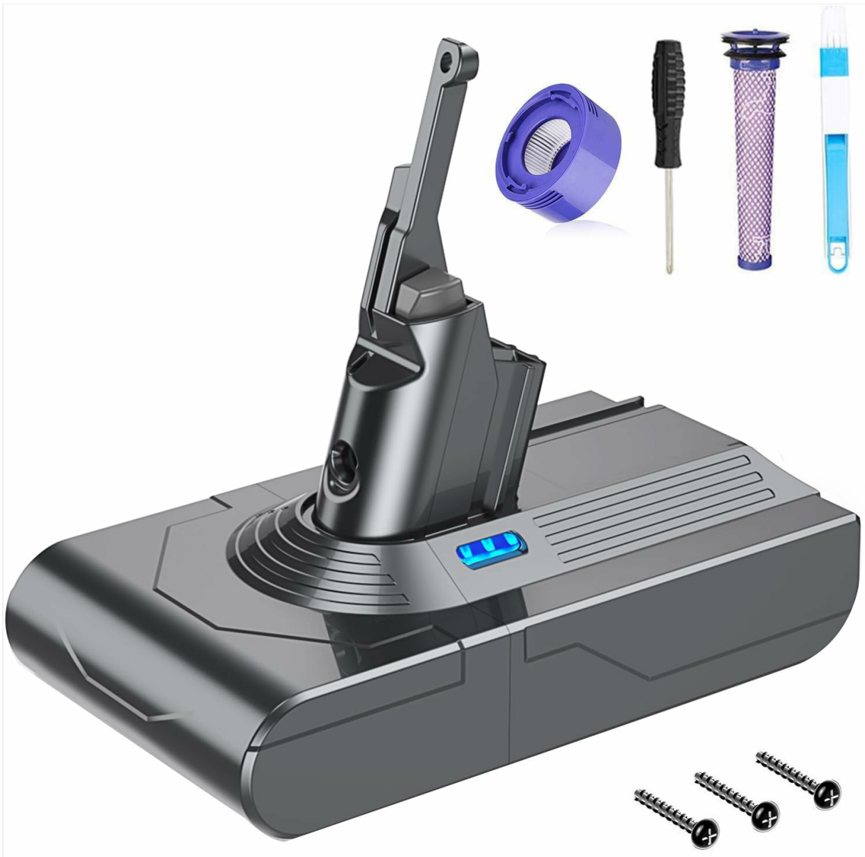
Image: The FLYLINKTECH V8 6000mAh 21.6V Li-ion Replacement Battery.