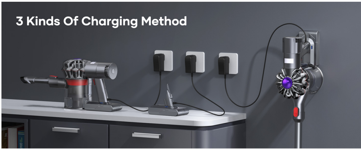
Image: Illustration of three different charging methods for the Dyson V8 battery: directly on the vacuum, on a charging dock, and wall-mounted.