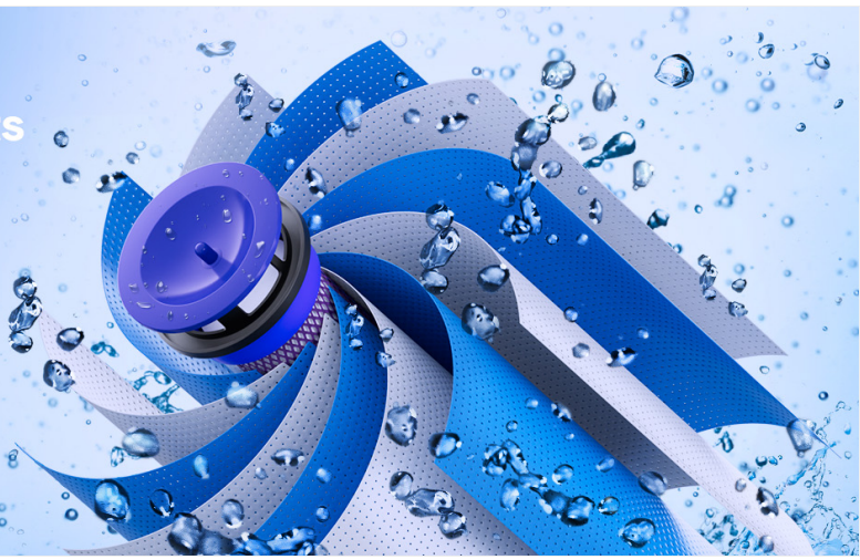
Image: Illustration showing the two types of Dyson V8 filters (pre-filter and post-filter) and their washable, reusable nature.