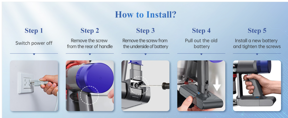
Image: Visual step-by-step instructions for replacing the Dyson V8 battery, showing screw removal and battery insertion.

Note: The new battery has only a small amount of remaining power. Please fully charge it before the first use.