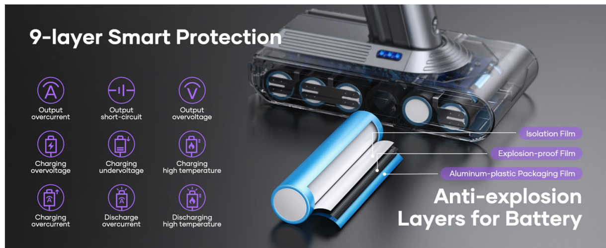
Image: Detailed illustration of the 9-layer smart protection system and anti-explosion layers within the battery cells.