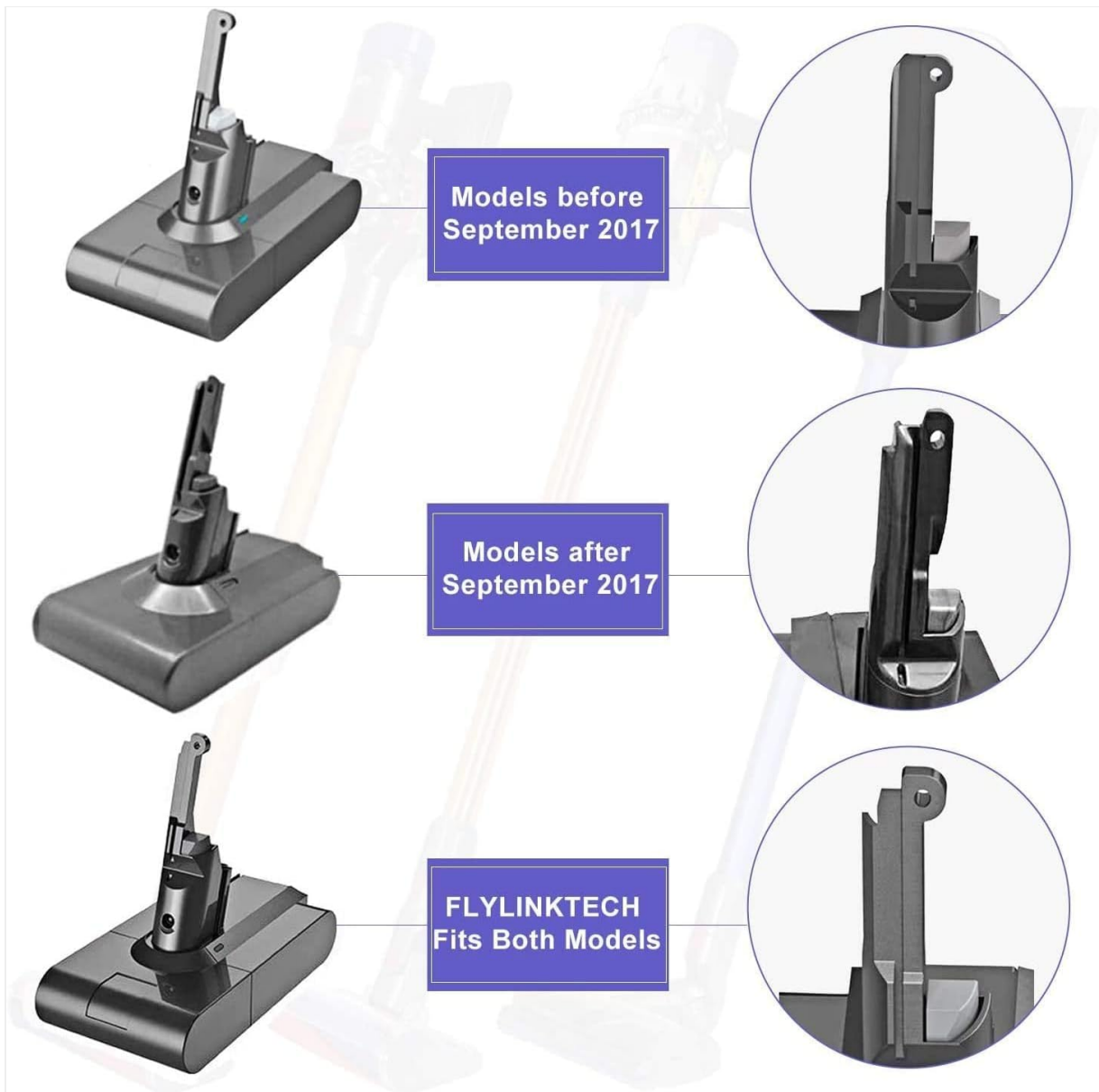
Image: Comparison showing the battery's fit for Dyson V8 models manufactured before and after September 2017.