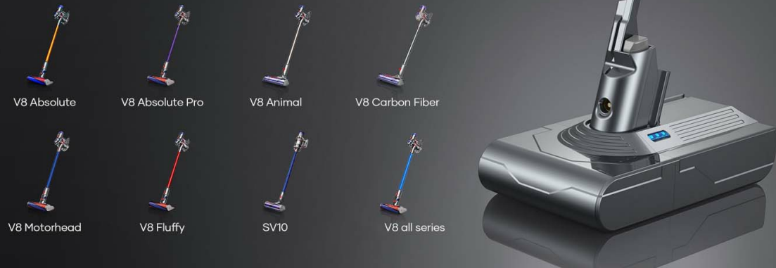
Image: Visual representation of various Dyson V8 series vacuum models compatible with the replacement battery.