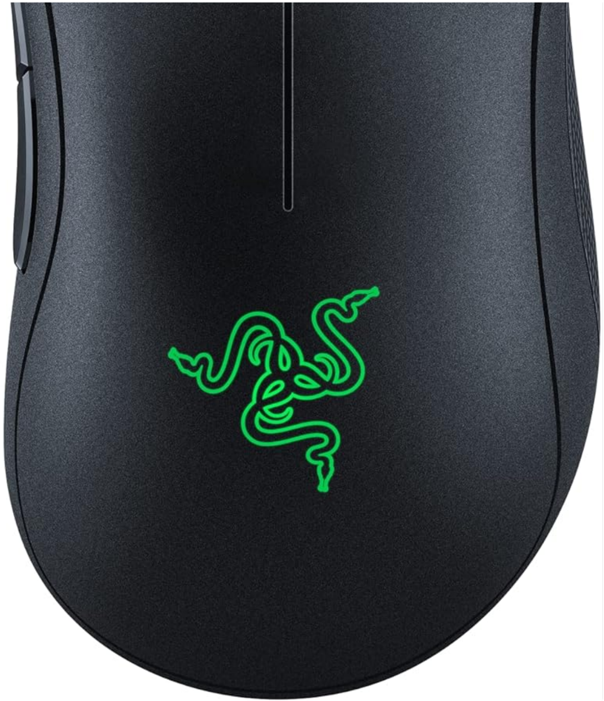
Figure 1: Razer DeathAdder Essential Gaming Mouse (Classic Black)