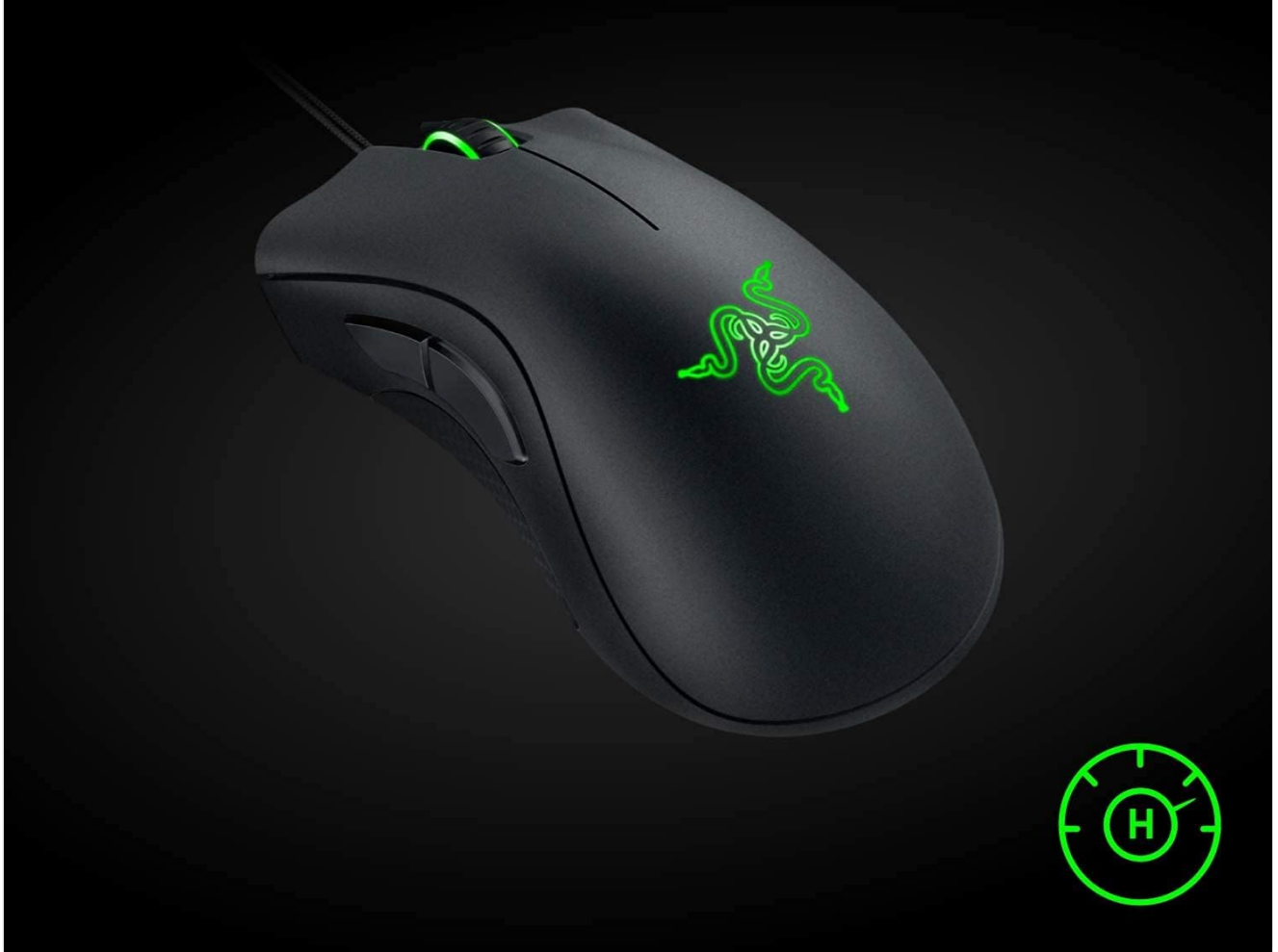
Figure 4: 5 Programmable Buttons

Independently programmable Hyperresponse buttons give advanced controls for a competitive edge, with support for complex macros