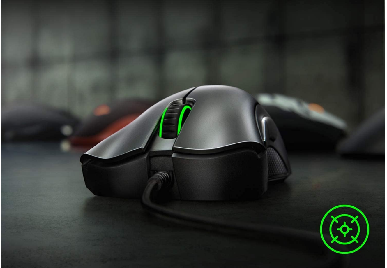
Figure 2: 6,400 DPI Optical Sensor for Gaming Precision

Allows fast and precise mouse swipes that offer greater control for the most essential gaming needs