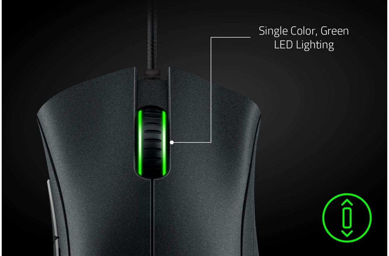
Figure 5: Rubberized, Textured Scroll Wheel

Small, tactile bumps increases grip and allows for more controlled scrolling in high-stakes gaming situations