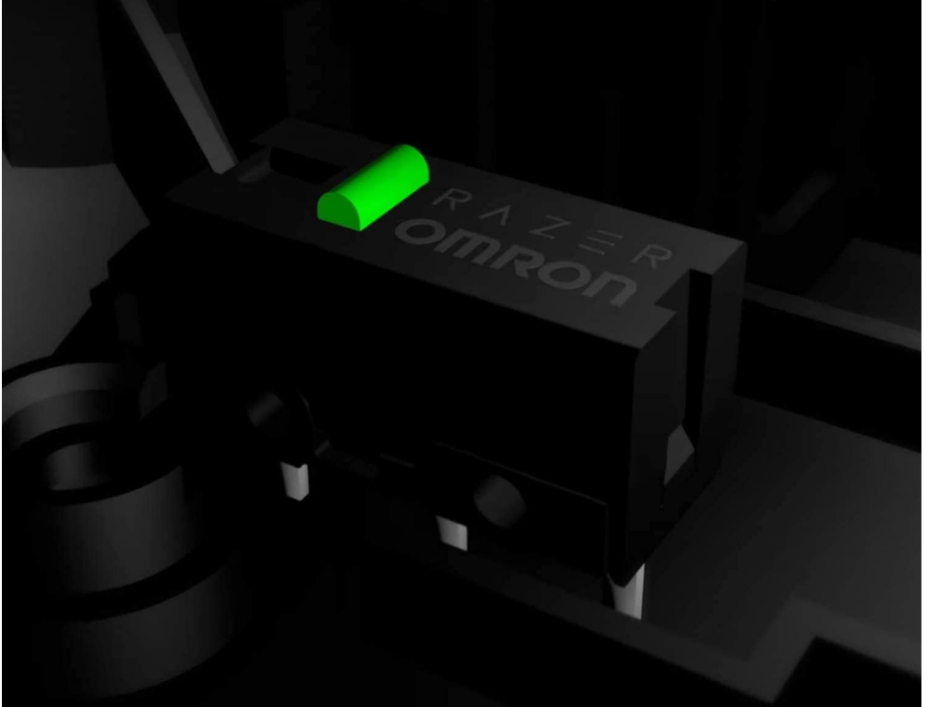
Figure 3: Durable Mechanical Switches

The multi-award winning Razer™ Mechanical Switches last up to 10 million clicks for longer lifespan and extreme reliability