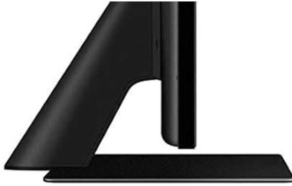
Figure 3: Slim side profile of the Samsung QN85QN85A TV.