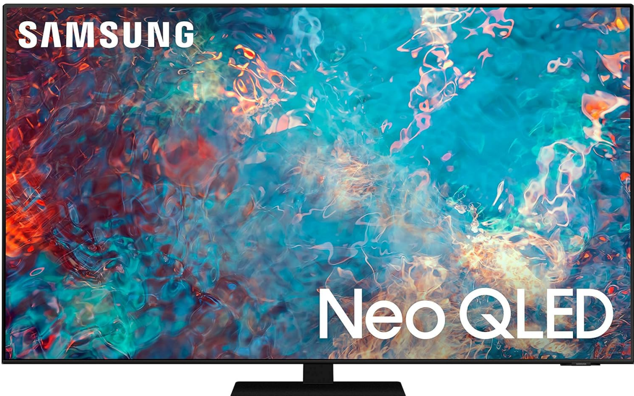
Figure 1: Front view of the Samsung QN85QN85A 85-inch Neo QLED 4K Smart TV.

This manual provides essential information for setting up, operating, and maintaining your Samsung QN85QN85A 85-inch Neo QLED 4K Smart TV. Please read these instructions carefully to ensure optimal performance and longevity of your television.