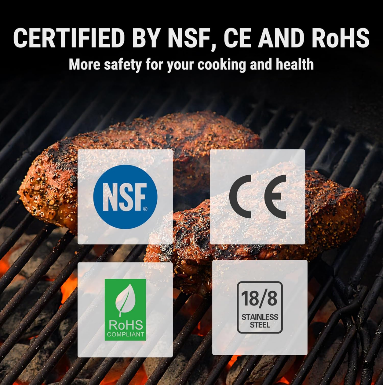
Figure 7: The ThermoPro TP510 is certified by NSF, CE, and RoHS, indicating compliance with safety and quality standards.