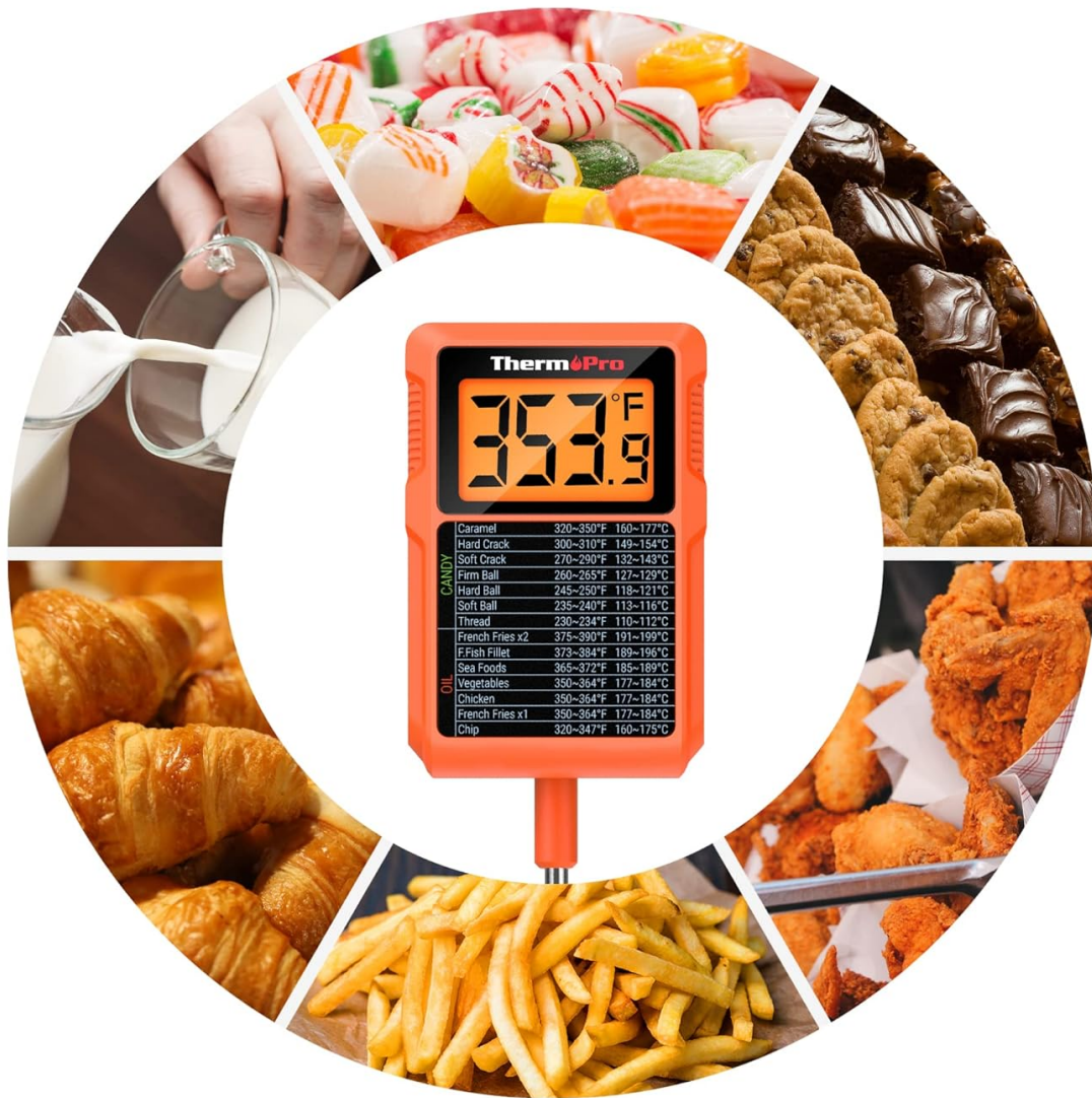
Figure 5: The ThermoPro TP510 is suitable for a wide range of cooking applications.