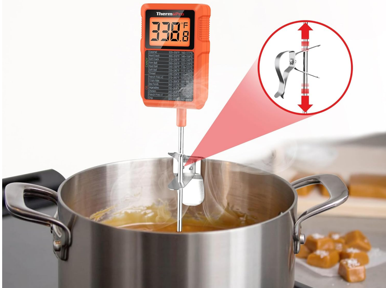
Figure 3: The 10-inch long probe with an adjustable pot clip for secure placement.