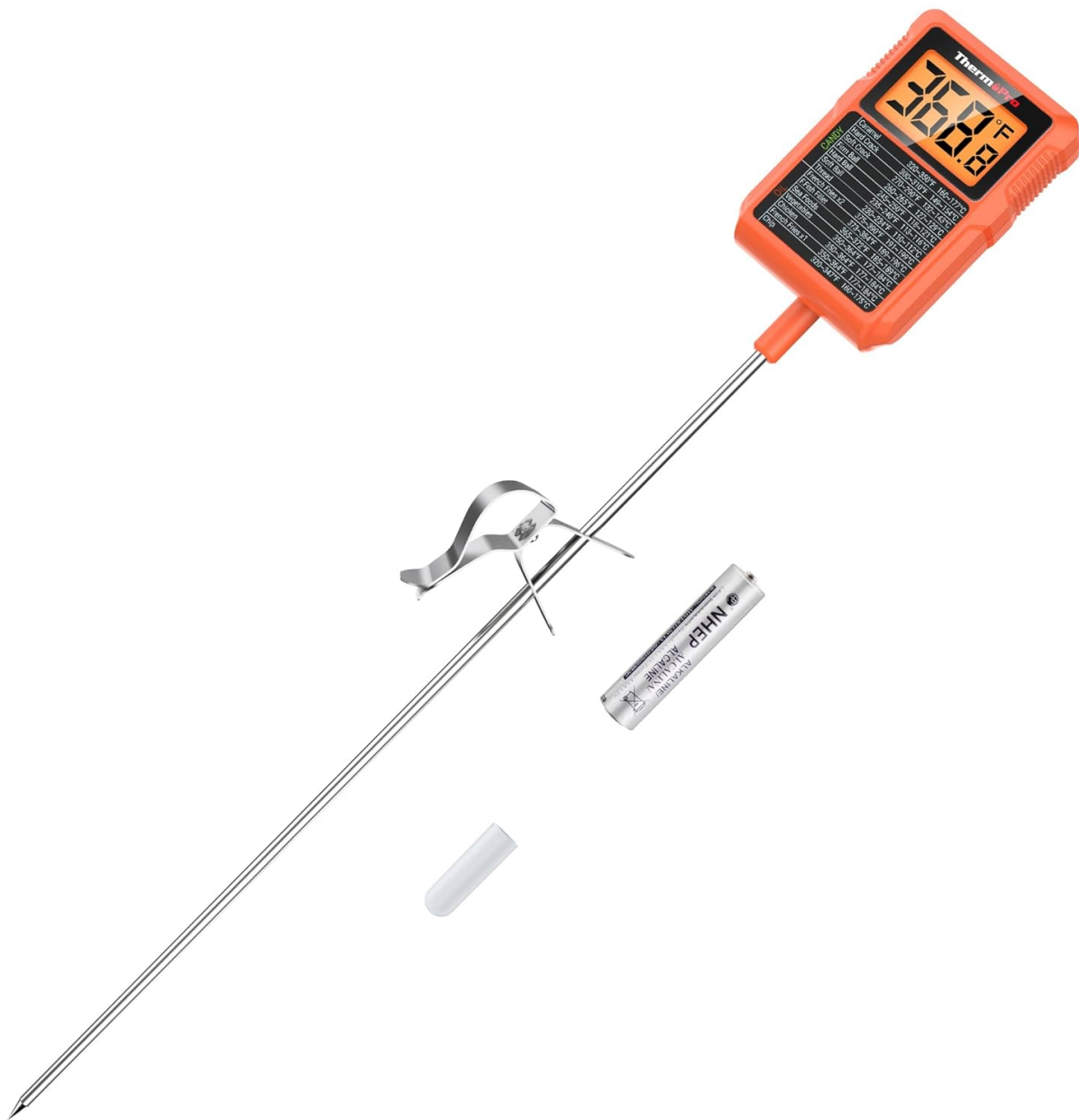
Figure 1: ThermoPro TP510 Digital Instant Read Thermometer with included accessories.