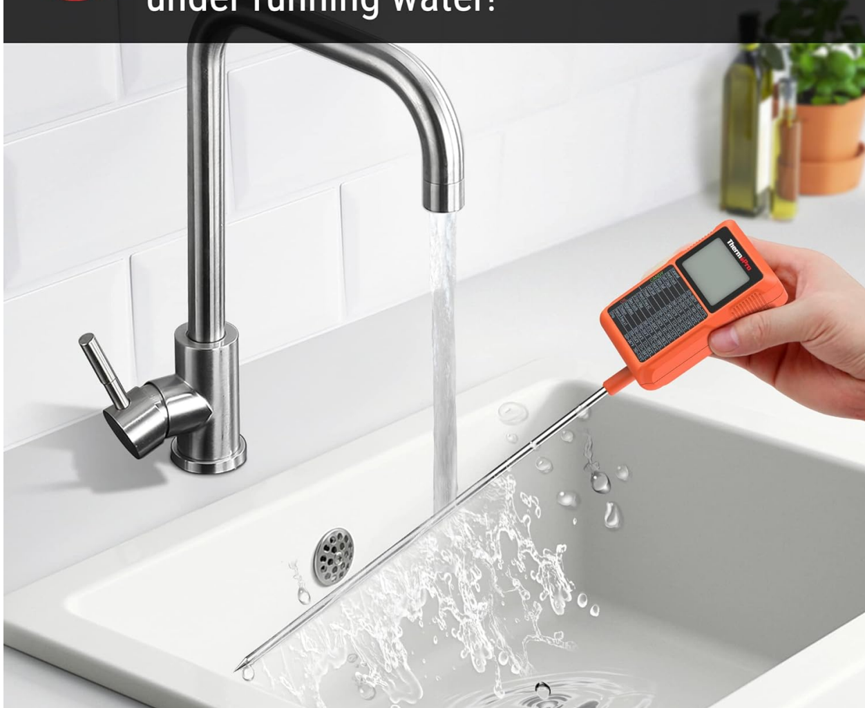
Figure 6: The IPX5 waterproof design allows for easy cleaning under running water.

Cleanup takes only seconds, simply wash under running water!