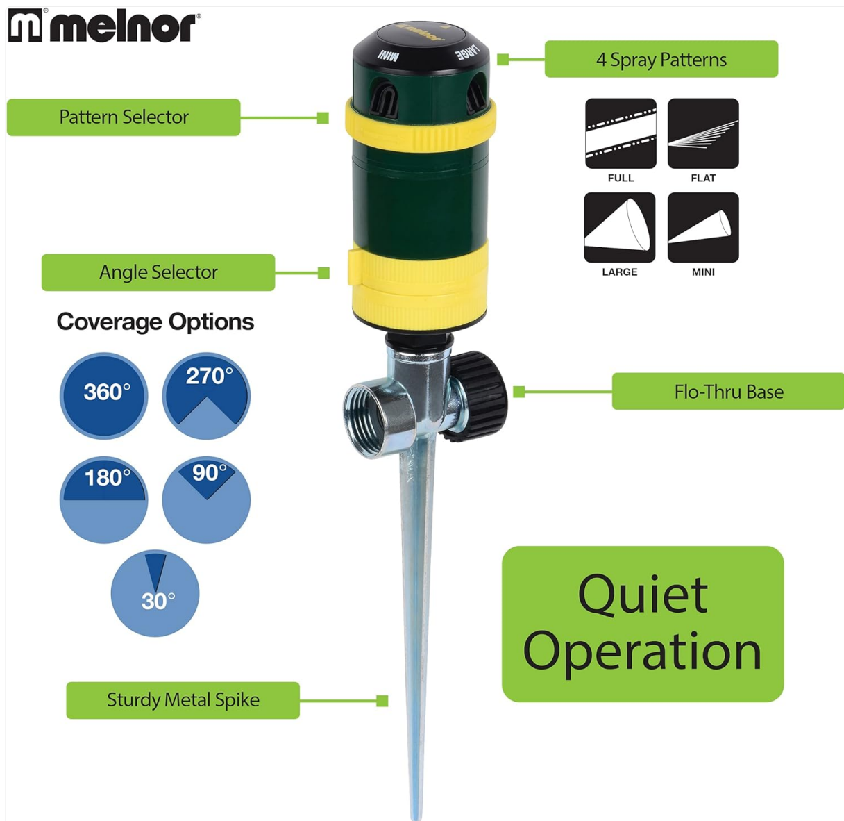
Diagram showing the various spray patterns and angle coverage options.