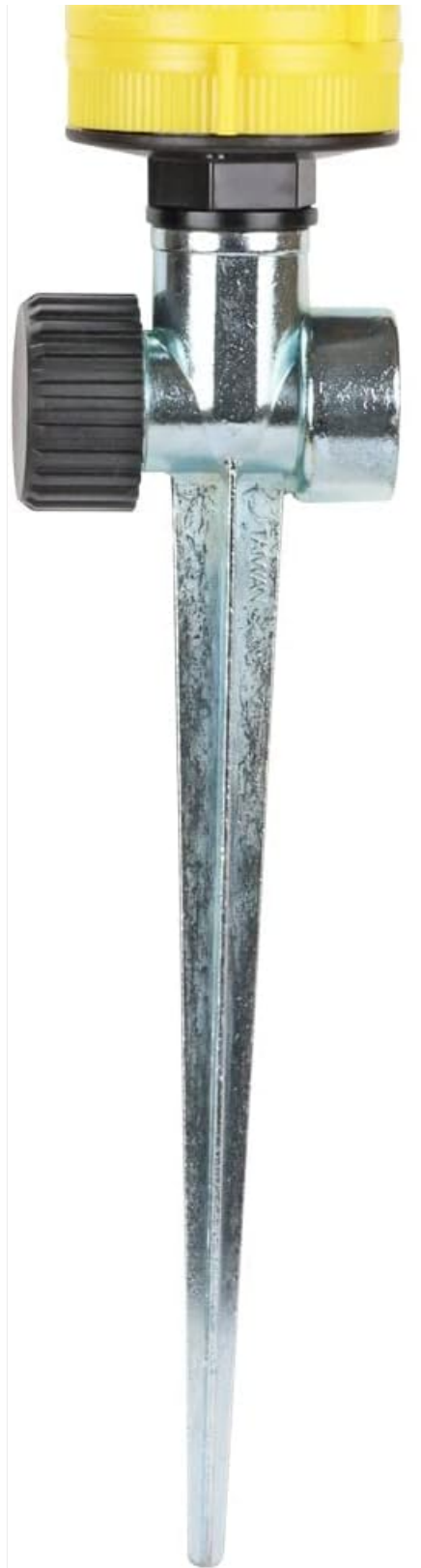
Front view of the Melnor 65404AMZ Turbo Rotary Sprinkler, showcasing its design and spike base.