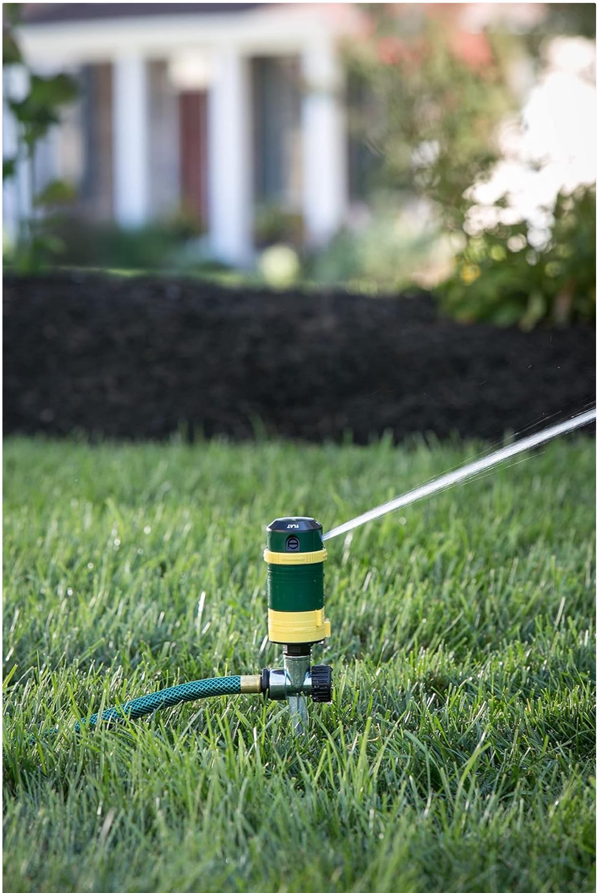
Sprinkler providing effective coverage for a garden area.