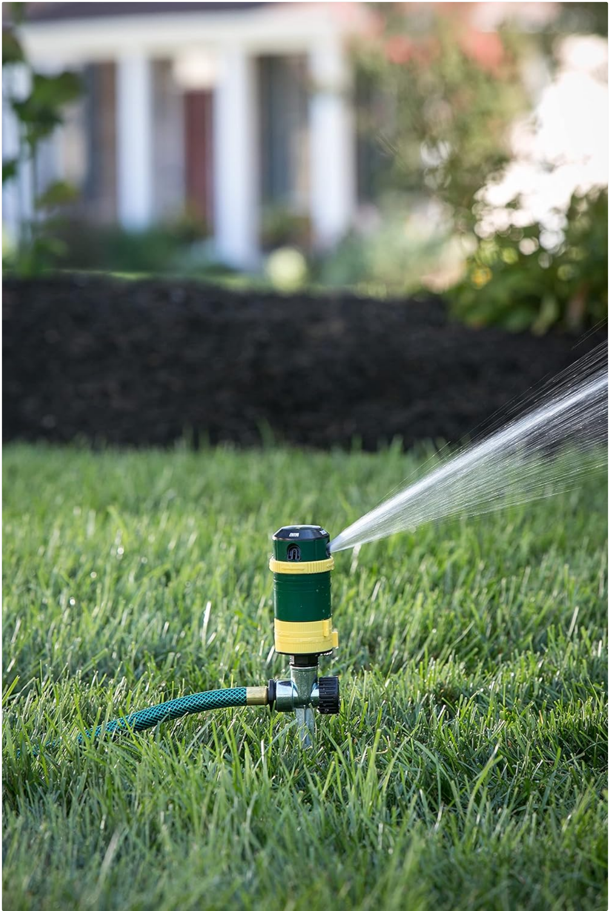
Sprinkler distributing water evenly across a lawn.