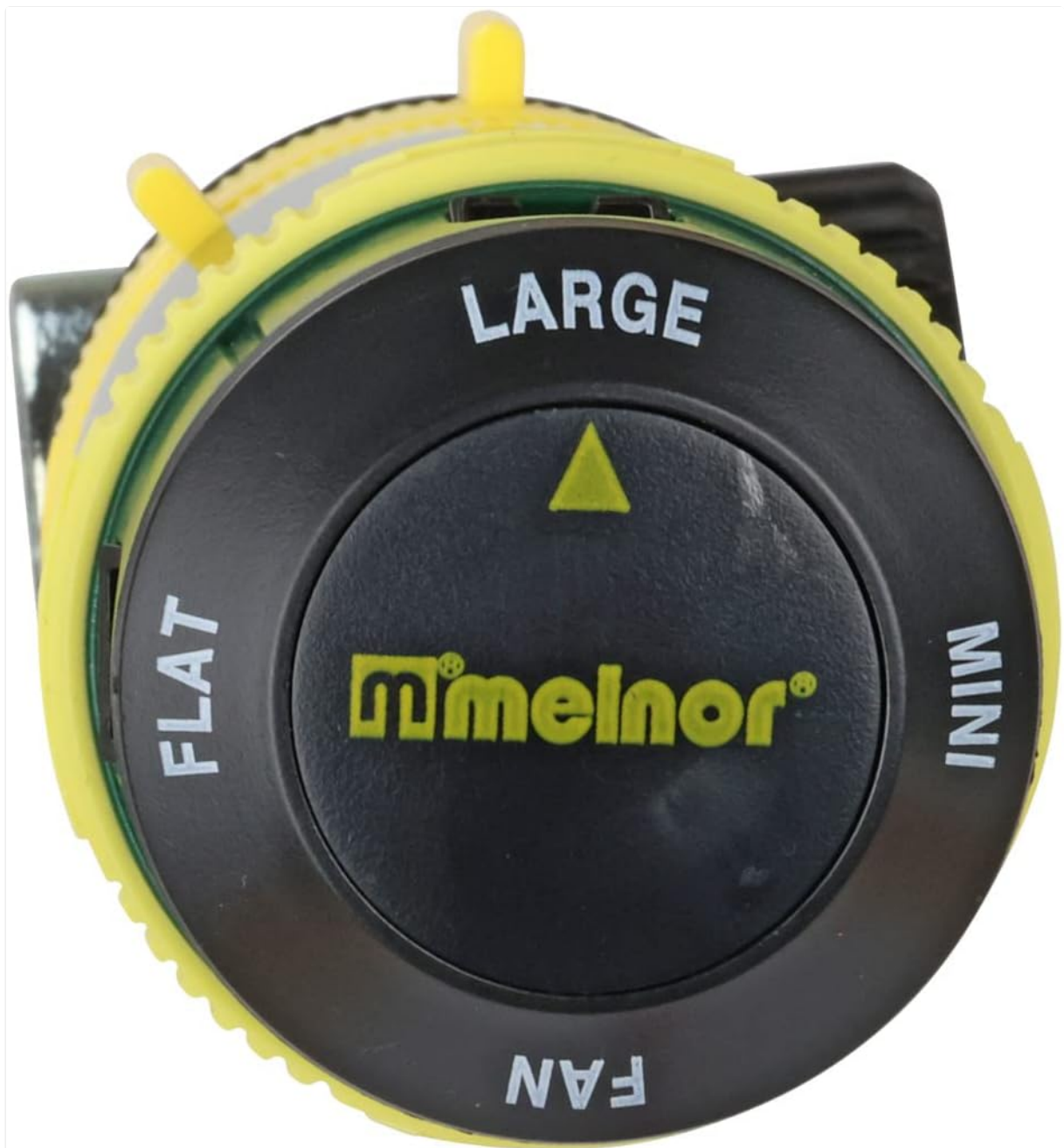
Close-up of the pattern selector dial on the sprinkler head.