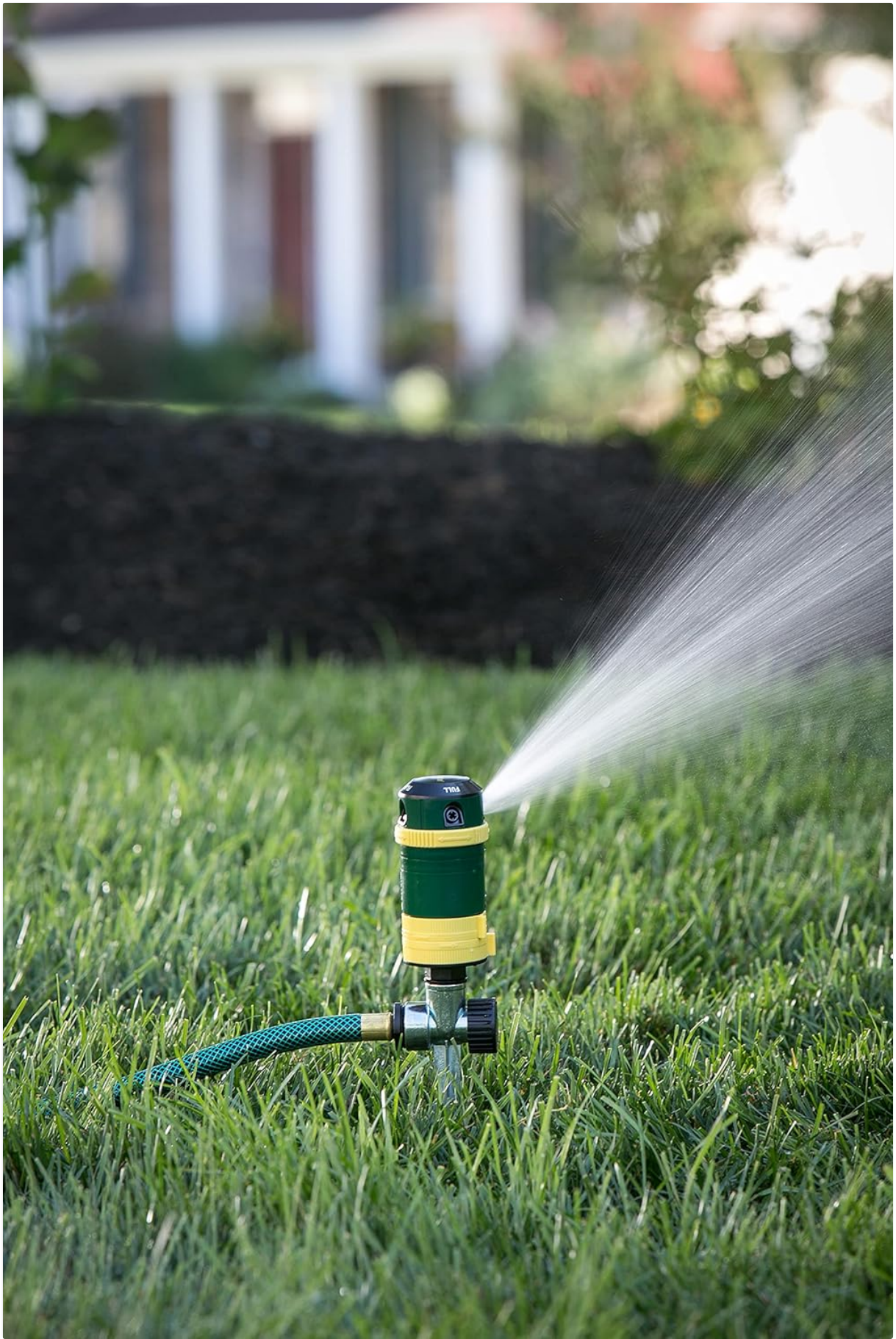
Sprinkler demonstrating a wide spray pattern in a lawn.