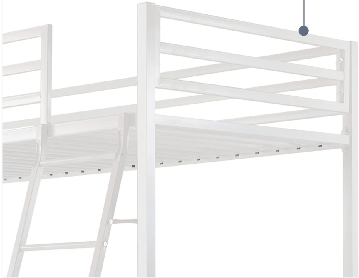
Image: Close-up of the top bunk's 13.2-inch high safety guardrail.