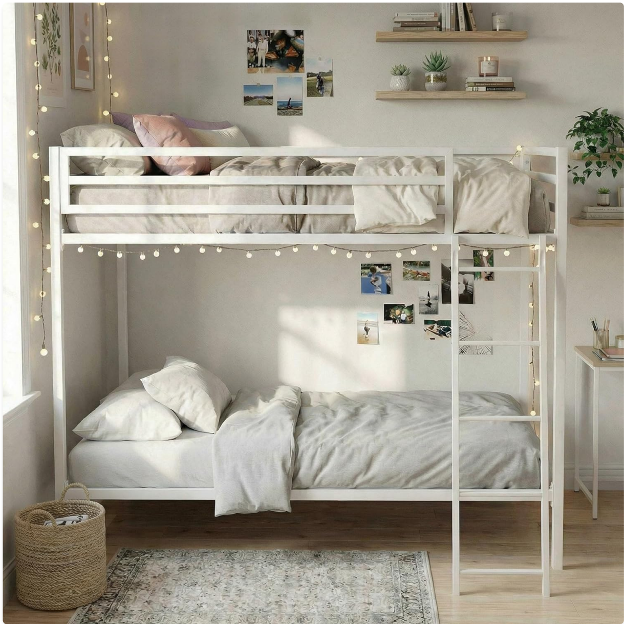
Image: Allewie Metal Bunk Bed in a Bedroom Setting, showcasing its modern design and functionality.