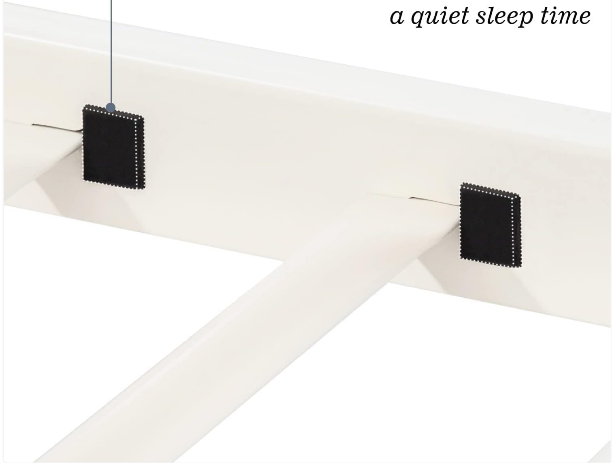
Image: Close-up of the plastic buckle design that secures the bed slats for noise reduction.

The plastic buckle can fixed the slats firmly to prevent the noise, leave a quiet sleep time