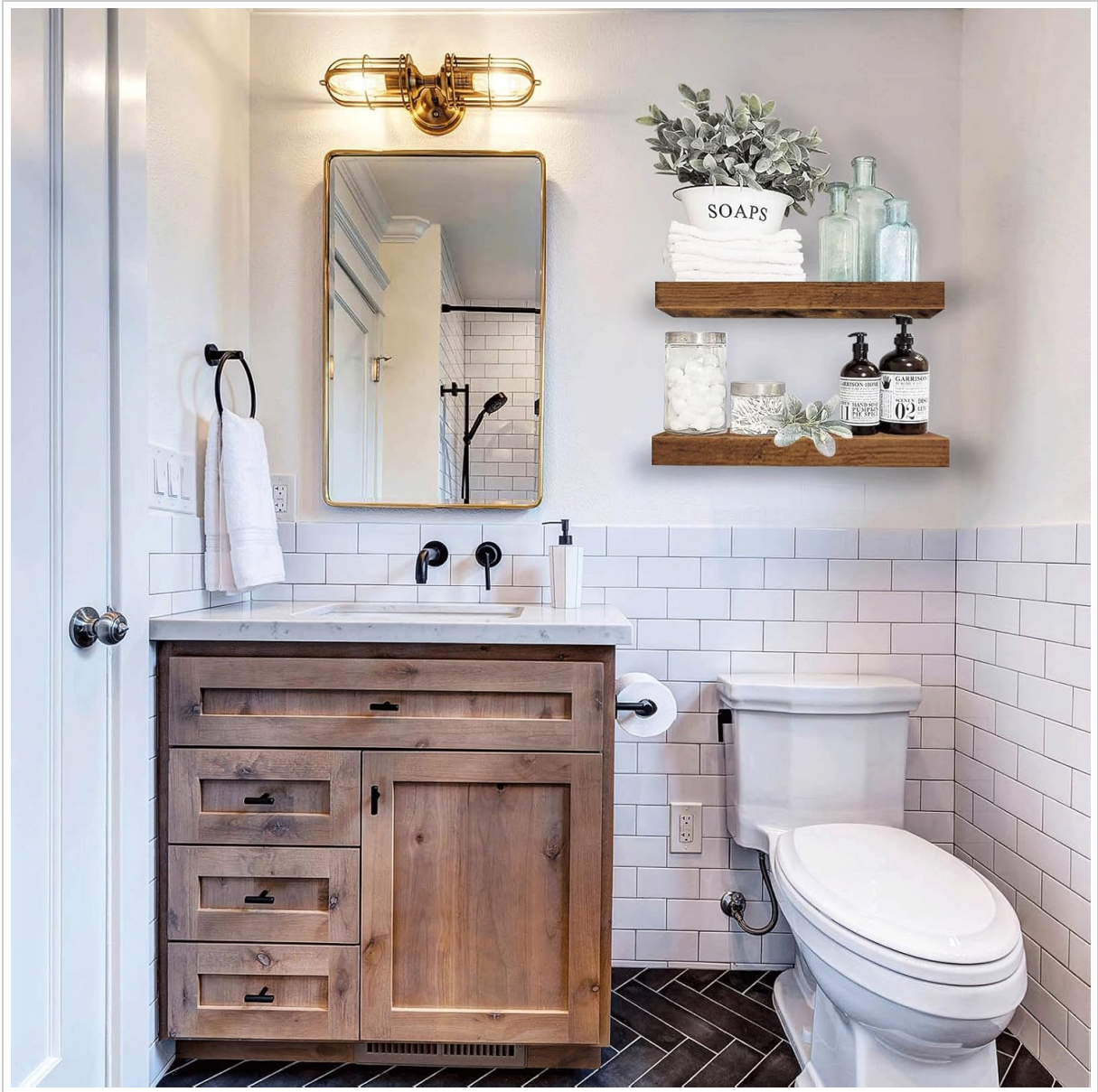
Image: Example of shelves used in a bathroom setting, displaying decorative items and folded towels.