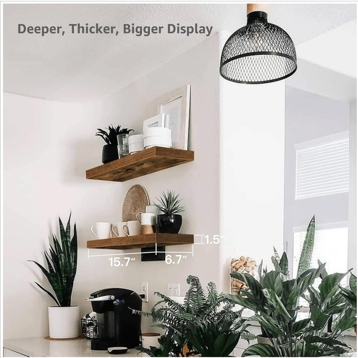
Image: Two installed floating shelves, illustrating the 15.7" width and 6.7" depth.