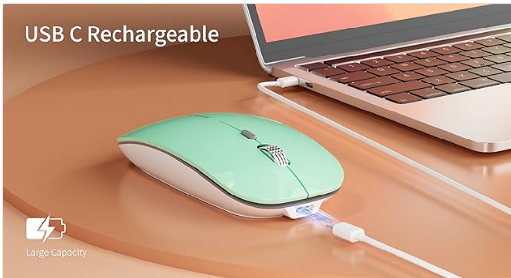
Image: The Uciiefy Q5 mouse on a desk, highlighting its silent click capability for a quiet user experience.