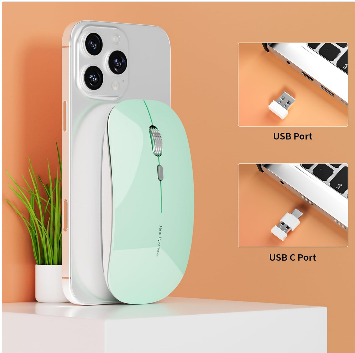
Image: The Uciefy Q5 mouse shown next to a smartphone, illustrating the USB and Type-C adapters for versatile connectivity.