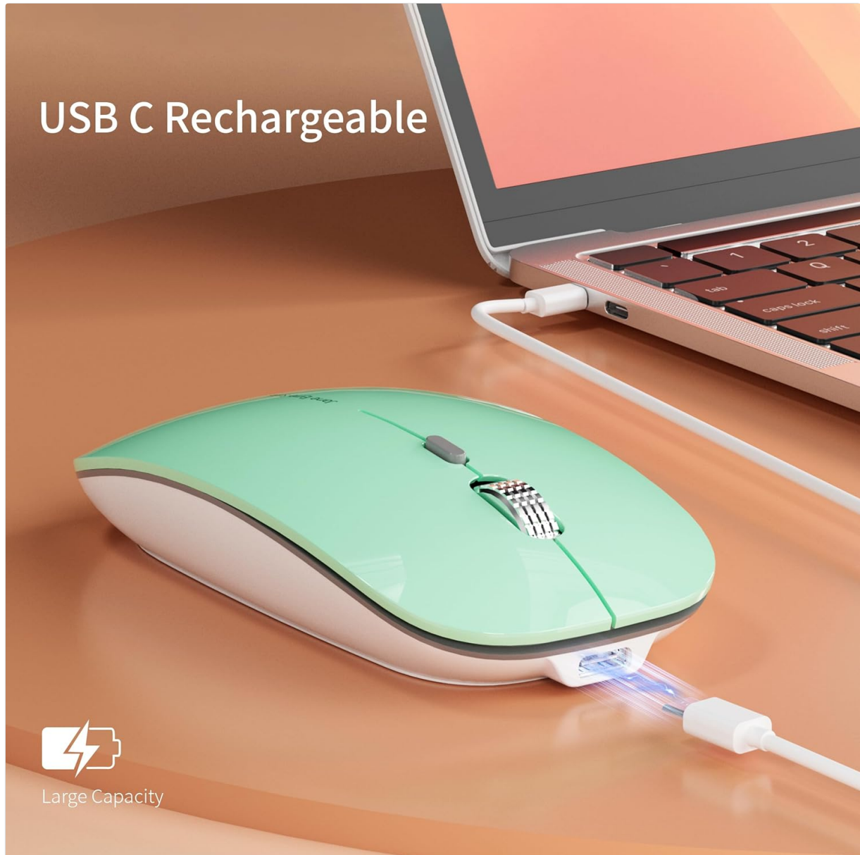
Image: The Uciefy Q5 mouse being charged via a USB cable connected to a laptop, indicating its rechargeable nature.