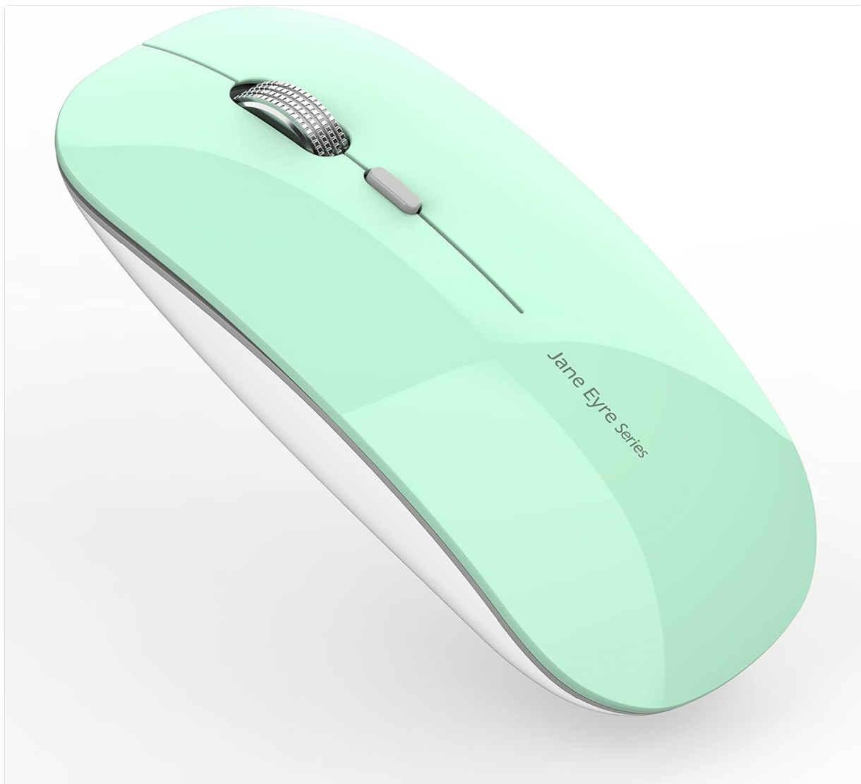
Image: The Uciety Q5 Slim Rechargeable Wireless Mouse, showcasing its sleek, ergonomic design in mint green.