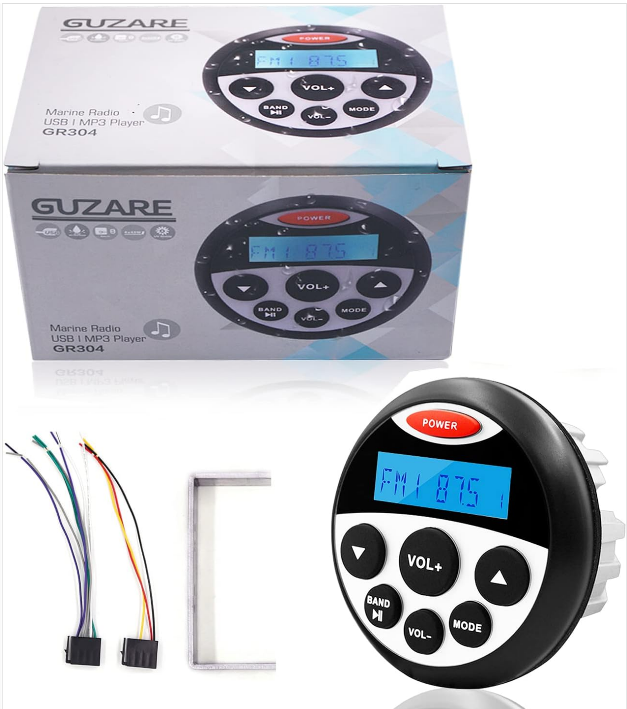
Figure 3.1: Overview of the receiver's wiring connections and included accessories.