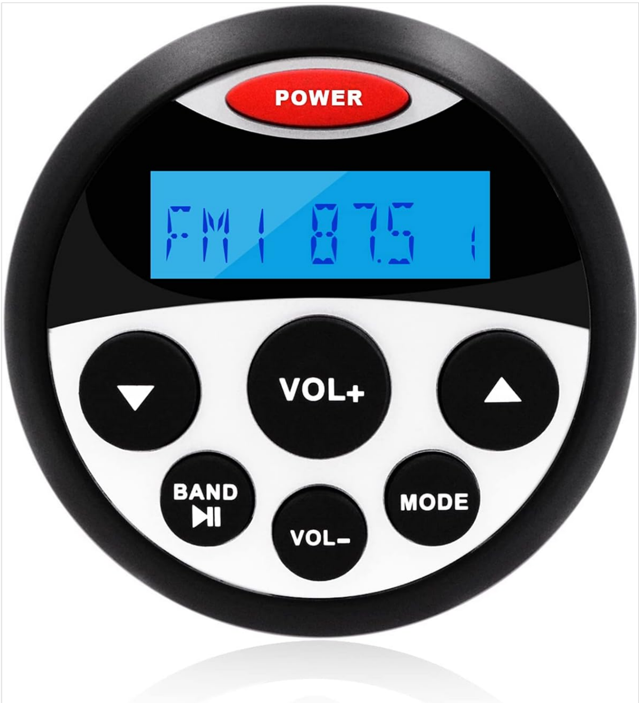
Figure 1.1: Front view of the GUZARE GR304 Marine Stereo Receiver, showing the display and control buttons.