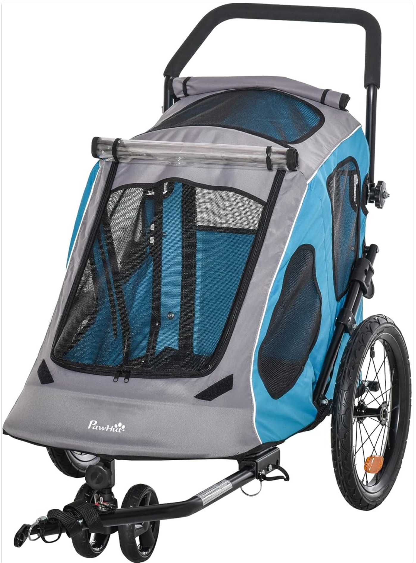
Image: The PawHut 2-in-1 Dog Bike Trailer Pet Carrier Stroller, showcasing its primary design in blue and grey.