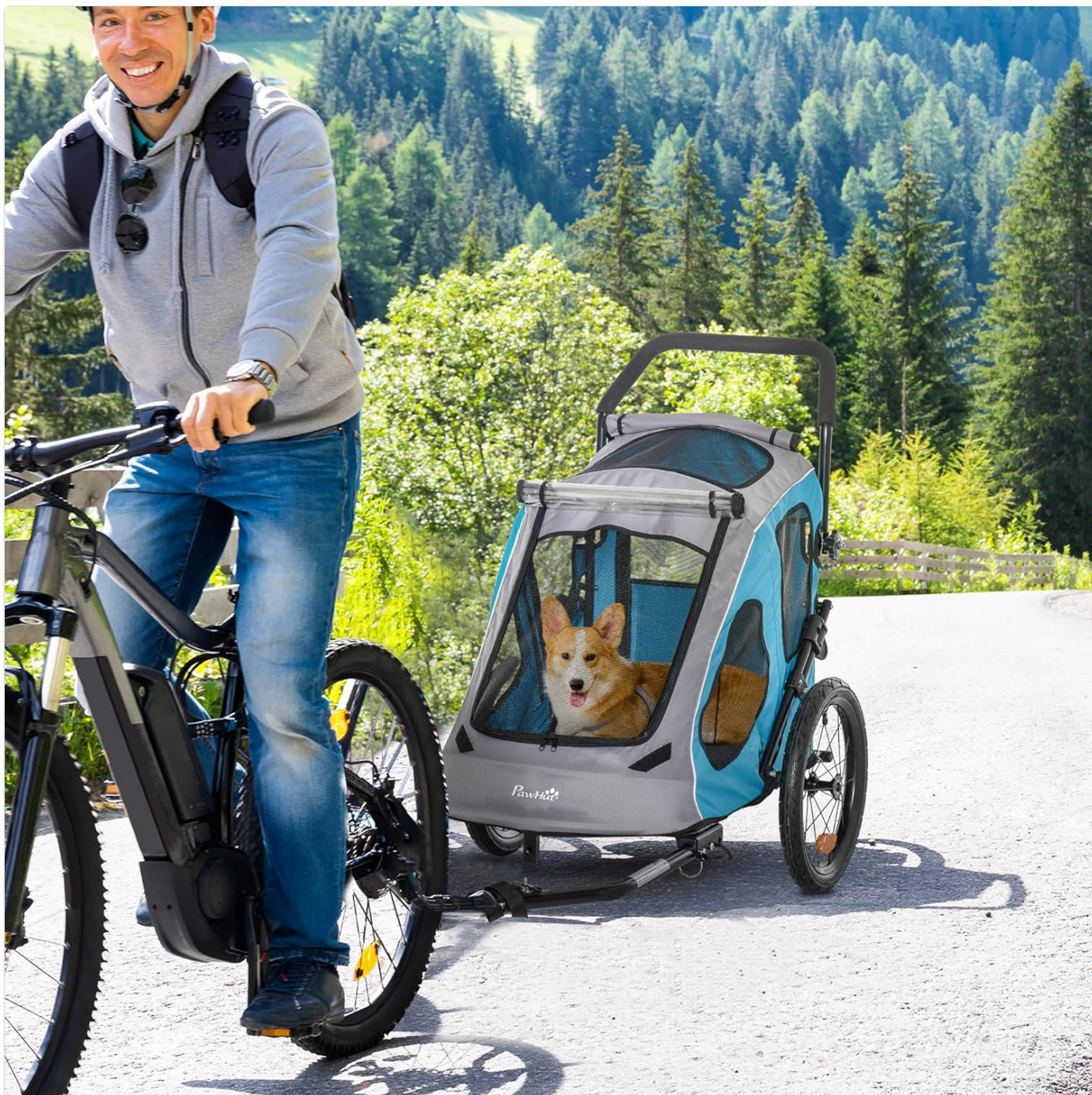
Image: A man cycling with the PawHut dog trailer attached to his bicycle, demonstrating its use as a bike trailer with a dog comfortably seated inside.