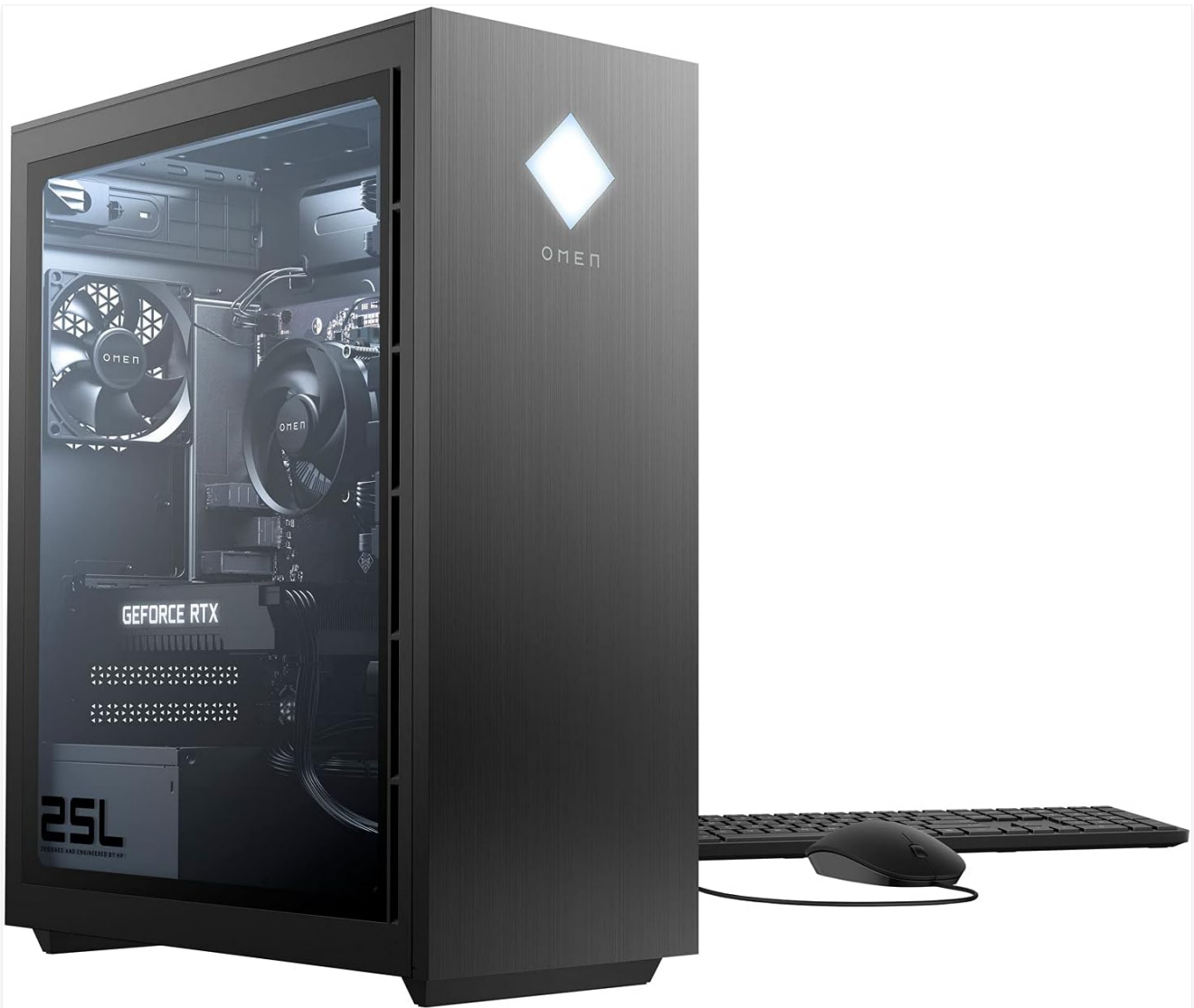
Image: The HP Omen 25L Gaming Desktop shown with its included keyboard and mouse, illustrating a typical setup configuration.