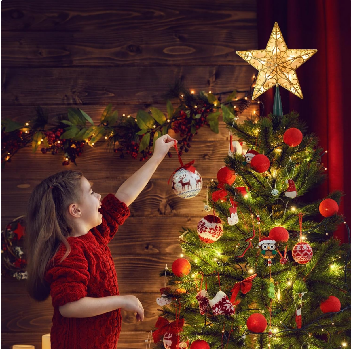
Image: A child carefully placing the star tree topper on a Christmas tree, illustrating the final step of setup.