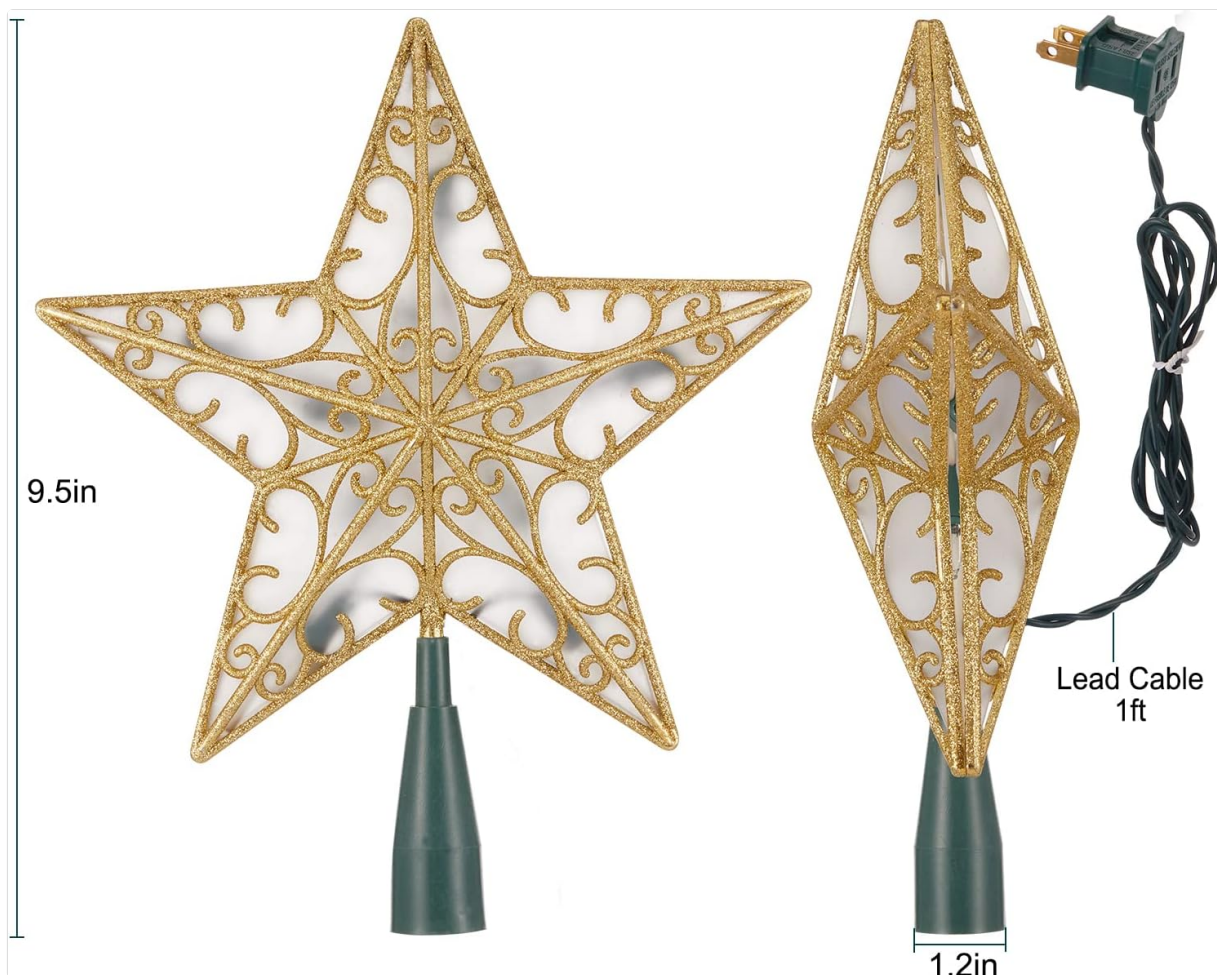
Image: A diagram illustrating the 9.5-inch height and 8-inch width of the star tree topper.