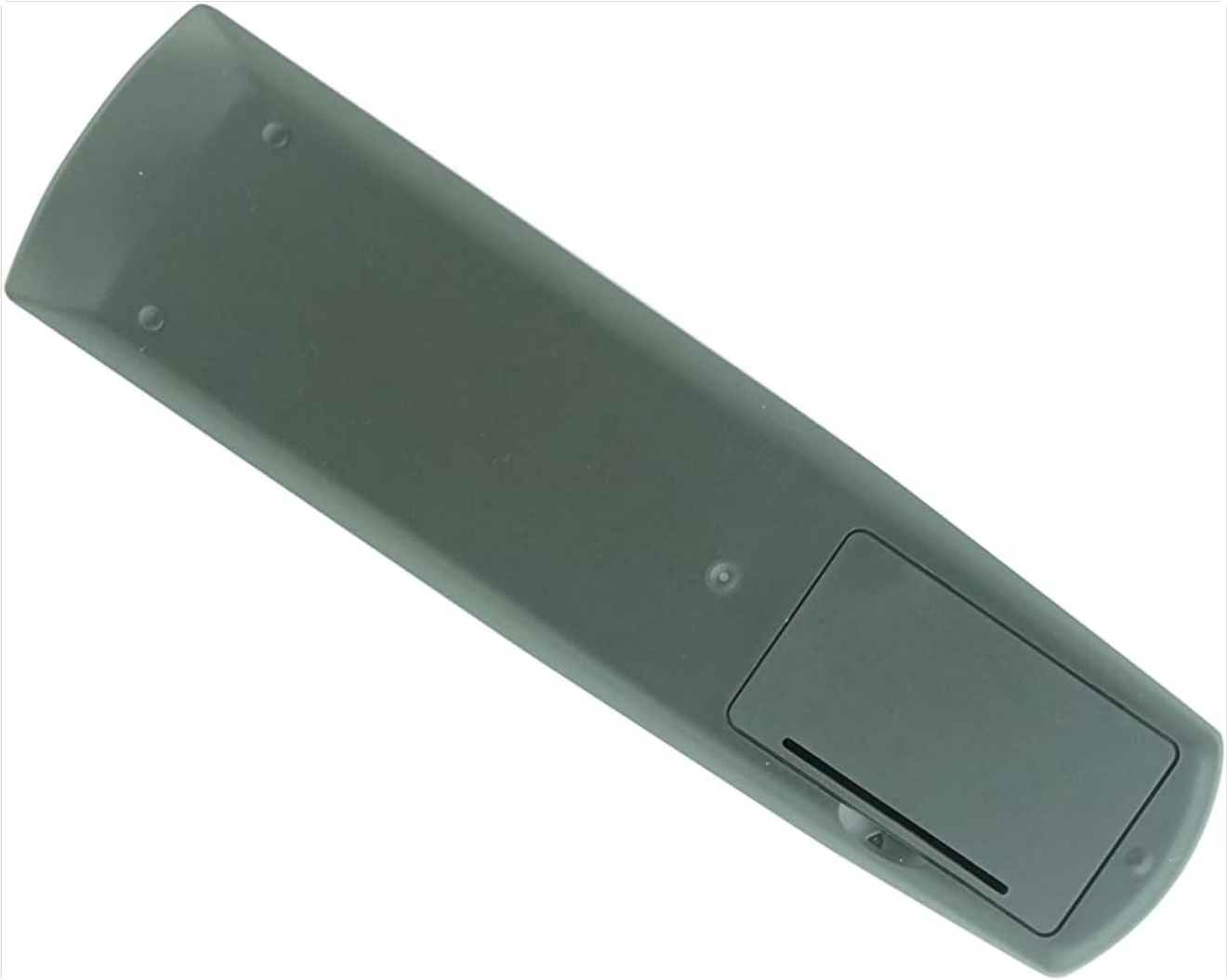
Figure 3: Rear view of the remote control, showing the battery cover securely in place.