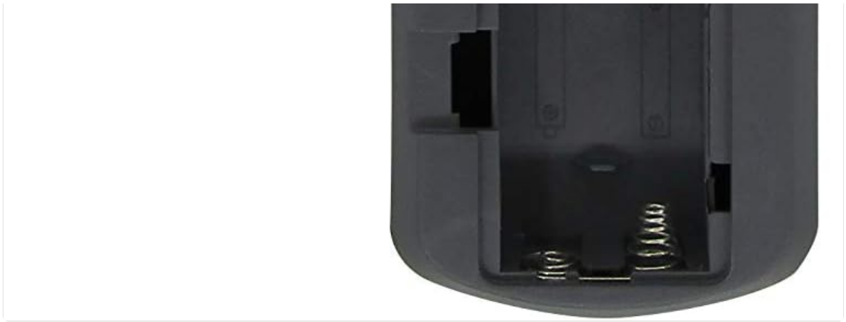
Figure 2: Rear view of the remote control with the battery cover removed, illustrating the battery insertion process.

Note: Remove batteries if the remote control will not be used for an extended period to prevent leakage and damage.