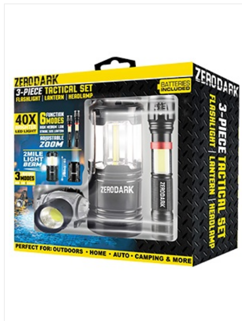
Image: The ZeroDark collapsible camping lantern, showing its compact and extended forms.