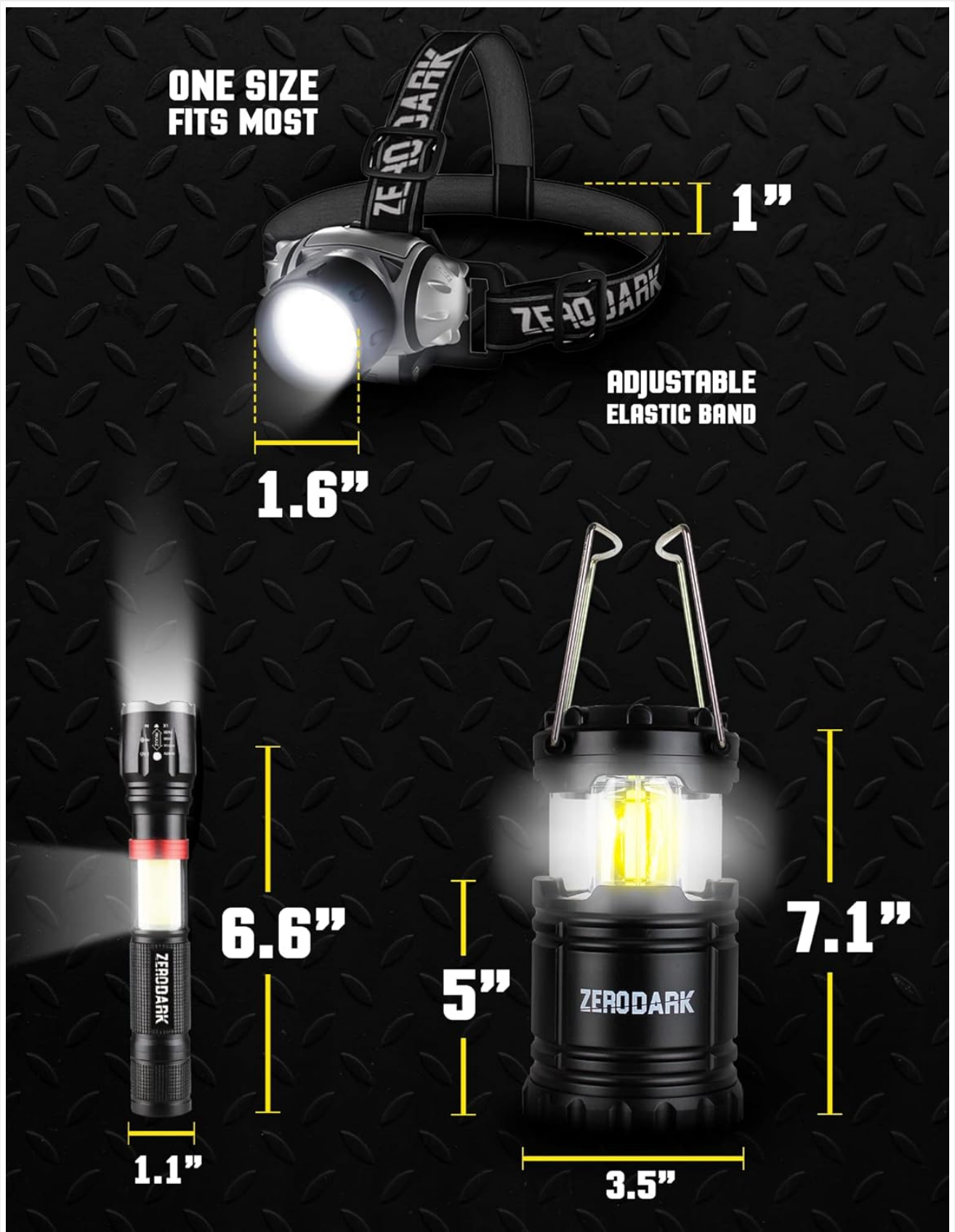
Image: Detailed dimensions for the ZeroDark flashlight, lantern, and headlamp.