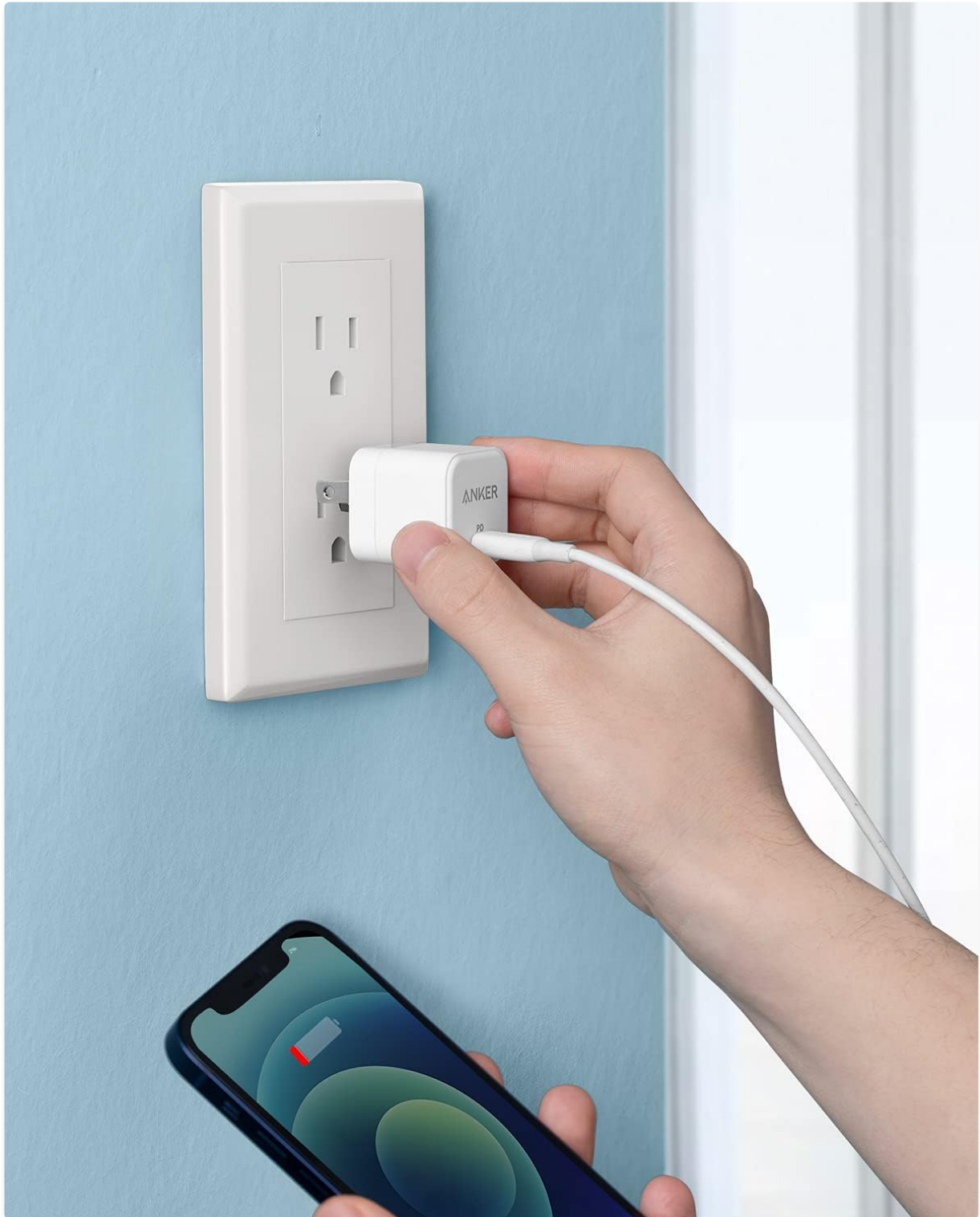
Image: A user connecting the Anker 20W USB C Charger to a wall socket, with a smartphone already connected and showing a charging indicator, illustrating the ease of use.

Once the charger is plugged into a wall outlet and your charging cable is connected, simply plug the other end of the cable into your device. The charger will automatically detect your device and deliver the optimal charging speed. The foldable prongs ensure a secure connection and easy portability.