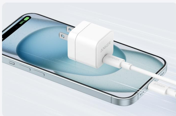
Image: The Anker 20W USB C Charger demonstrating its capability to charge an iPhone 13 three times faster than a standard 5W charger, reaching 50% in 29 minutes.

*Data based on internal testing using an original 5W charger to charge an iPhone 15 from 0 to 50%.