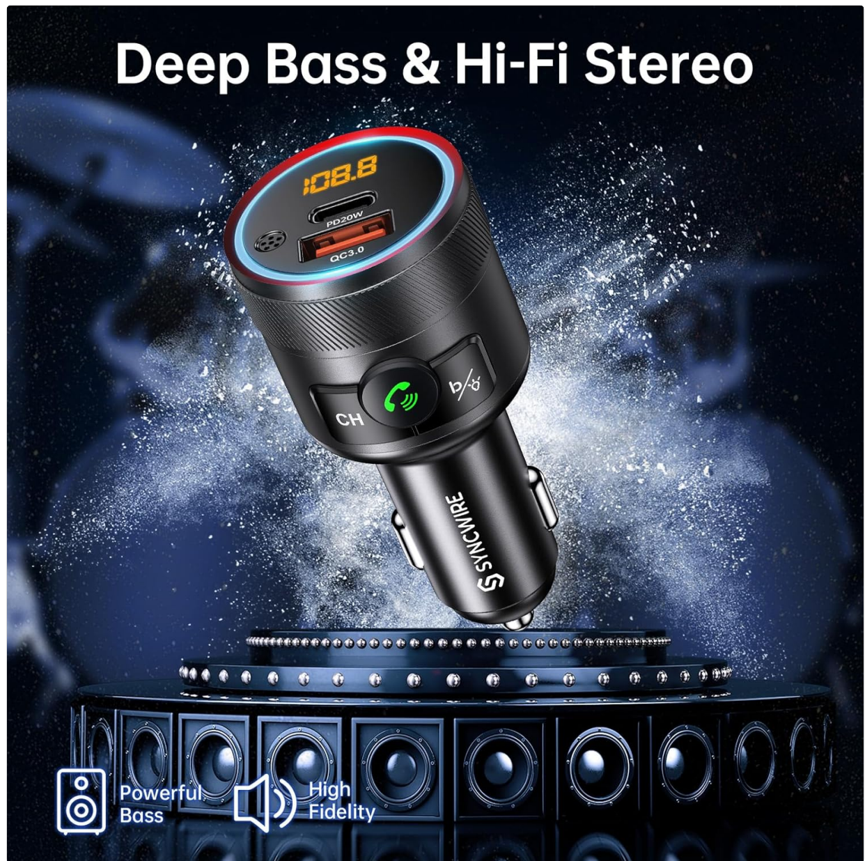
Figure 2: The Syncwire FM Transmitter emphasizes its Deep Bass and Hi-Fi Stereo capabilities, designed for enhanced audio quality.