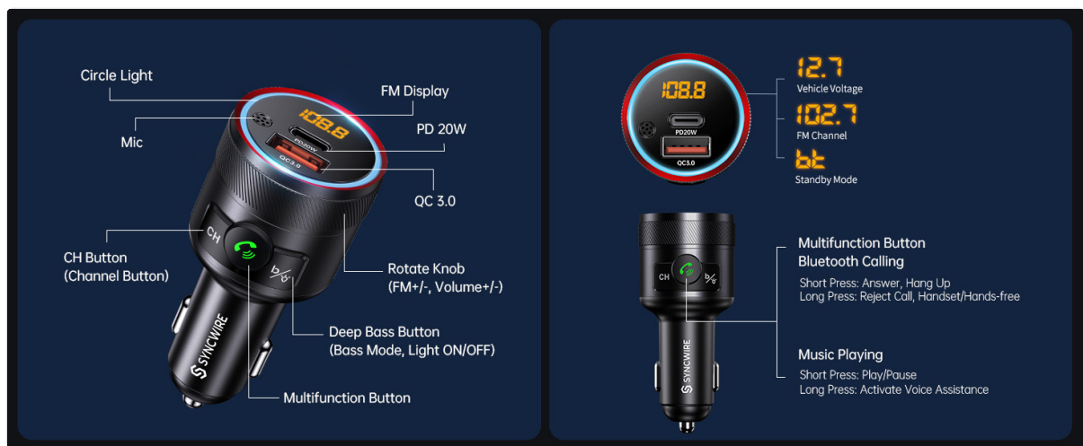
Figure 6: Demonstrates how to turn the circular LED light on or off by long-pressing the designated button.