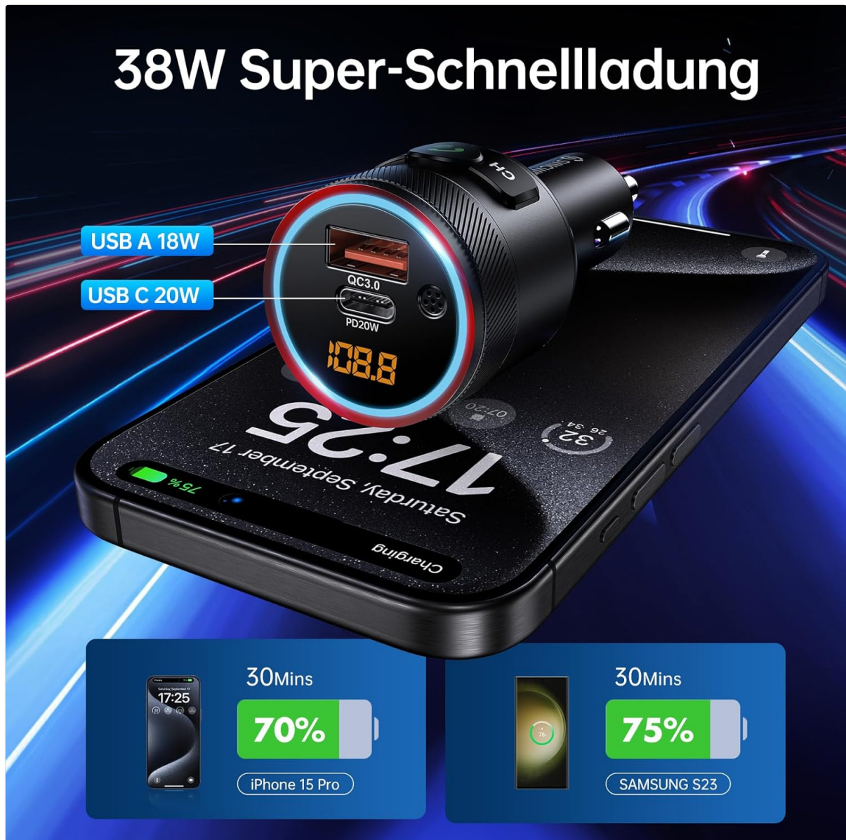
Figure 7: The device offers 38W super-fast charging with both USB-A (18W) and USB-C (20W) ports, capable of rapidly charging smartphones.

The transmitter features a Quick Charge 3.0 port (USB-A) and a Type-C PD 20W port for fast charging. The maximum total power output is 38W, allowing for efficient charging of two devices simultaneously.