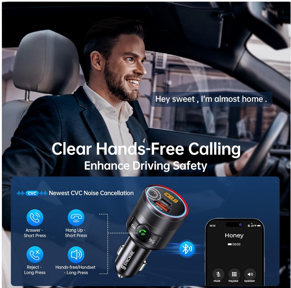
Figure 4: The device supports clear hands-free calling with dedicated buttons for answering, rejecting, and hanging up calls.