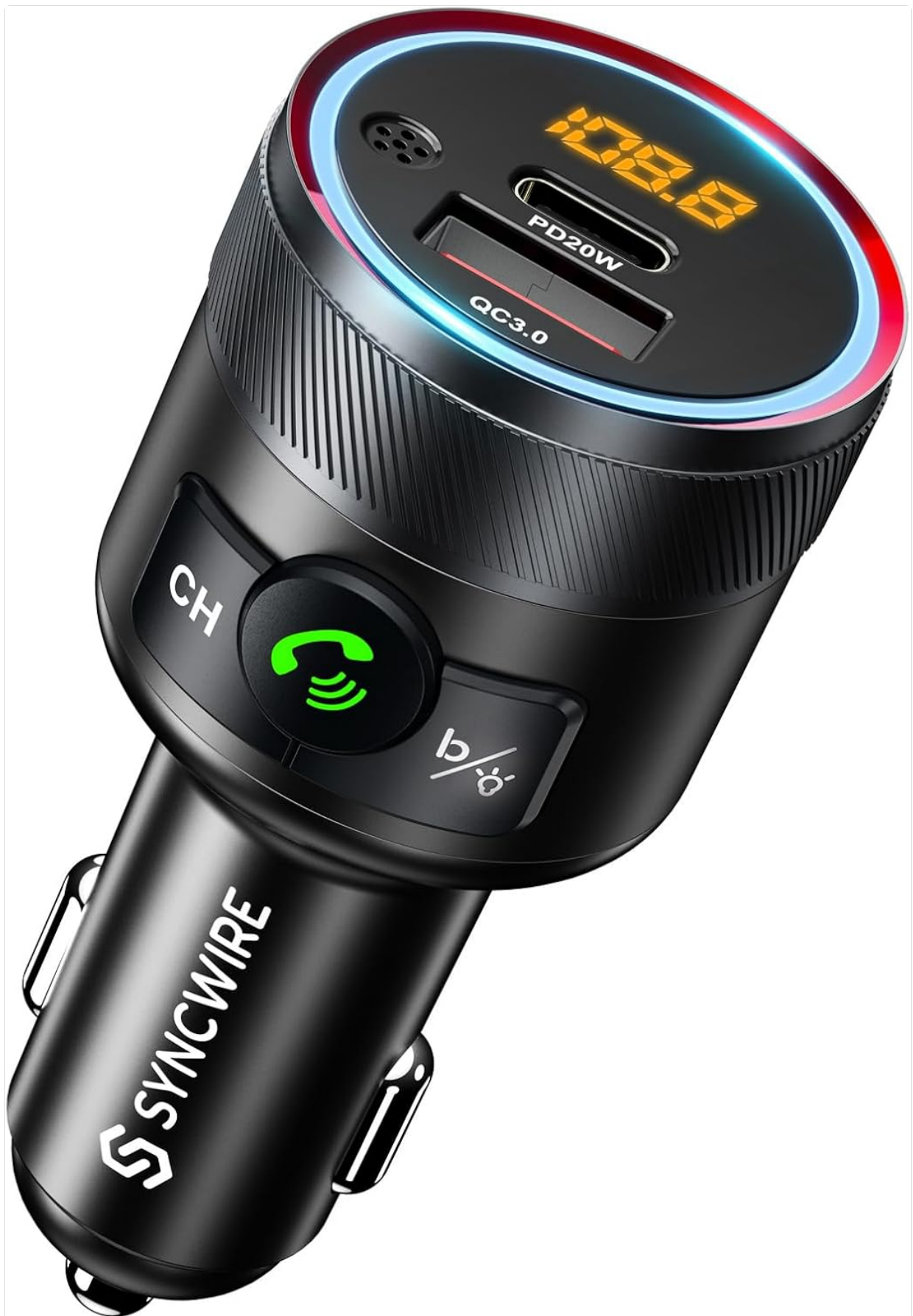
Figure 1: Front view of the Syncwire Bluetooth 5.4 FM Transmitter, showing the LED display, USB-C PD20W port, and QC3.0 USB-A port. The device also features a rotatable ring knob and control buttons for channel selection and calls.