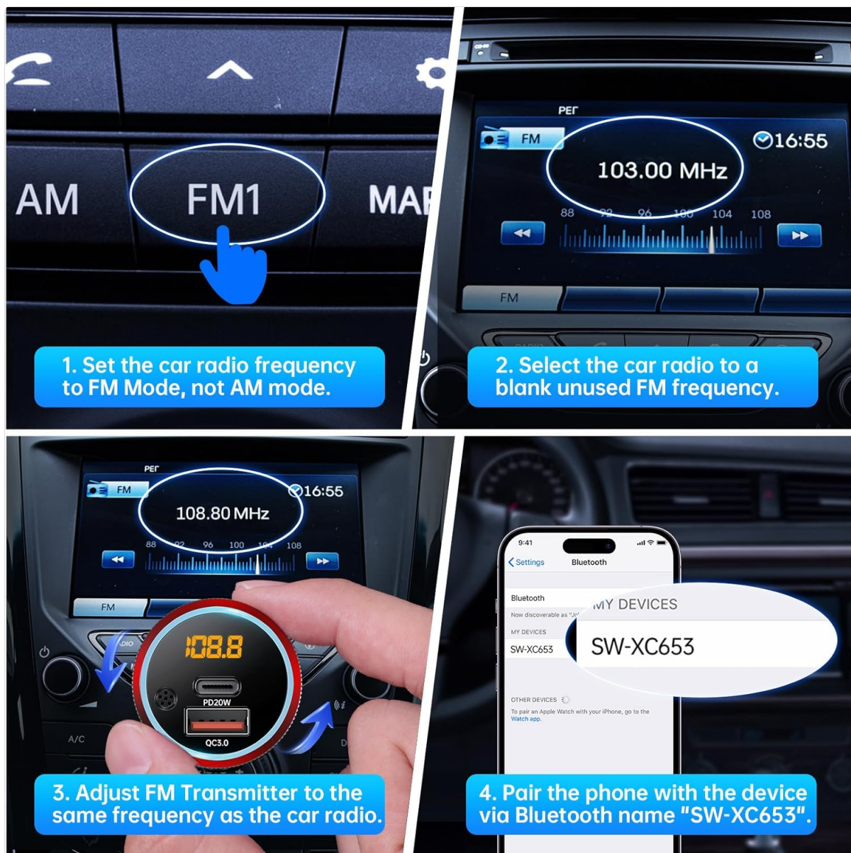
Figure 3: Visual guide for setting up the FM Transmitter, including selecting FM mode on the car radio, finding a blank frequency, adjusting the transmitter, and pairing via Bluetooth.