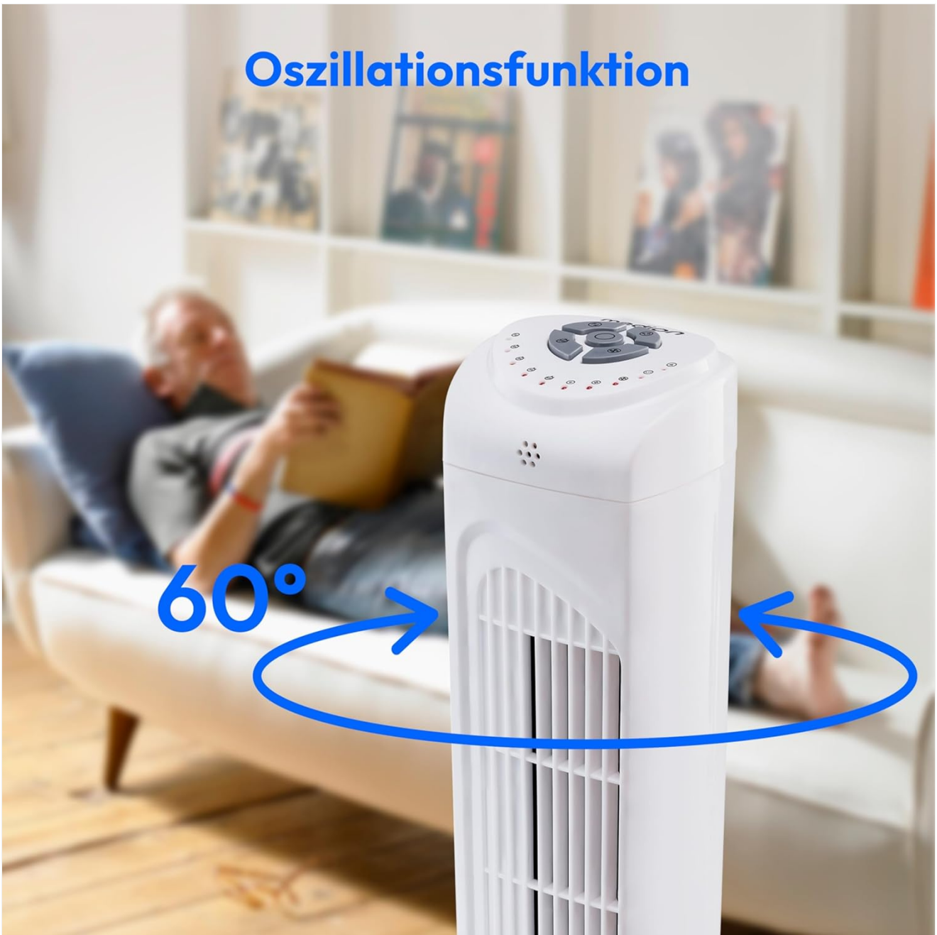
Image: Detailed view of the fan's top control panel, showing buttons for power, speed settings (3 levels), timer, and oscillation.