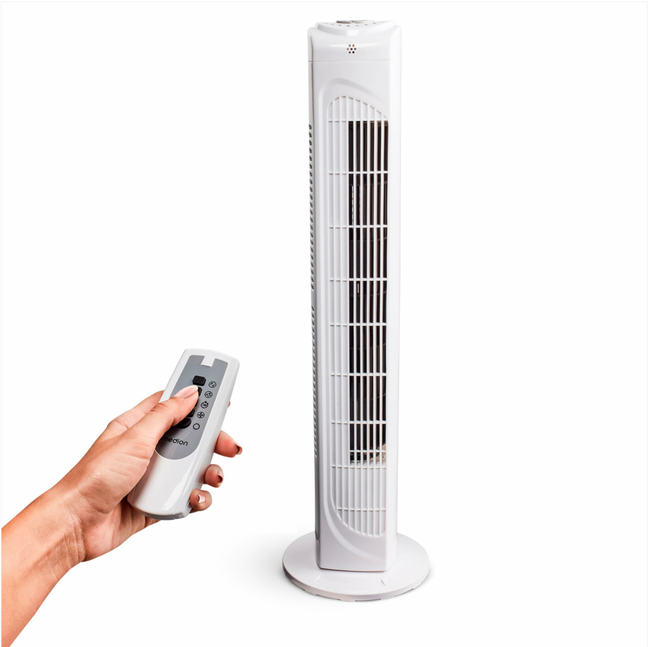
Image: The MEDION MD 10319 Tower Fan, fully assembled with its base, ready for use.