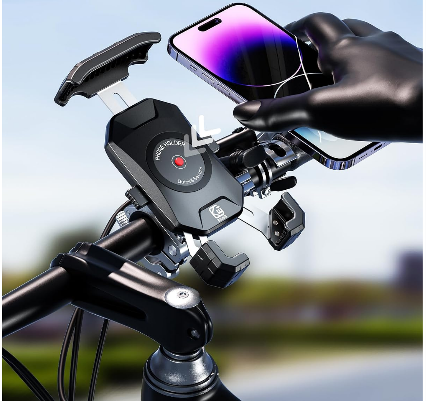
Image: Demonstrates the one-handed operation for placing a phone into the mount.

Single handed lifting and automatic clamping