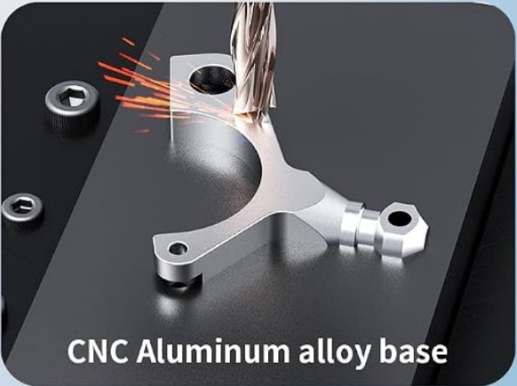
Image: Close-up of the durable 6061-T6 aluminum alloy handlebar mounting base.