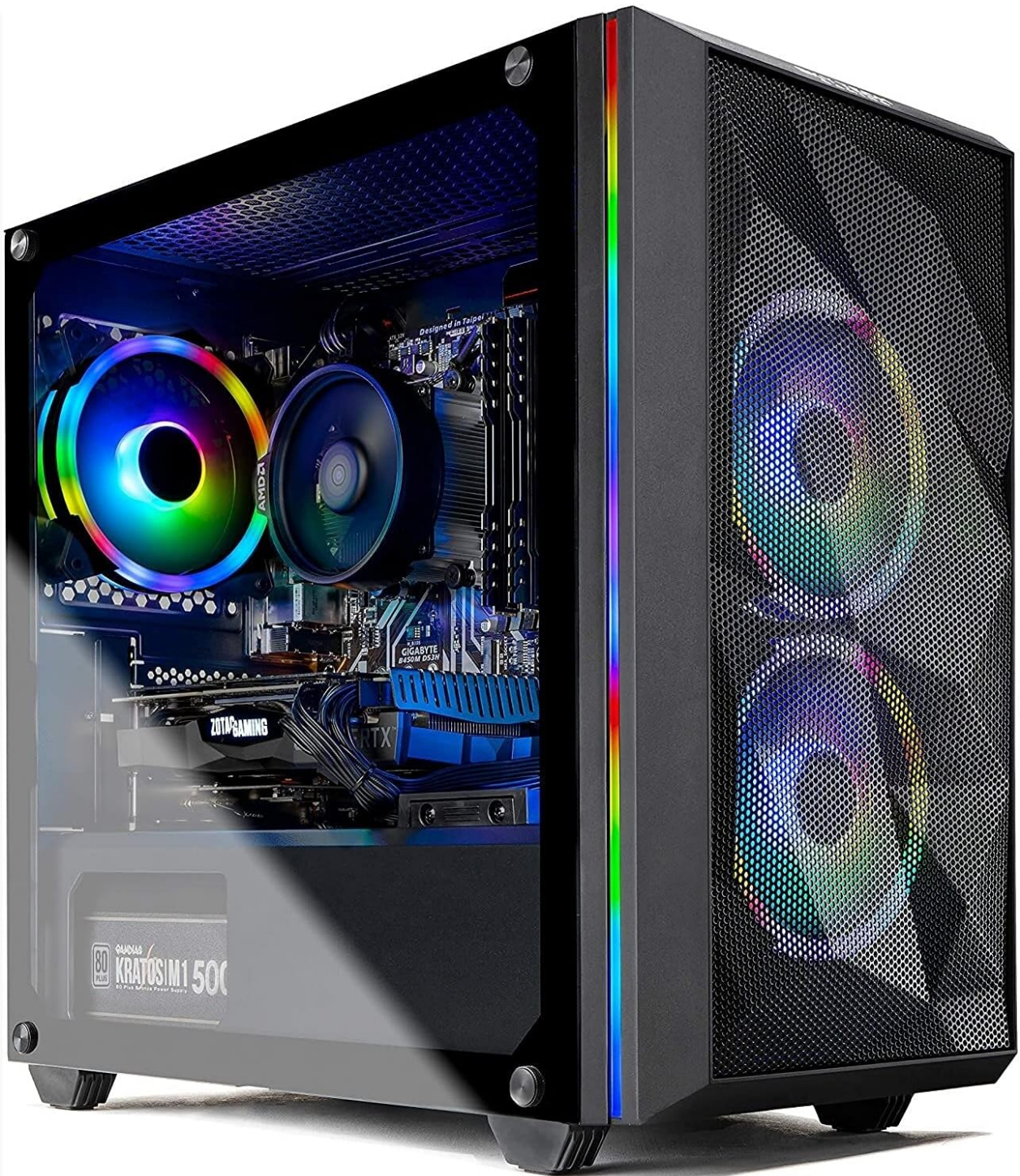
Image 1.1: Front and side view of the Skytech Chronos Mini Gaming PC, showcasing its RGB fans and tempered glass side panel.