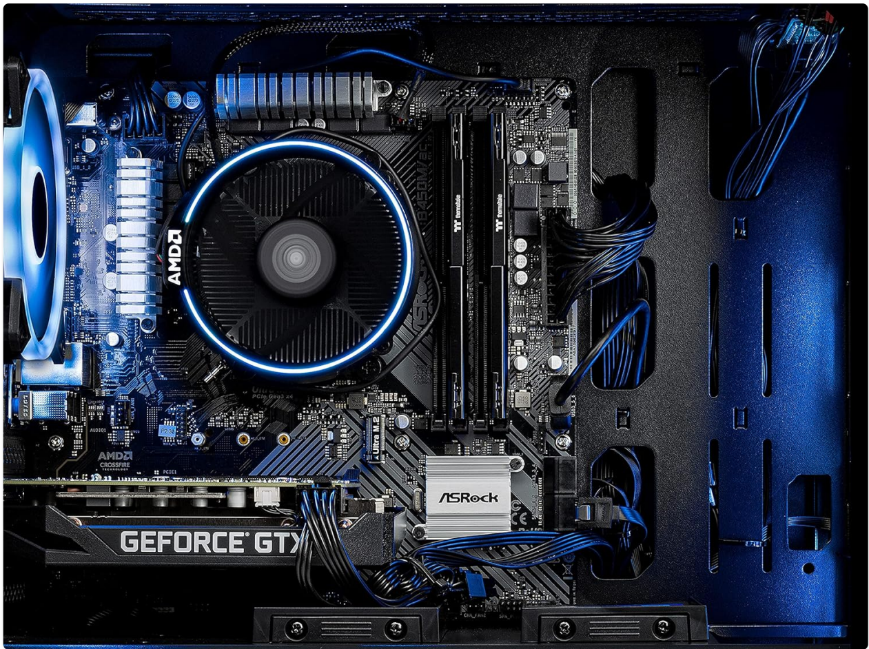
Image 3.1: An internal view of the PC, detailing the motherboard, CPU cooler, RAM modules, and the dedicated graphics card.