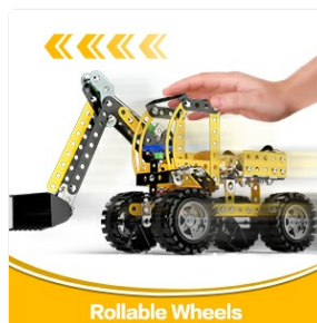
Image: The bulldozer model being pushed, highlighting its rollable wheels.