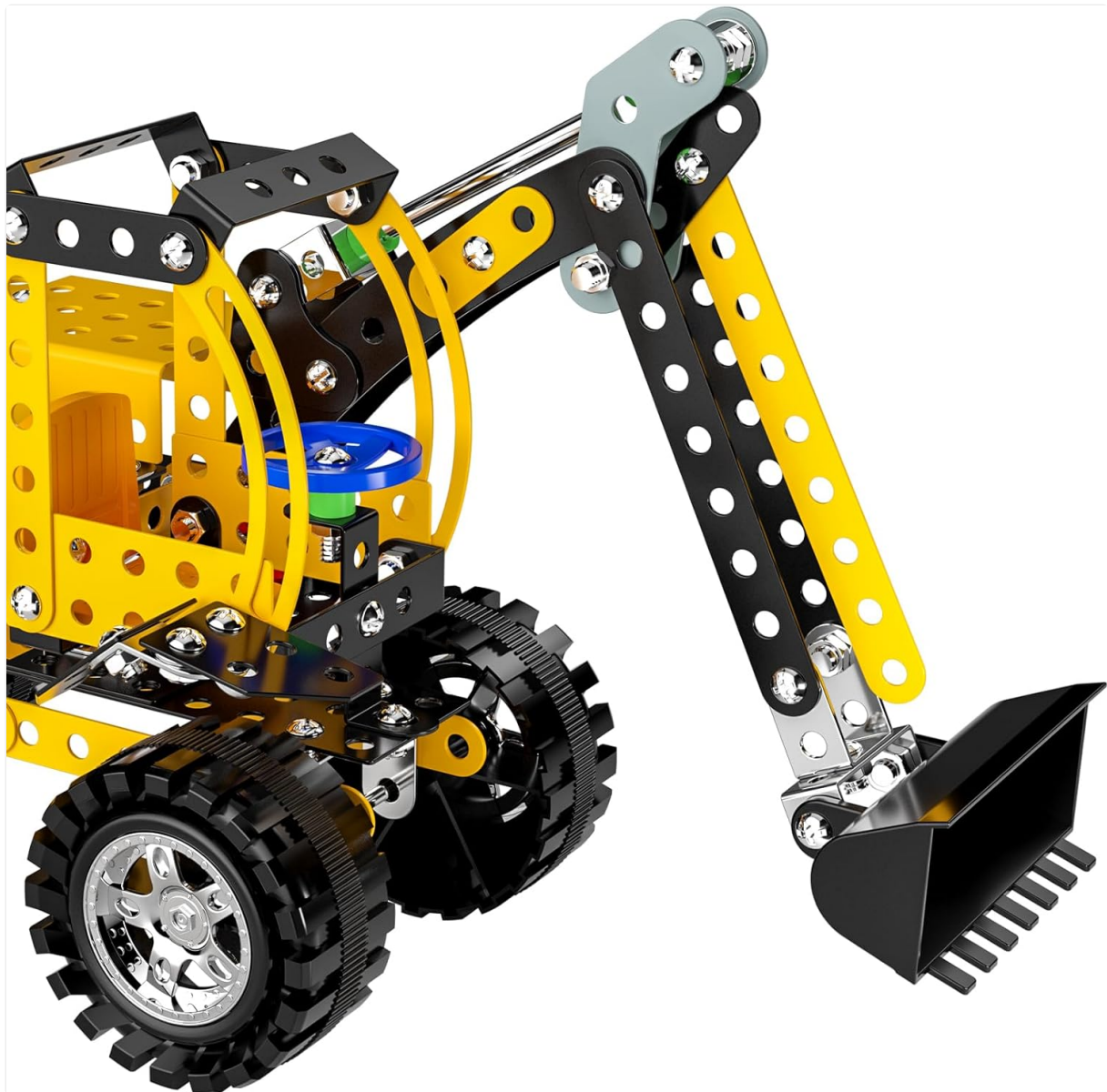
Image: The assembled bulldozer model with its key dimensions (height, length, width) indicated.