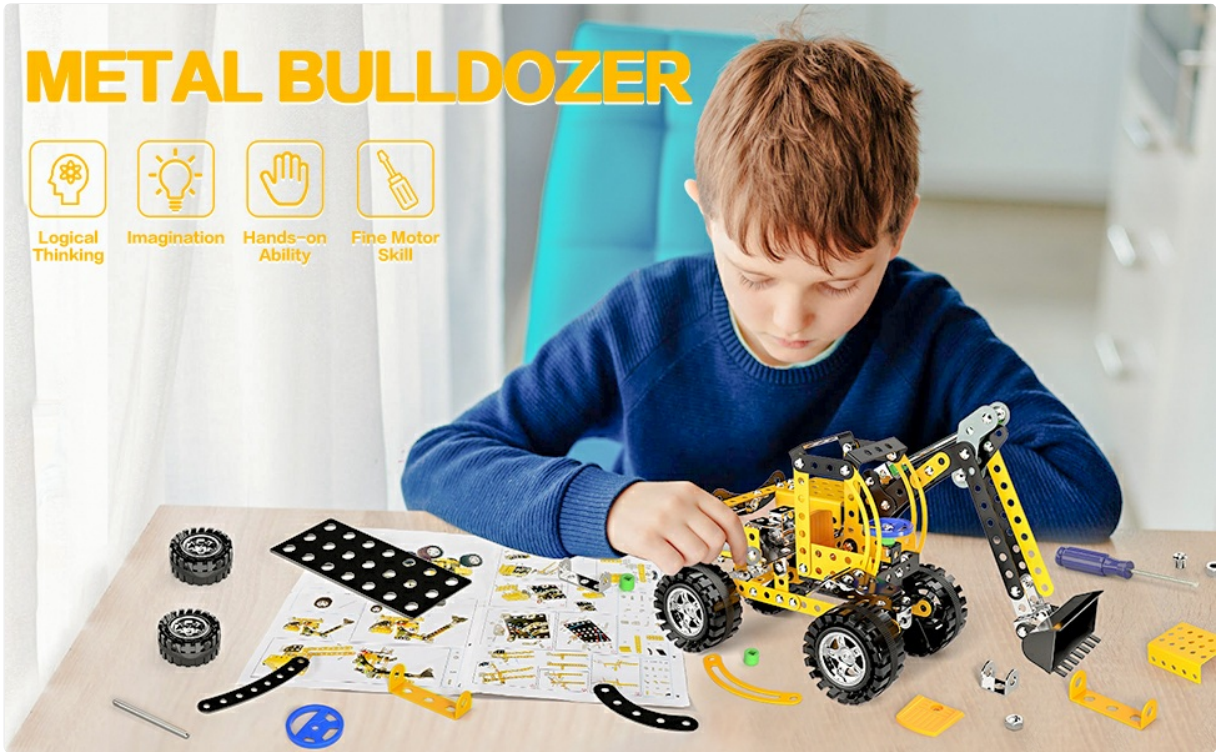
Image: A child focused on assembling the metal bulldozer model, with various parts, tools, and the instruction manual spread on a table.

The assembly process is estimated to take approximately 4 hours, providing a comprehensive hands-on learning experience.