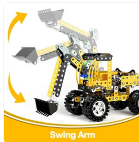
Image: The excavator arm of the model demonstrating its upward and downward swinging motion.