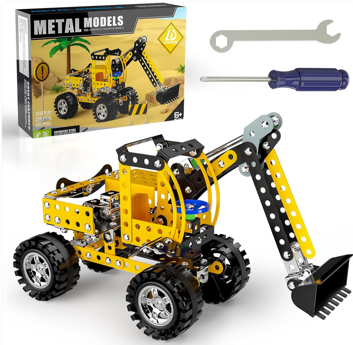
Image: The Lucky Doug Metal Building Construction Model Kit 9904, showing the assembled yellow and black bulldozer, its packaging, and the included wrench and screwdriver.